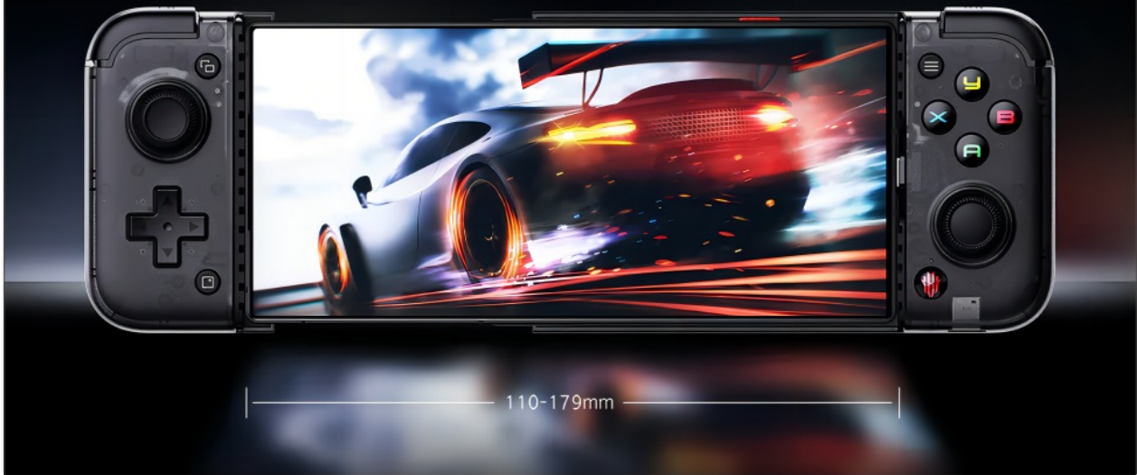
Image 4.2: A visual representation of the gamepad's key mapping capabilities, allowing users to customize controls.