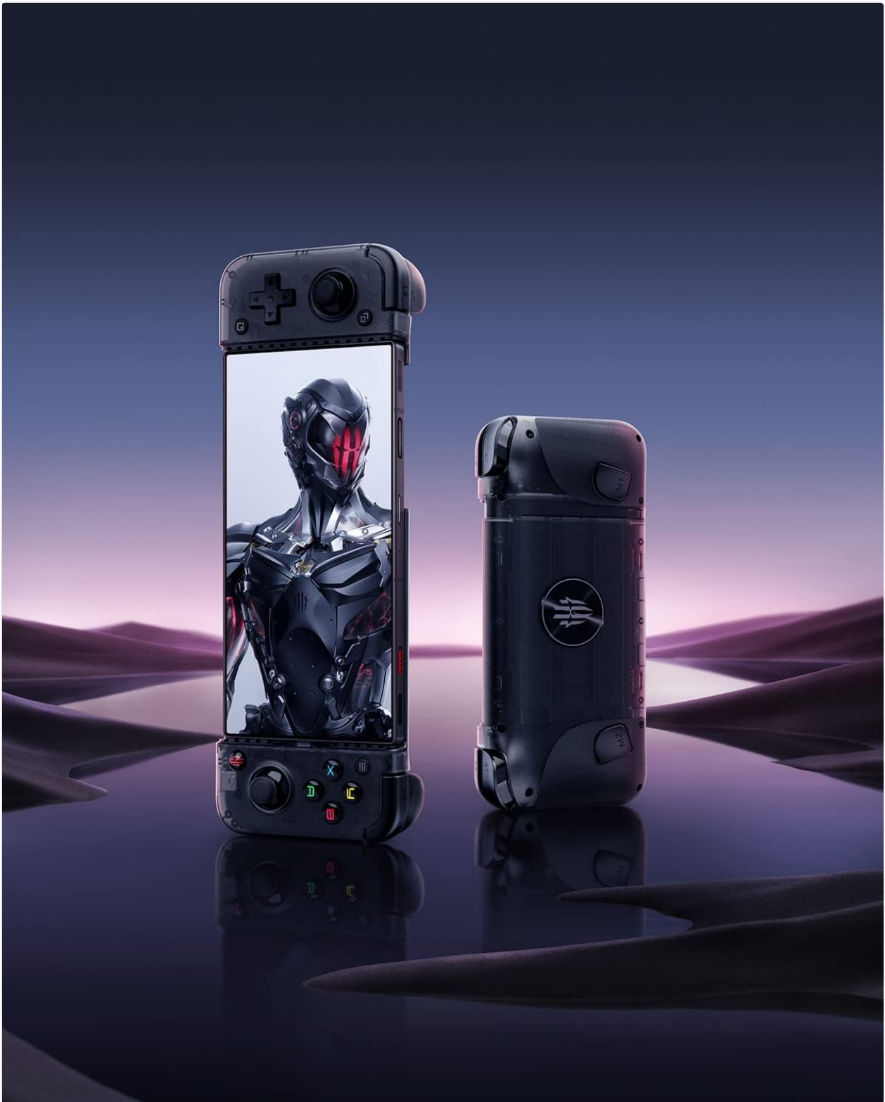
Image 5.1: The gamepad shown in both its compact, folded state and extended, ready-to-use configuration, demonstrating its portability.