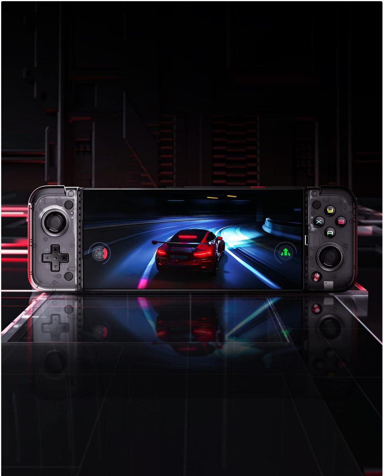
Image 4.1: The gamepad connected to a phone, actively displaying a racing game, demonstrating its use.

The gamepad features standard gaming controls including joysticks, a D-pad, action buttons (A, B, X, Y), shoulder buttons (L1, R1), and triggers (L2, R2). Familiarize yourself with the layout for optimal gameplay.