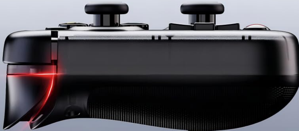
Image 2.3: Illustration of the M1 and M2 custom back triggers, positioned for ergonomic access during gameplay.

Hall Linear Triggers transmit electromagnetic induction with a precision that's accurate to the millimeter. The trigger pressure is more linear, smoother, and subtle changes can be felt in the fingertips.