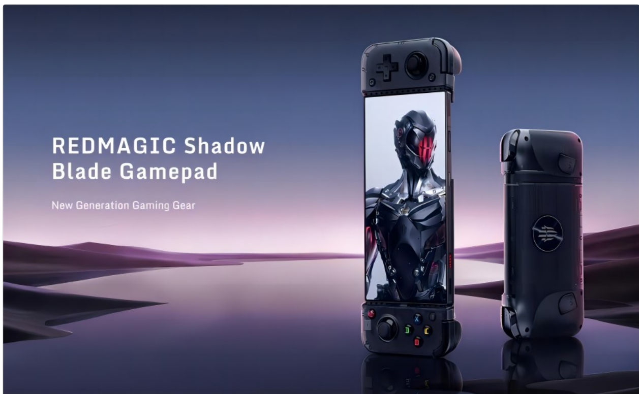
Image 2.1: The gamepad's transparent design, highlighting its internal components and aesthetic.