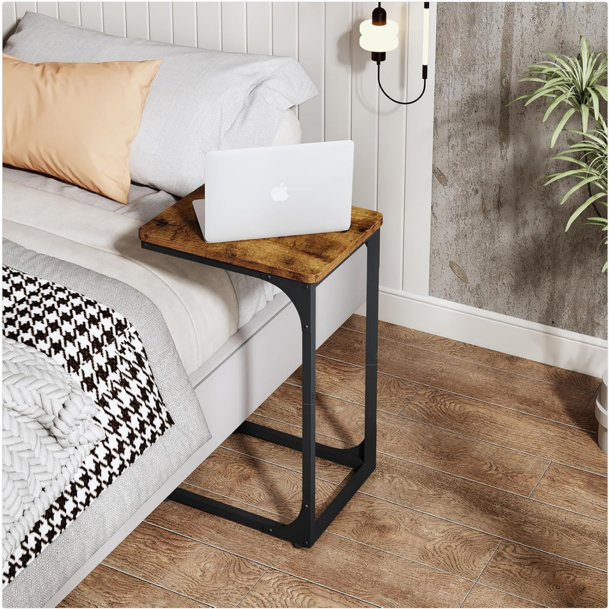
Figure 3: The C Table's design allows it to slide under a bed, functioning as a compact nightstand.