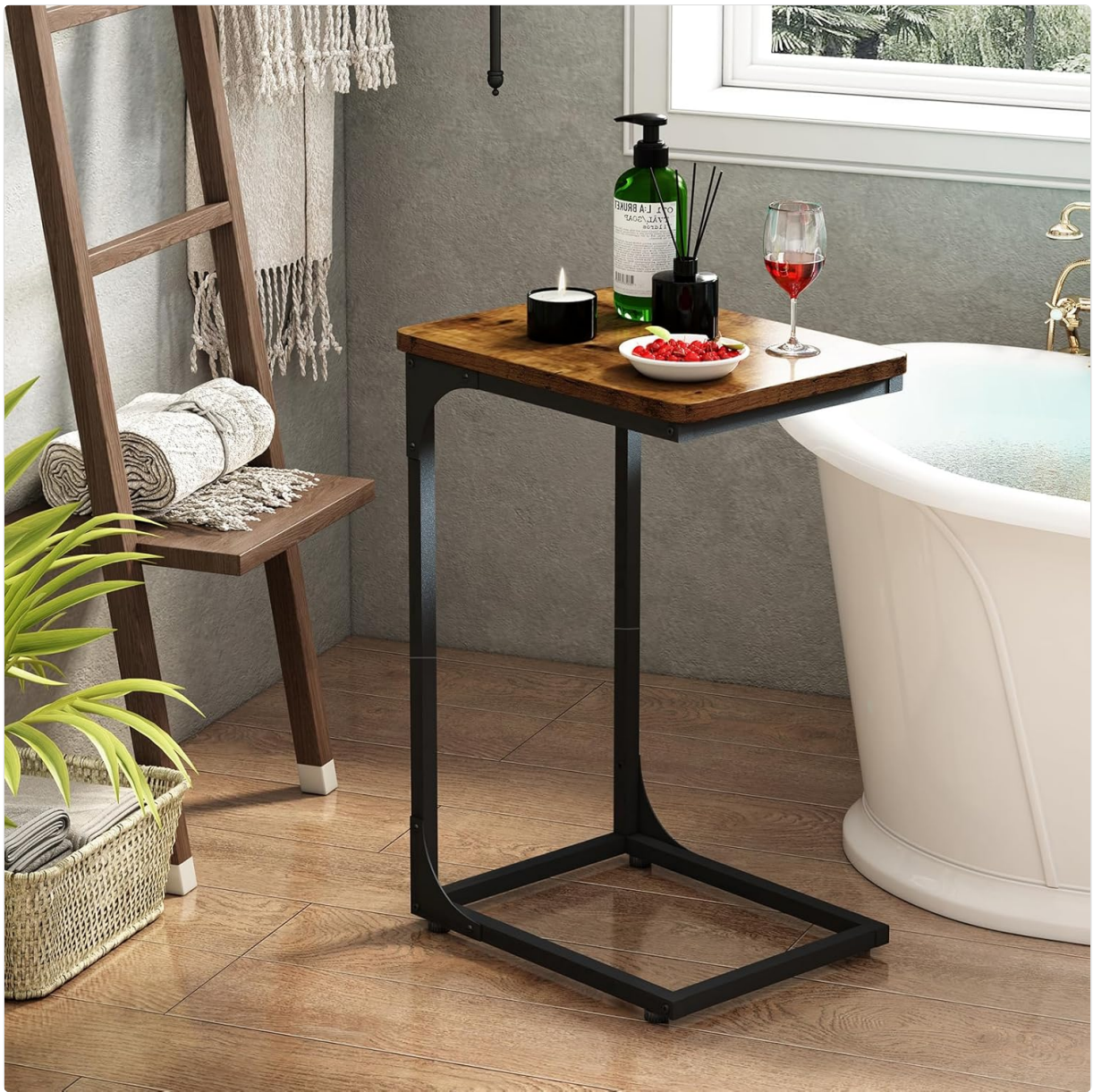
Figure 4: The C Table providing a handy surface in a bathroom, next to a freestanding tub.