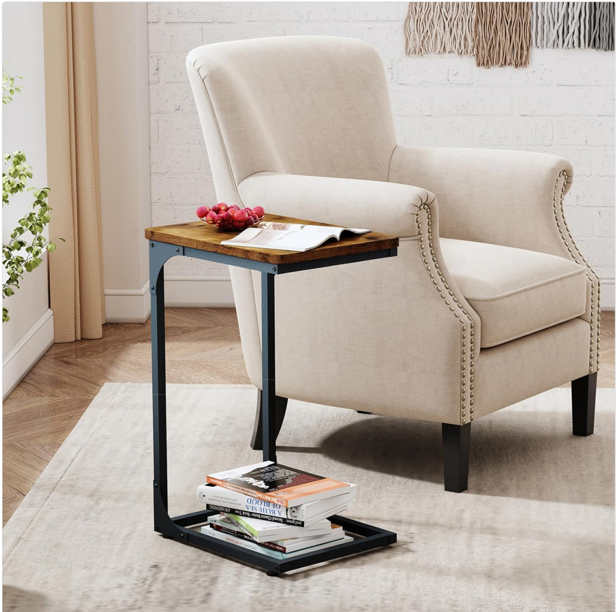
Figure 2: The C Table serving as a convenient surface next to a living room armchair.