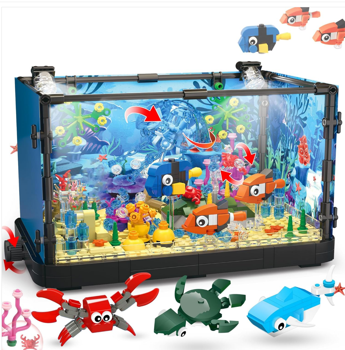
An overview of the fully assembled Jorumo Fish Tank Building Block Set, showcasing the intricate details of the marine environment and various creatures.