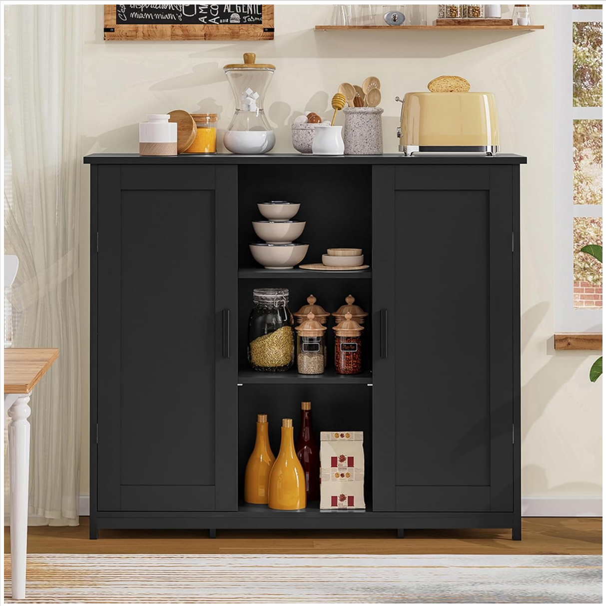
Figure 6.1: Cabinet utilized in a kitchen, showcasing its capacity for storing dishes, spices, and small appliances.