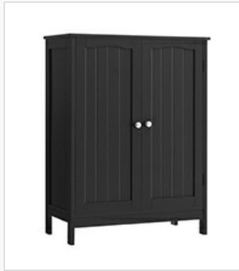
Figure 4.3: Magnetic door holder ensuring secure closure of the cabinet doors.