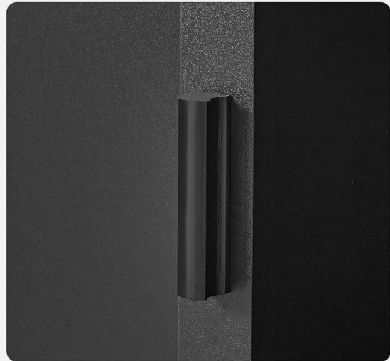
Solid Wood Handles