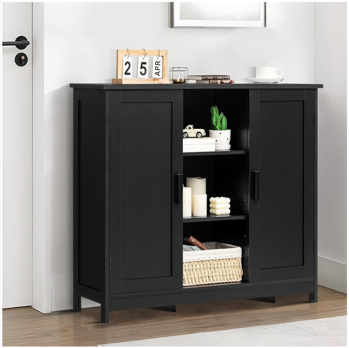
Figure 6.2: Cabinet positioned in an entryway, demonstrating its use for organizing daily essentials and decor.