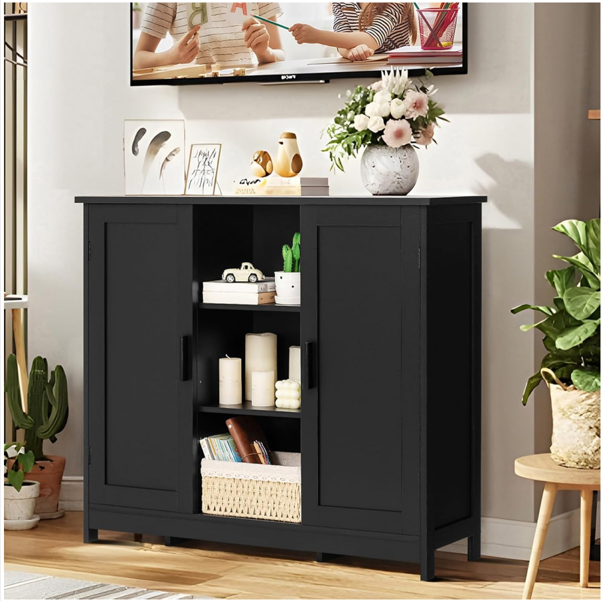
Figure 6.3: Cabinet serving as a media console or accent piece in a living room environment.

Your browser does not support the video tag.