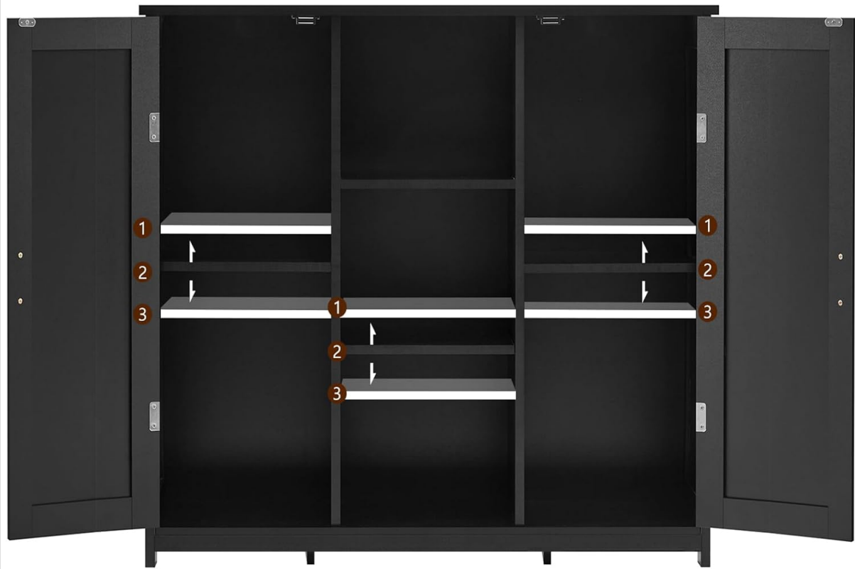
Figure 4.1: Adjustable shelves and overall dimensions for assembly planning.

You can freely remove the shelf to store large items