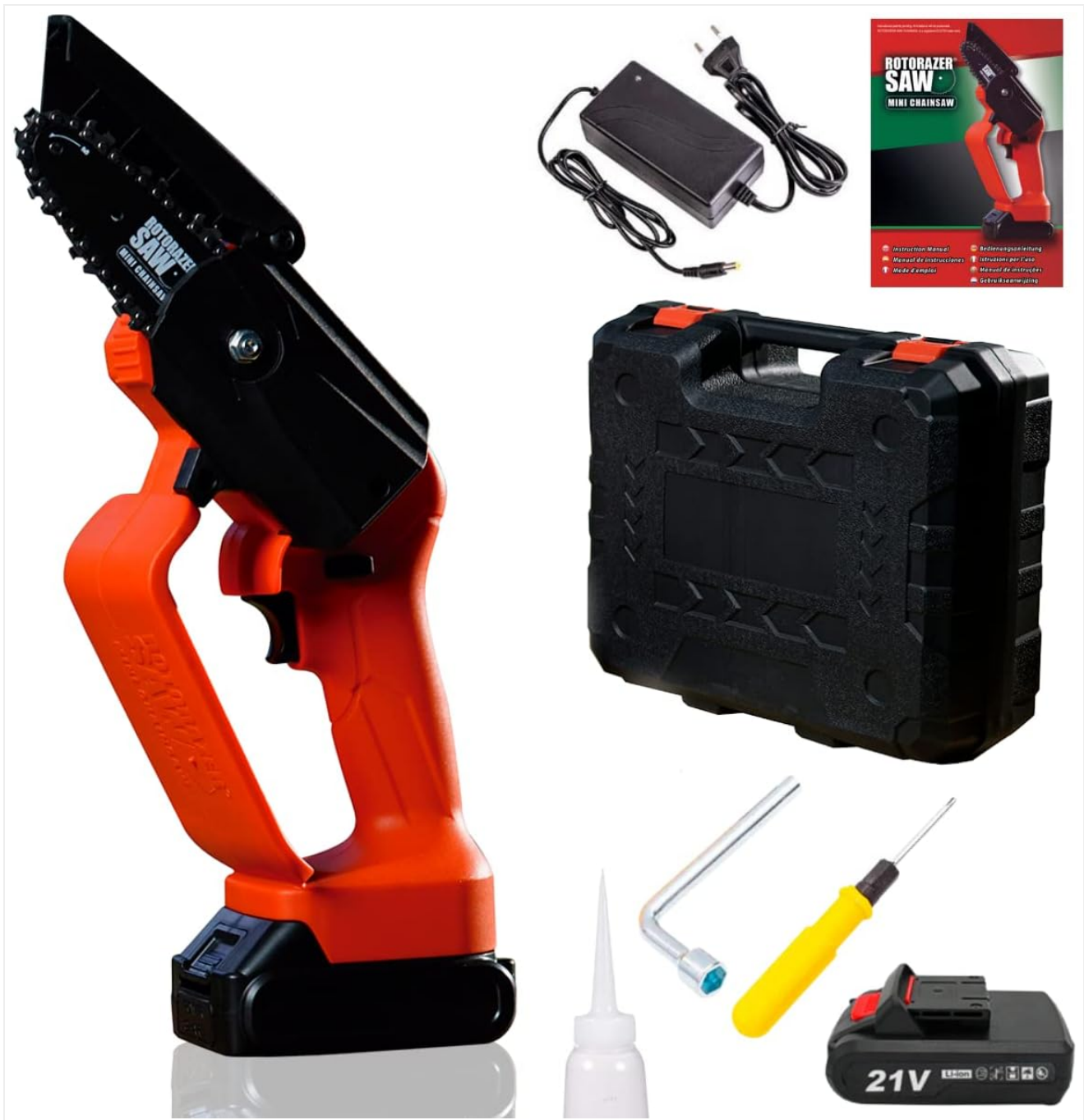
Image: The Rotorazer Mini Chainsaw, charger, battery, carrying case, oil bottle, and tools.