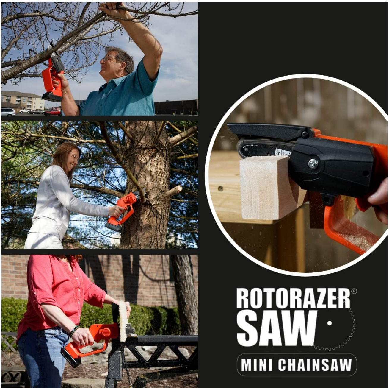
Image: Examples of the mini chainsaw being used to prune tree branches and cut small logs.

Always ensure a stable footing and clear surroundings. Position the chainsaw so the chain makes contact with the material to be cut. Apply gentle, consistent pressure. Allow the chainsaw to do the work; do not force it. For thicker branches, make a relief cut on the underside first to prevent pinching. The LED lighting feature can assist when working in low-light conditions.