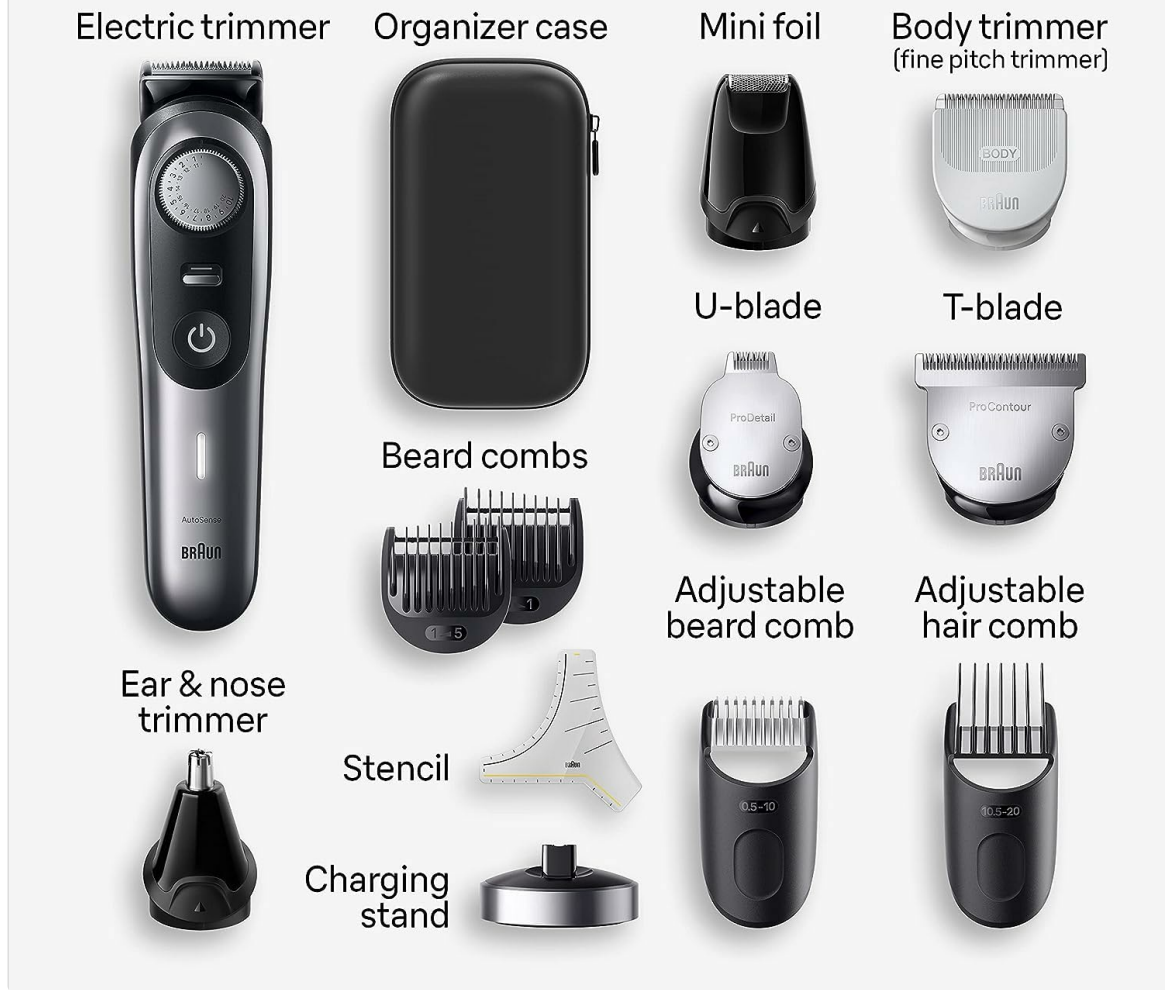
Figure 1: All components included in the Braun All-in-One Shaving Kit.