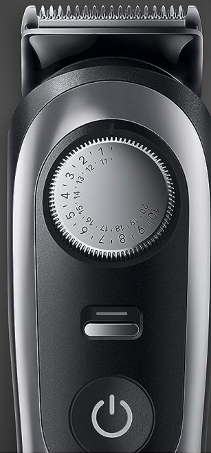
Figure 3: Overview of trimmer features including ProWheel and various tools.