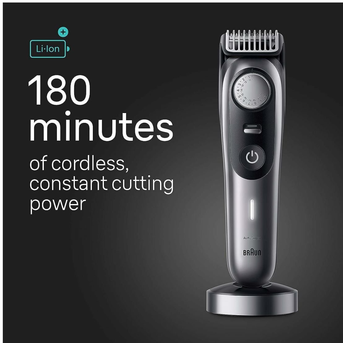
Figure 2: Trimmer on charging stand, illustrating cordless runtime.

plug the adapter into a power outlet. Place the trimmer device onto the charging stand. The battery indicator light will show charging progress. A full charge provides up to 100 minutes of cordless runtime.