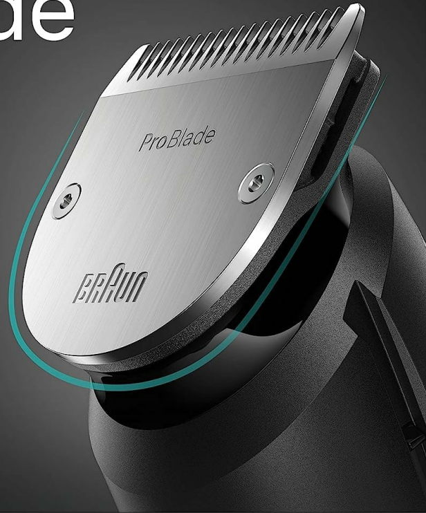
Figure 6: The ProBlade for precise trimming.