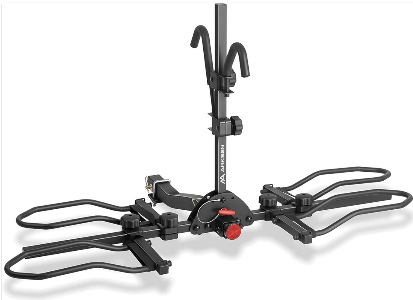
Image: The Arksen Hitch Mounted Bike Rack, designed for secure and convenient bicycle transport.

Thank you for choosing the ARKSEN Hitch Mounted Bike Rack. This manual provides essential information for the safe and efficient use of your bike rack. Please read it thoroughly before installation and operation.