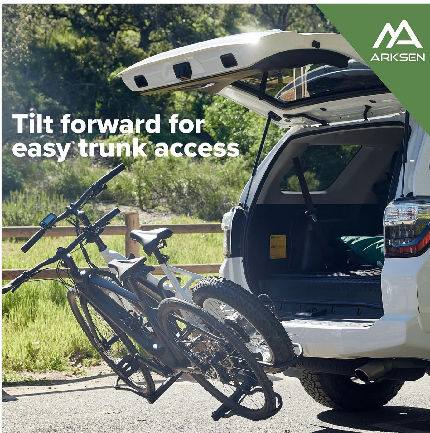
Image: The Smart Tilt System allows for easy trunk access even with bikes loaded.