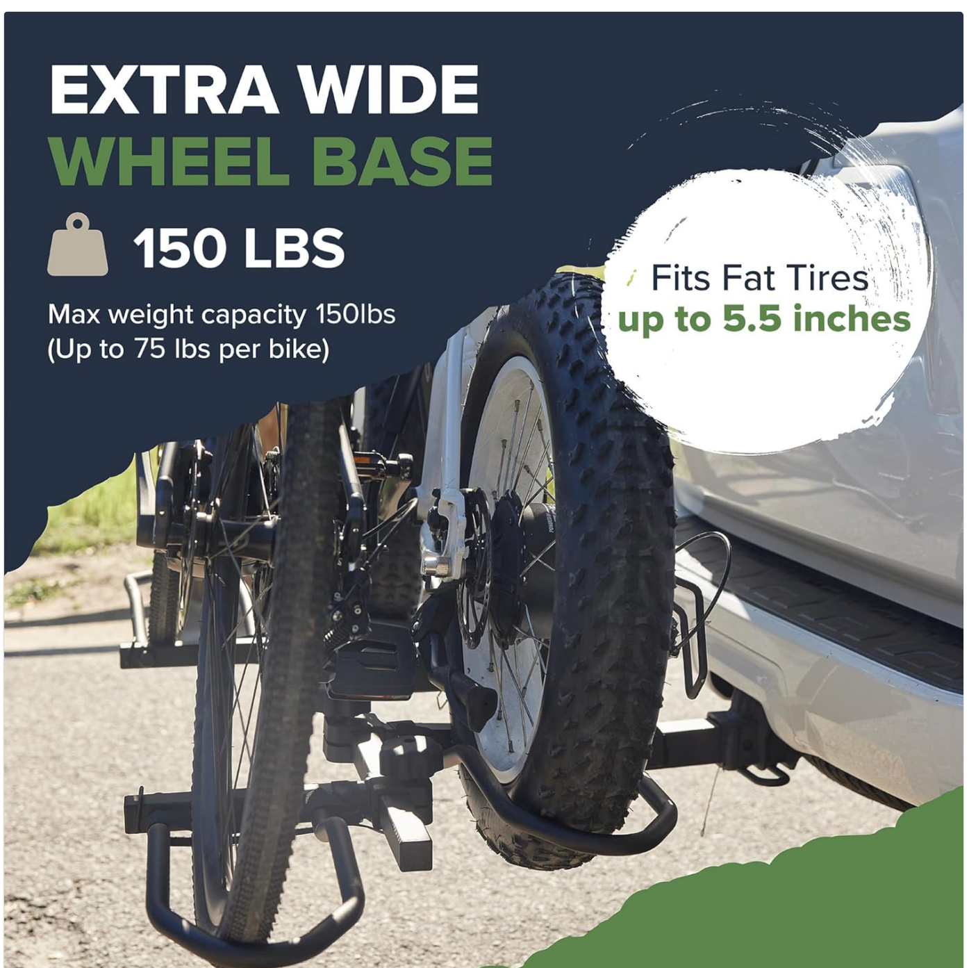
Image: Close-up view demonstrating the rack's compatibility with fat tires up to 5.5 inches wide.