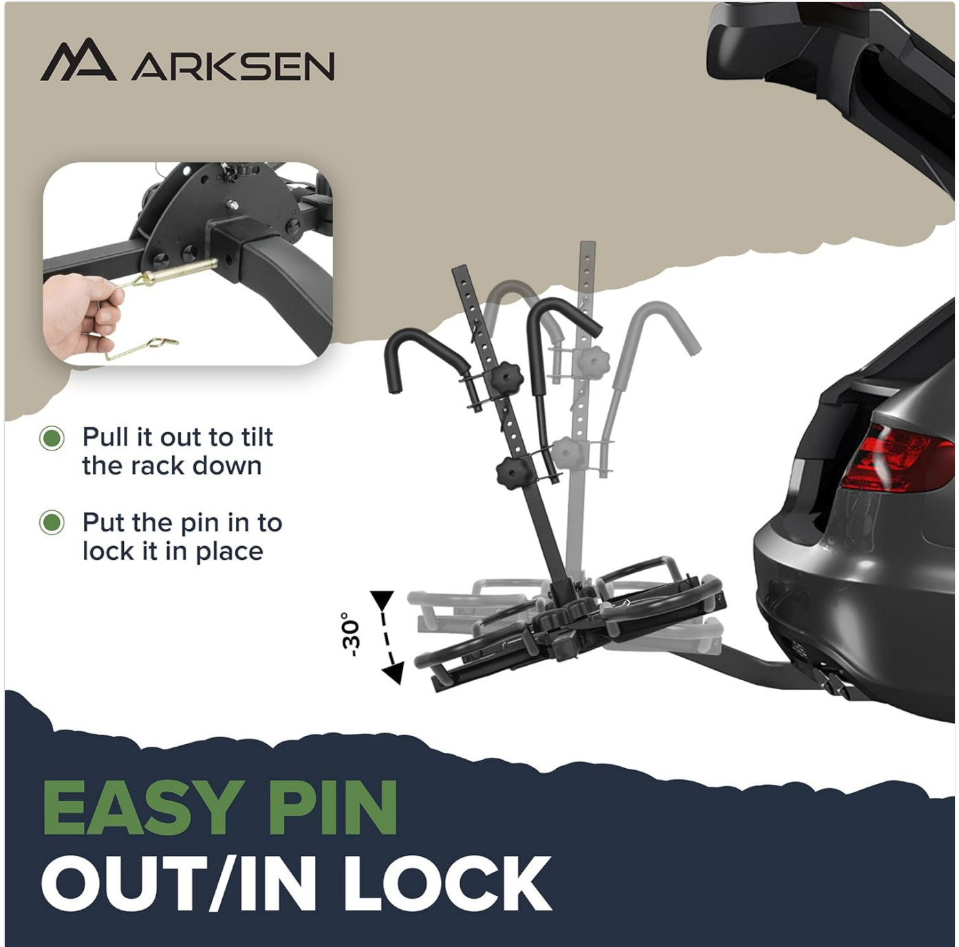
Image: Detail of the easy pin out/in lock mechanism for tilting the rack.

Video: Product display showing the installation and features of the ARKSEN Hitch Mounted Bike Rack (Model 005-PBK-H2S).