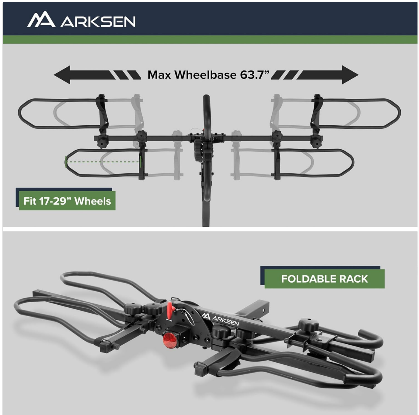
Image: The bike rack in its folded position, ready for compact storage.

When not in use, the rack can be folded for more compact storage or when driving without bikes.