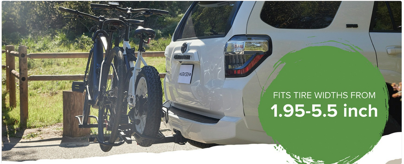
Image: The bike rack accommodates tire widths from 1.95 to 5.5 inches.