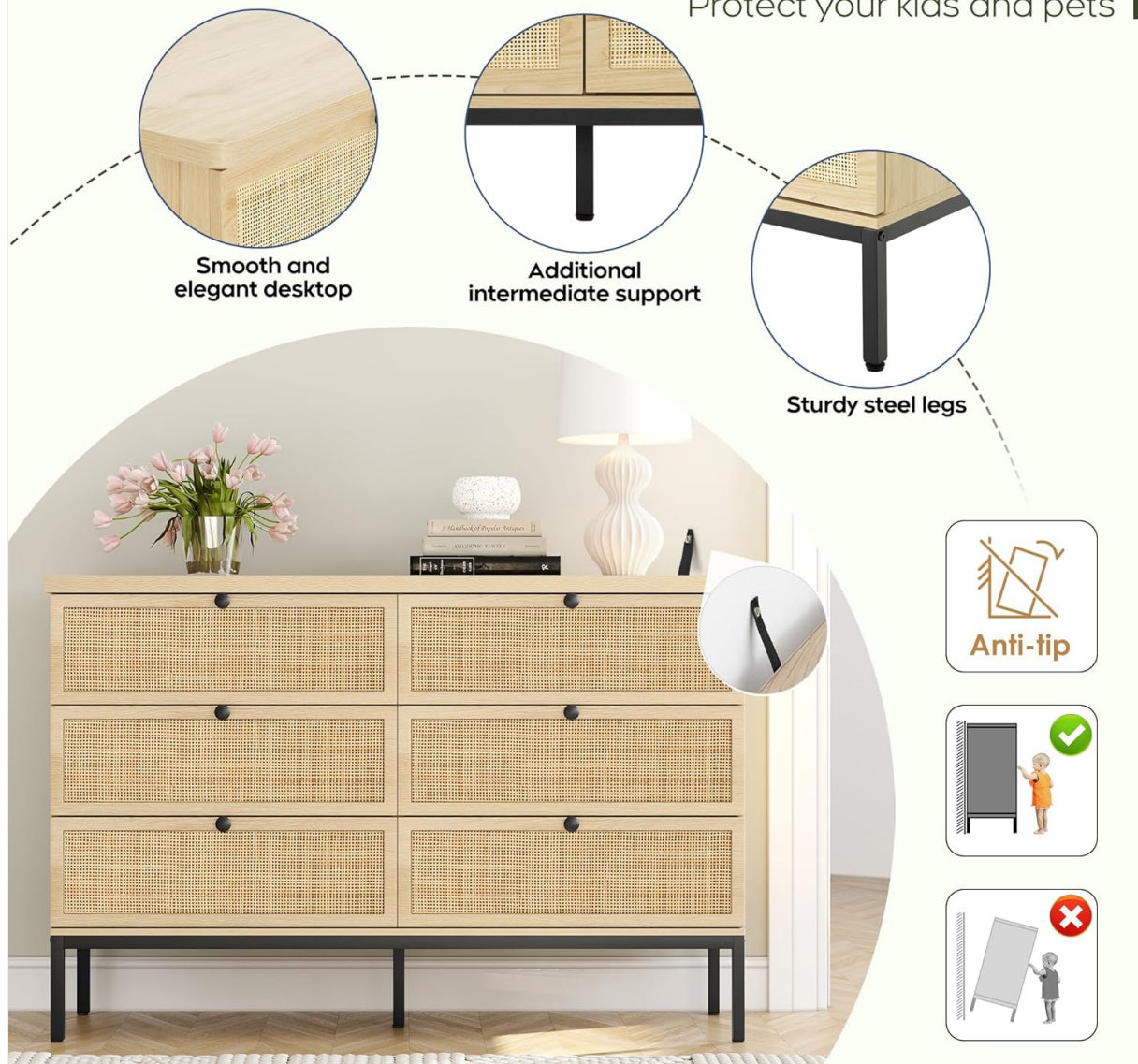
Image 2.1: Illustration of the anti-tip kit installation process and key stability features like smooth desktop, intermediate support, and sturdy steel legs.