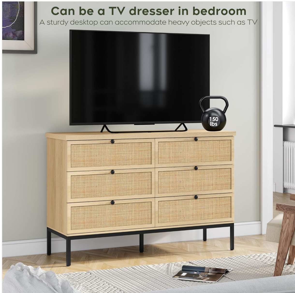
Image 5.1: The dresser functioning as a TV stand, illustrating its robust top surface capable of supporting a television.