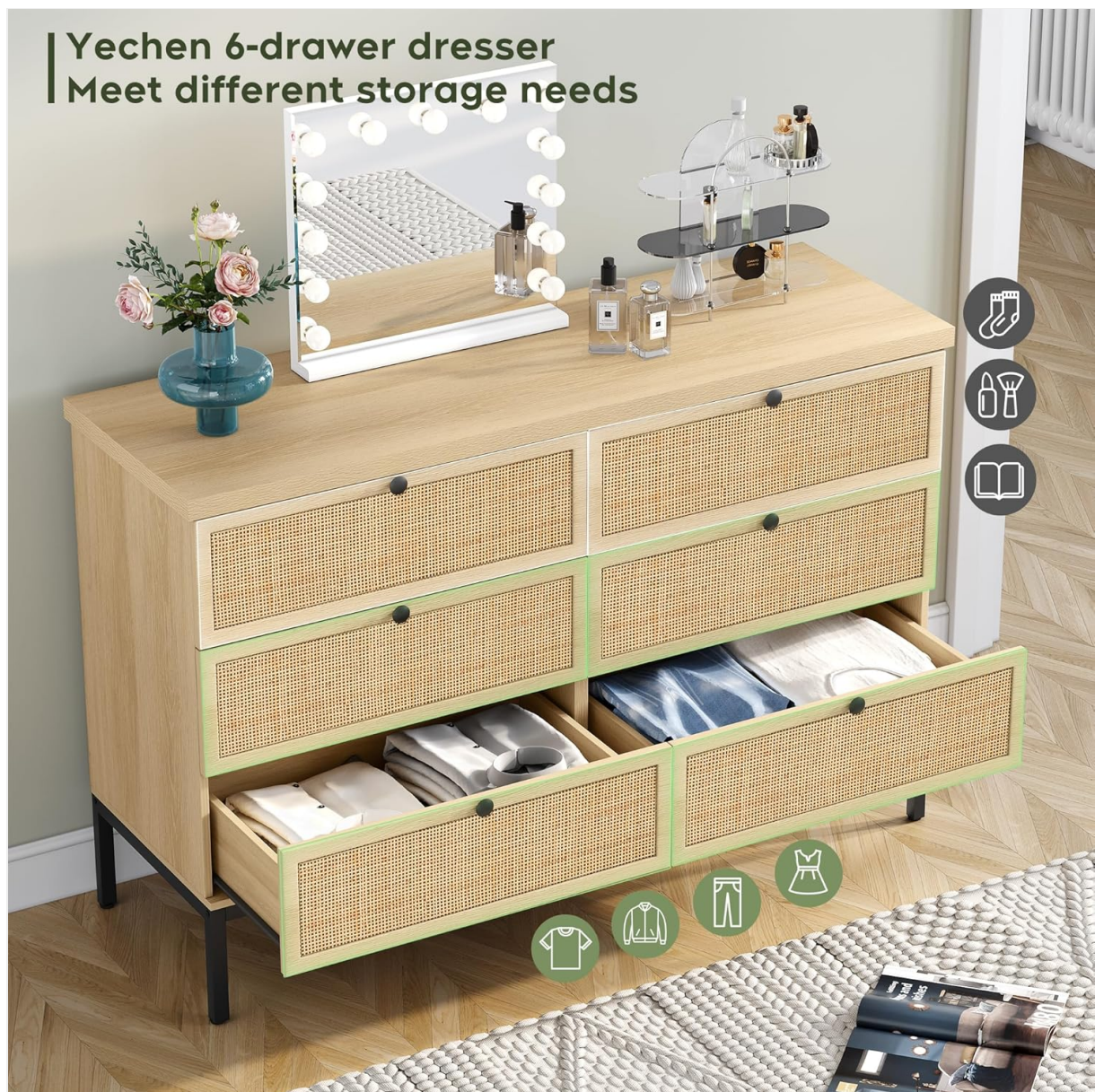
Image 4.1: The Yechen 6-drawer dresser with drawers open, demonstrating its storage capacity for various items like clothing and accessories.

For visual guidance, refer to any installation videos linked in the provided assembly manual or on the manufacturer's website.