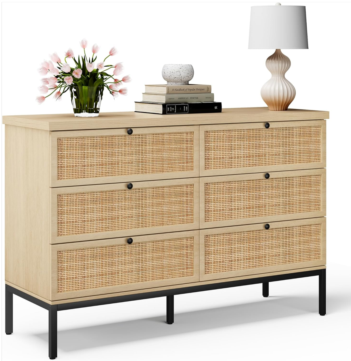
Image 1.1: The Yechen Modern 6-Drawer Dresser, showcasing its natural wood finish, rattan drawer fronts, and black steel legs.