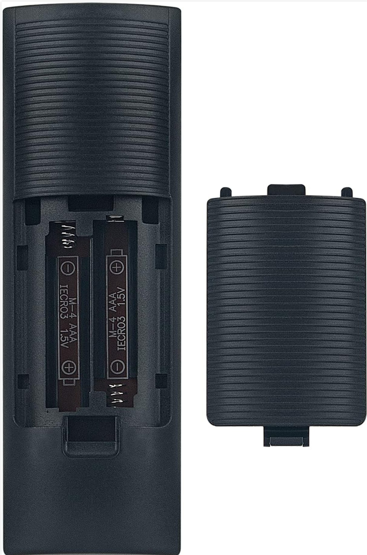
Image: Rear view of the remote control with the battery cover removed, illustrating the correct orientation for AAA battery