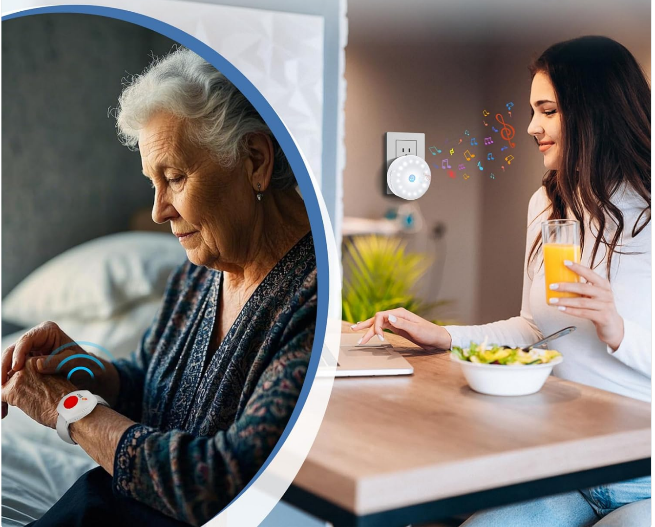
Image: An elderly individual wearing the emergency call wristband, demonstrating the product in a home setting with the receiver active.

24-Stunden-Standby und Sofortreaktion im Notfall ermöglichen es den Kindern, sich Sorgen um die ferne Betreuungslosigkeit zu sparen