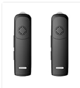
Image: Step-by-step visual guide for pairing transmitters and selecting music on the ChunHee Emergency Call Button System.