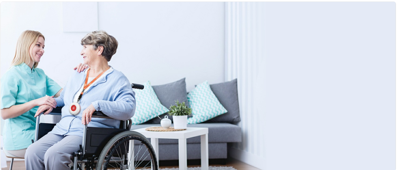
Image: The ChunHee Wireless Caregiver Pager System, highlighting its main components and features like 55 ringtones, 5 volume levels, waterproof design, 500ft working range, expandability, and night light function.

The ChunHee Emergency Call Button System (Model LC05) is a wireless caregiver pager designed to provide timely assistance for elderly individuals, people with disabilities, and pregnant women. This system ensures that help can be summoned quickly and efficiently, enhancing safety and peace of mind for both users and caregivers.