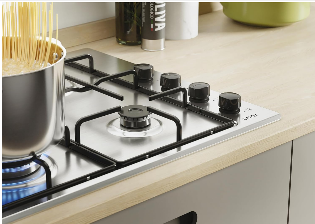
A detailed view of the independent side control knobs and the burner layout.