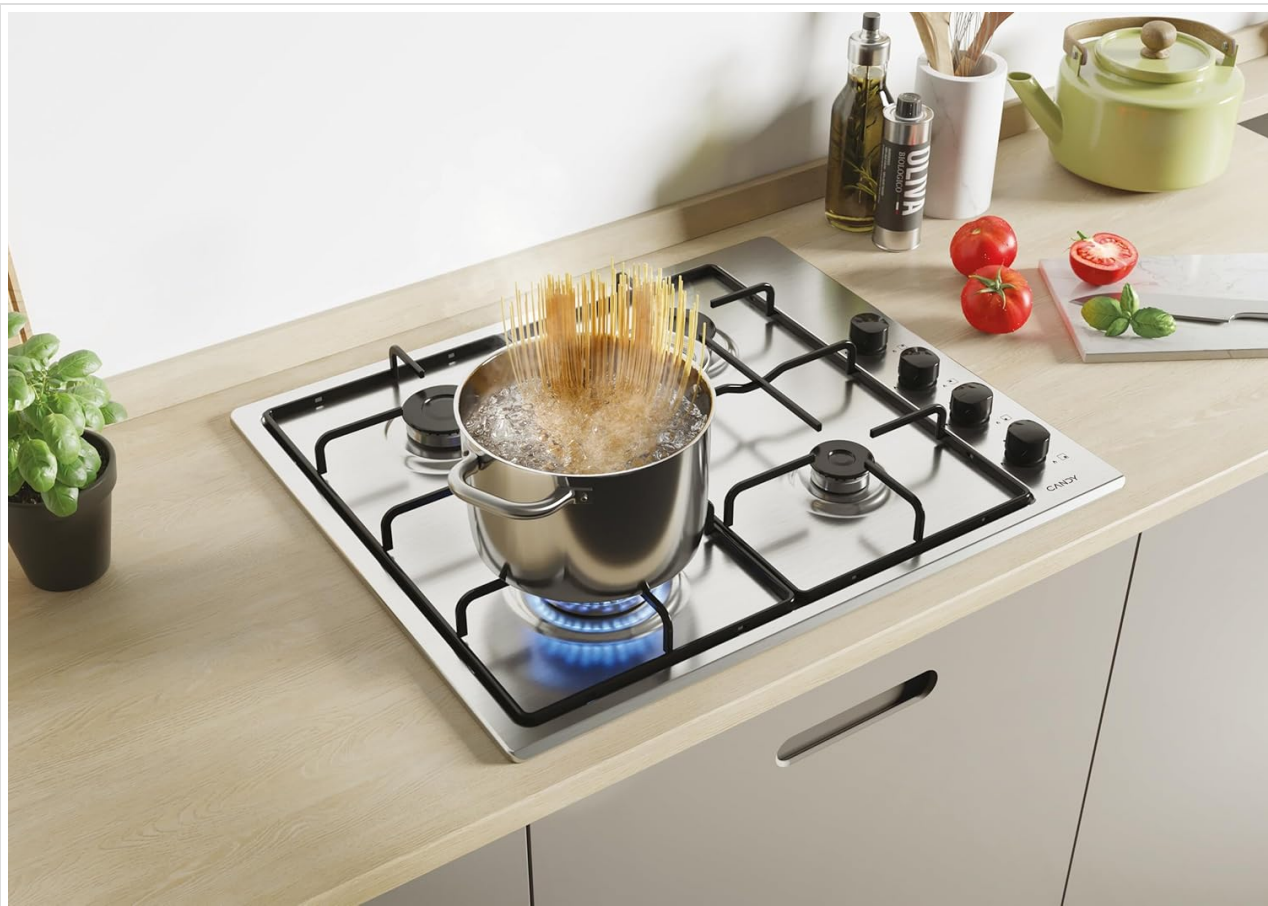
A pot of pasta cooking on one of the hob's burners, illustrating the appliance in active use.