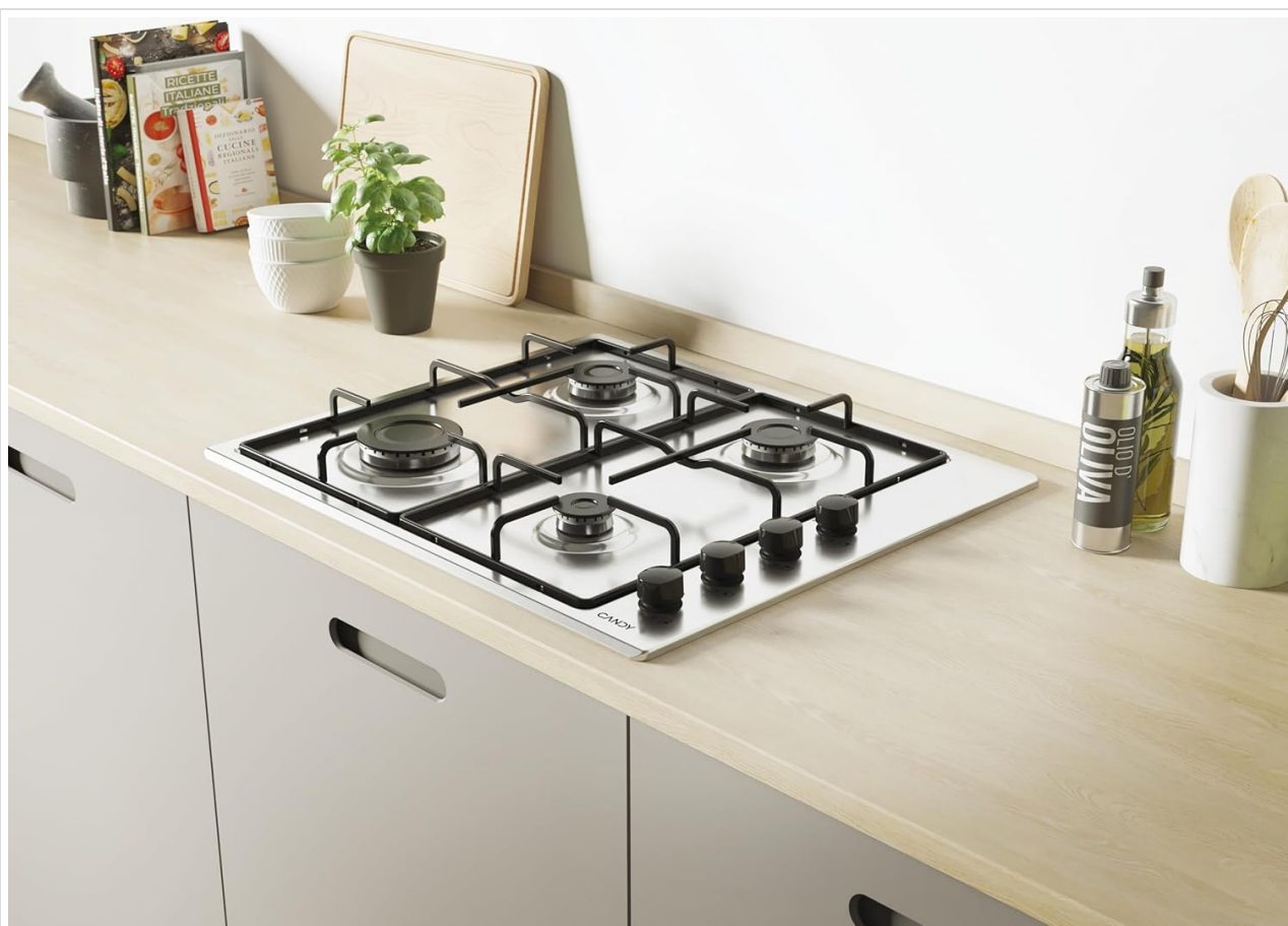
An alternative perspective of the gas hob, highlighting its sleek design and control knobs.