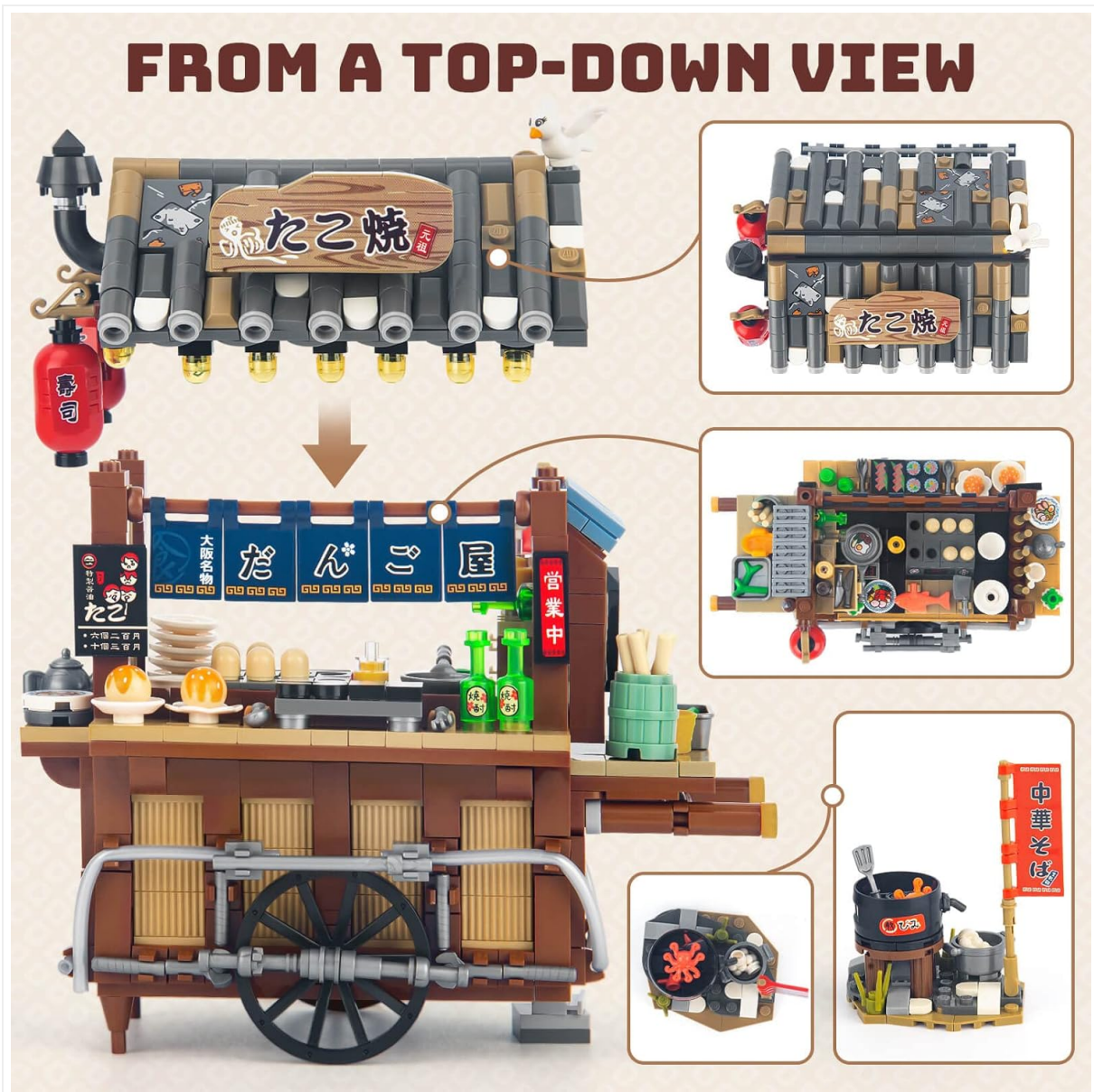
Figure 4.1: Fully assembled Takoyaki shop with accessories.