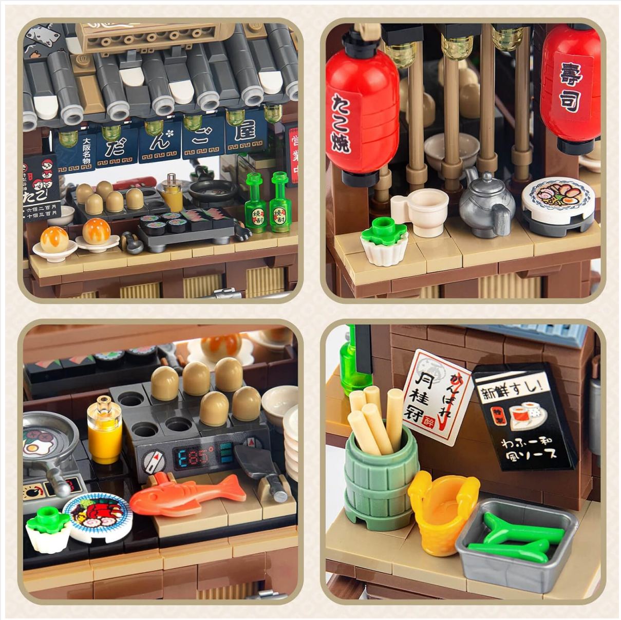
Figure 3.1: Detailed interior of the Takoyaki shop.