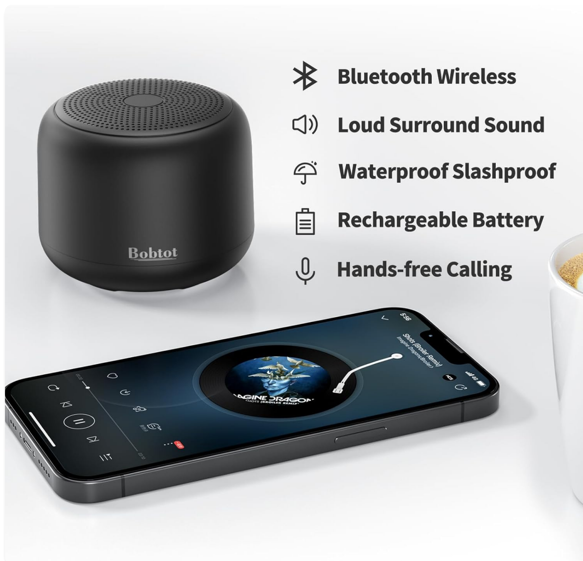
Image: The Bobtot SoundAir speaker positioned beside a smartphone, illustrating its wireless Bluetooth connectivity.

The speaker will automatically attempt to reconnect to the last paired device when powered on.