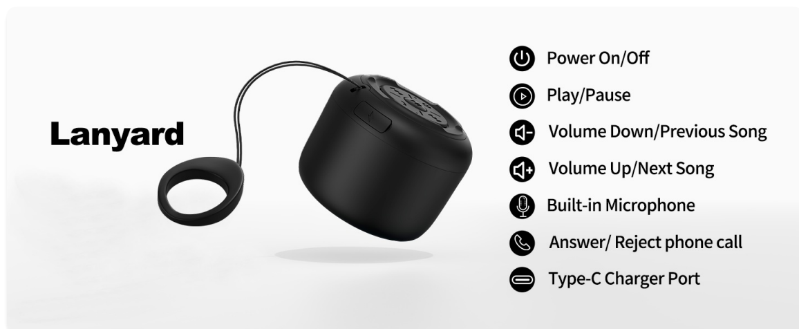
Image: A diagram illustrating the Bobtot SoundAir speaker with its lanyard and clearly labeled control buttons.

Familiarize yourself with the speaker's components and control buttons.