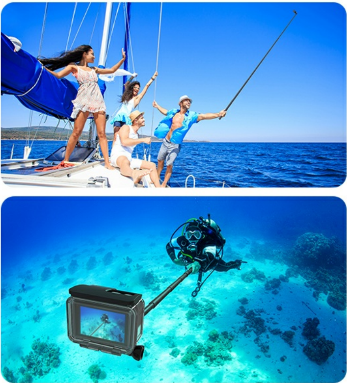
Figure 6: The carbon fiber construction allows for use in marine environments.

*rinse and dry with water after immersion in seawater