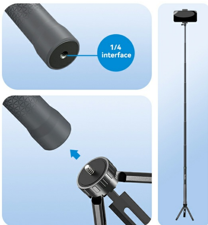
Figure 4: The 1/4-inch threaded port at the base for tripod attachment.

*The tripod base does not come as standard, please purchase separately from the TELESIN shop