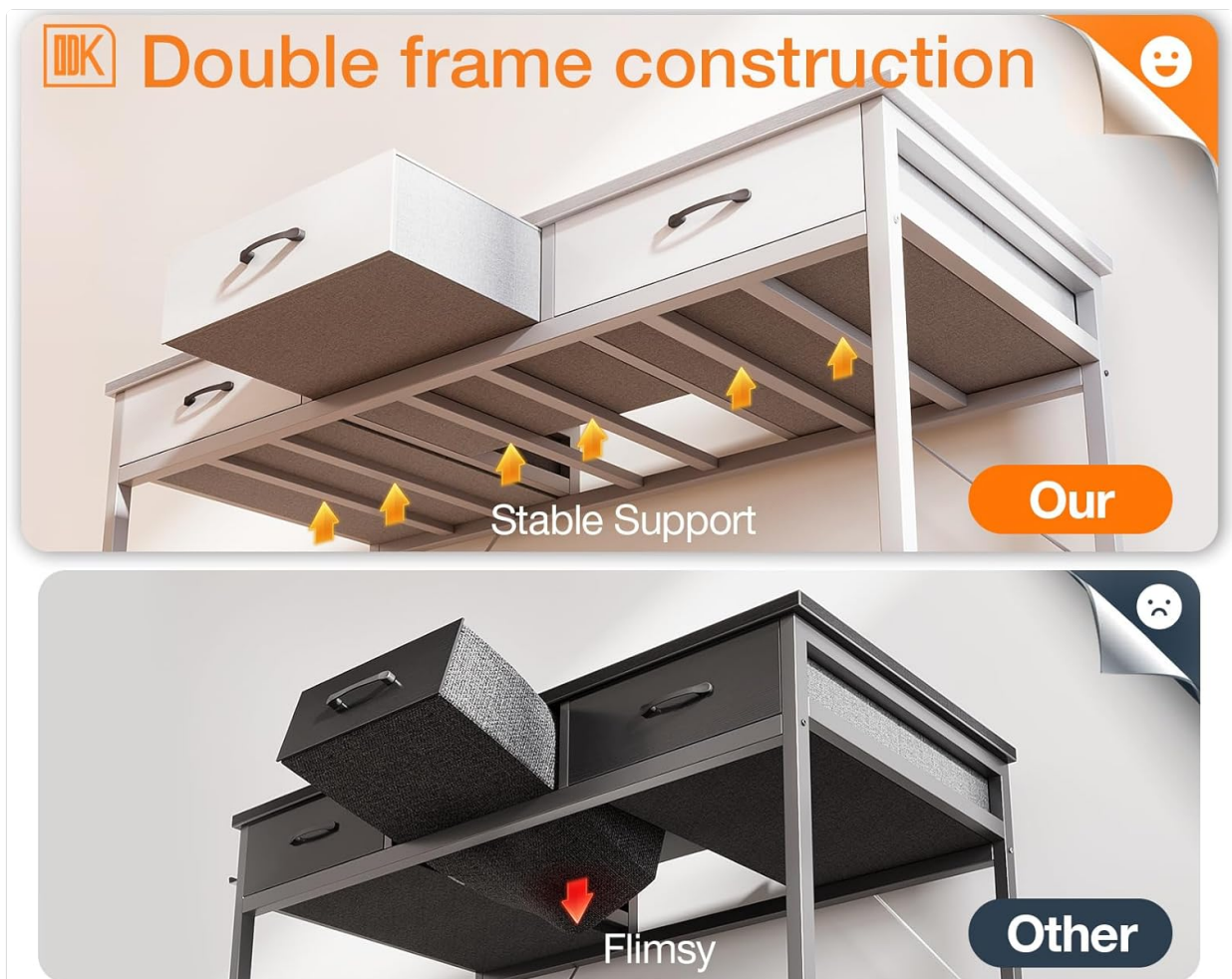
Figure 2: Double Frame Construction for Enhanced Stability.