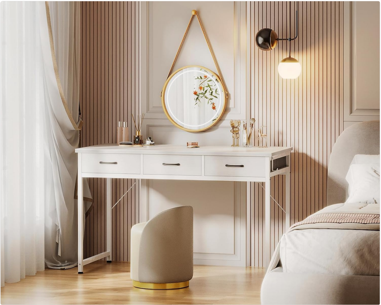
Figure 3: ODK Vanity Desk used as a makeup table in a bedroom.