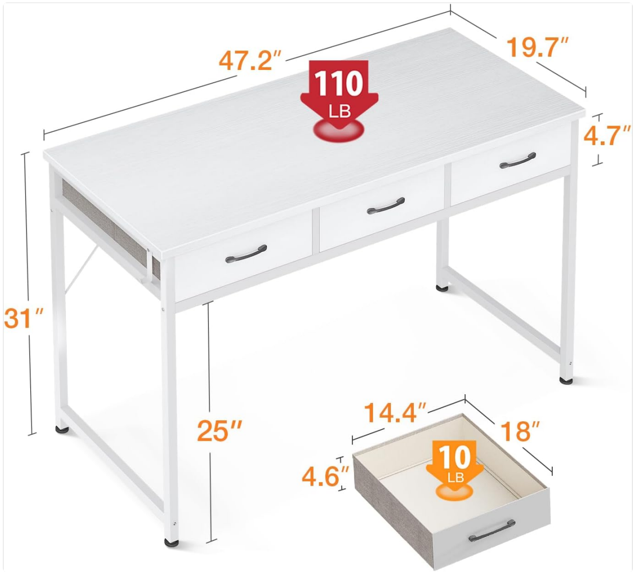
Figure 1: Desk Dimensions and Drawer Capacity. The desk supports up to 110 lbs, and each drawer supports up to 10 lbs.