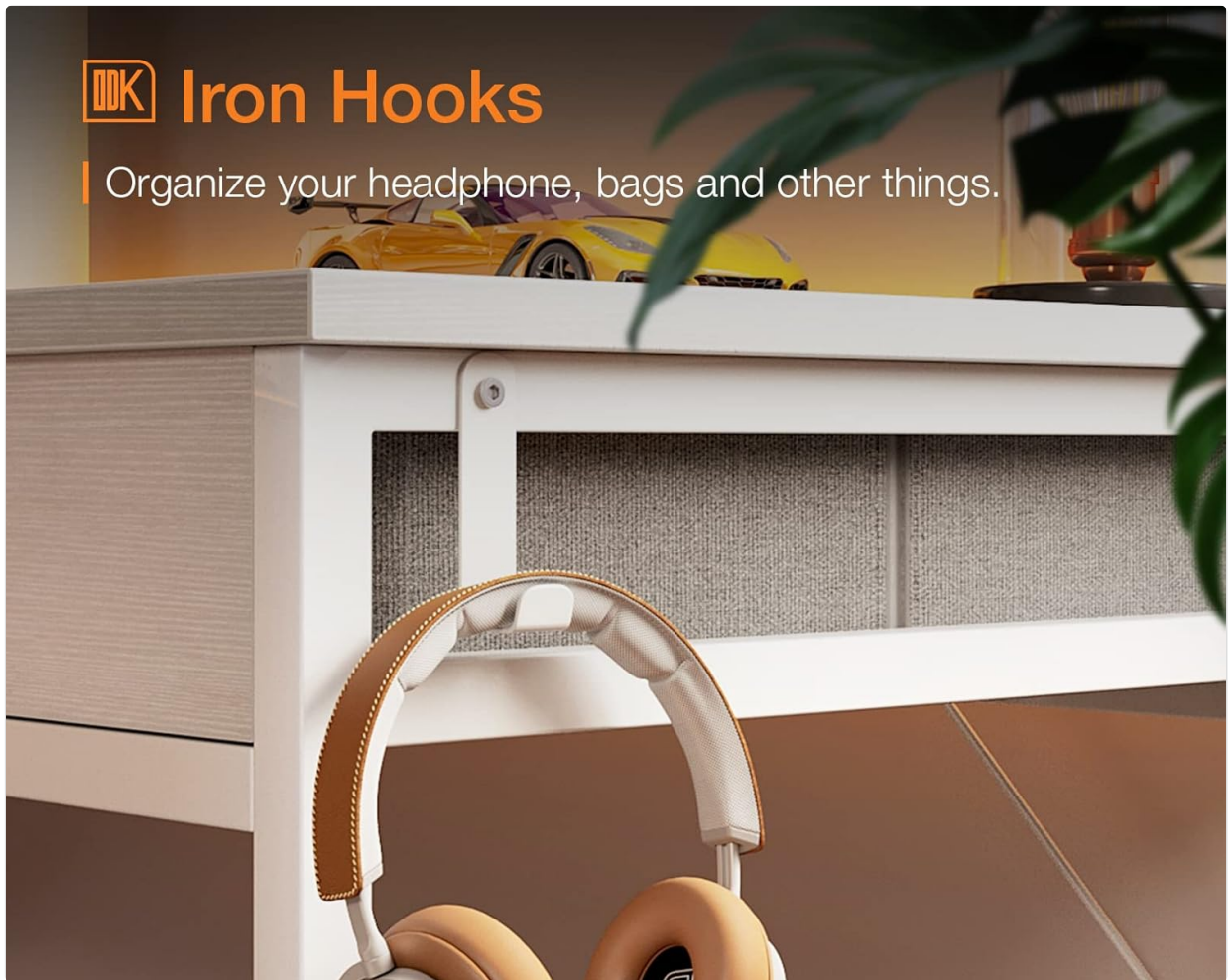
Figure 5: Integrated iron hook for convenient storage.