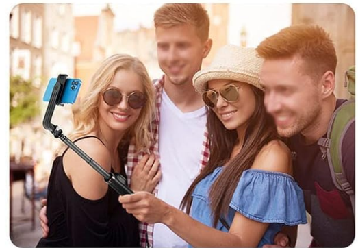
Image: A collage showing the remote control alongside various usage scenarios: a couple taking a selfie with a stick, a person skiing and filming, and a group taking a photo, highlighting its versatility.