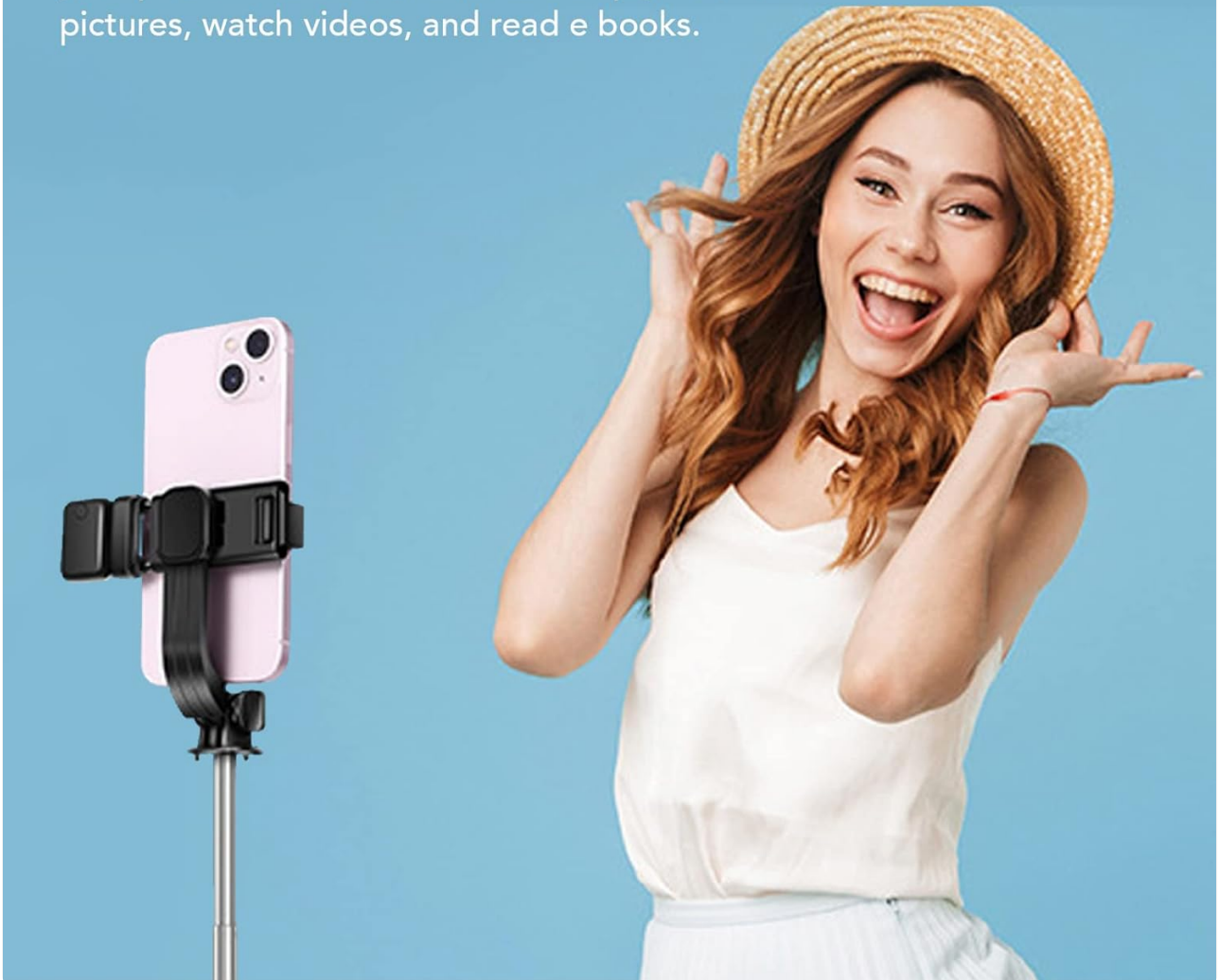
Image: A woman smiling while using a smartphone mounted on a selfie stick, illustrating the remote's use for hands-free photography.

You can use this little ring to control your phone with one click, it can help you take pictures, watch videos, and read e books.