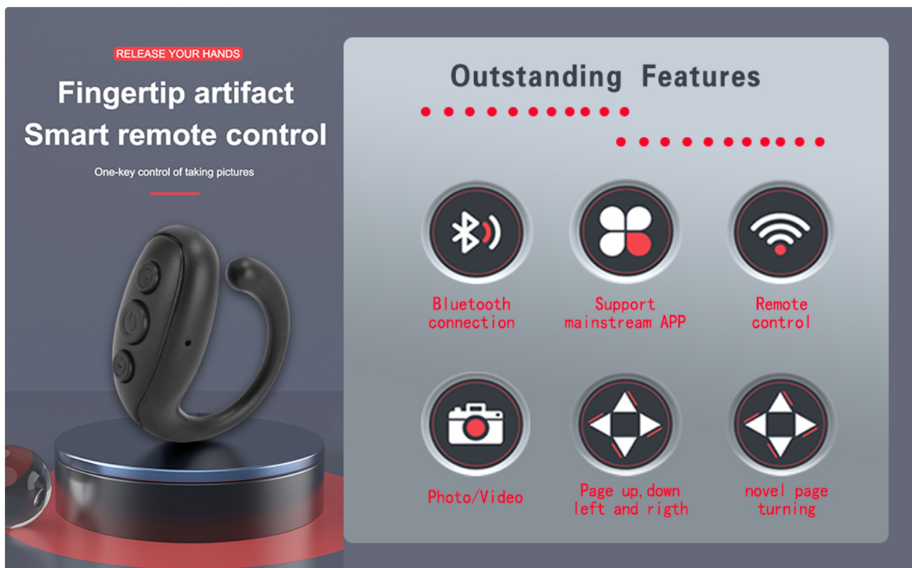
Image: A graphic illustrating the key features of the remote control, including Bluetooth connection, mainstream APP support, remote control functionality, photo/video capture, page up/down, and novel page turning.