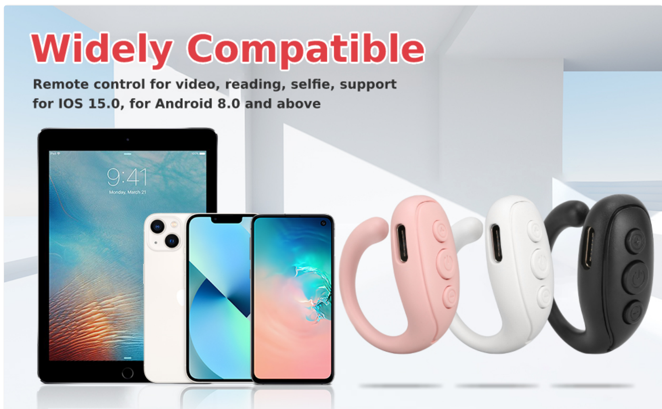
Image: An image showcasing the wide compatibility of the remote control with various smartphones and tablets, including different color variants of the remote, and specifying support for iOS 15.0+ and Android 8.0+.