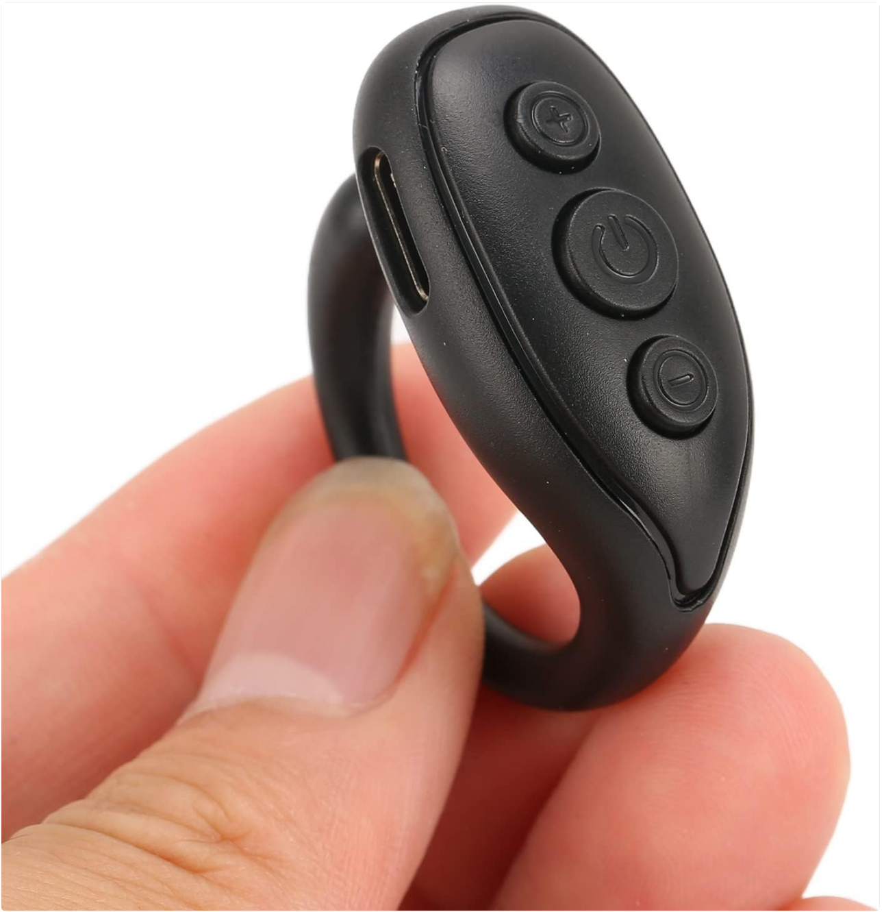
Image: A hand holding the black GOWENIC Bluetooth Remote Control, demonstrating its compact, ring-like design and how it fits on a finger.