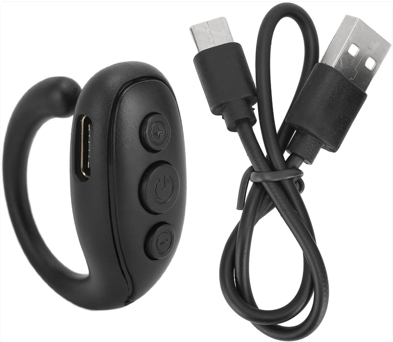
Image: The GOWENIC Bluetooth Remote Control in black, shown alongside its USB charging cable.