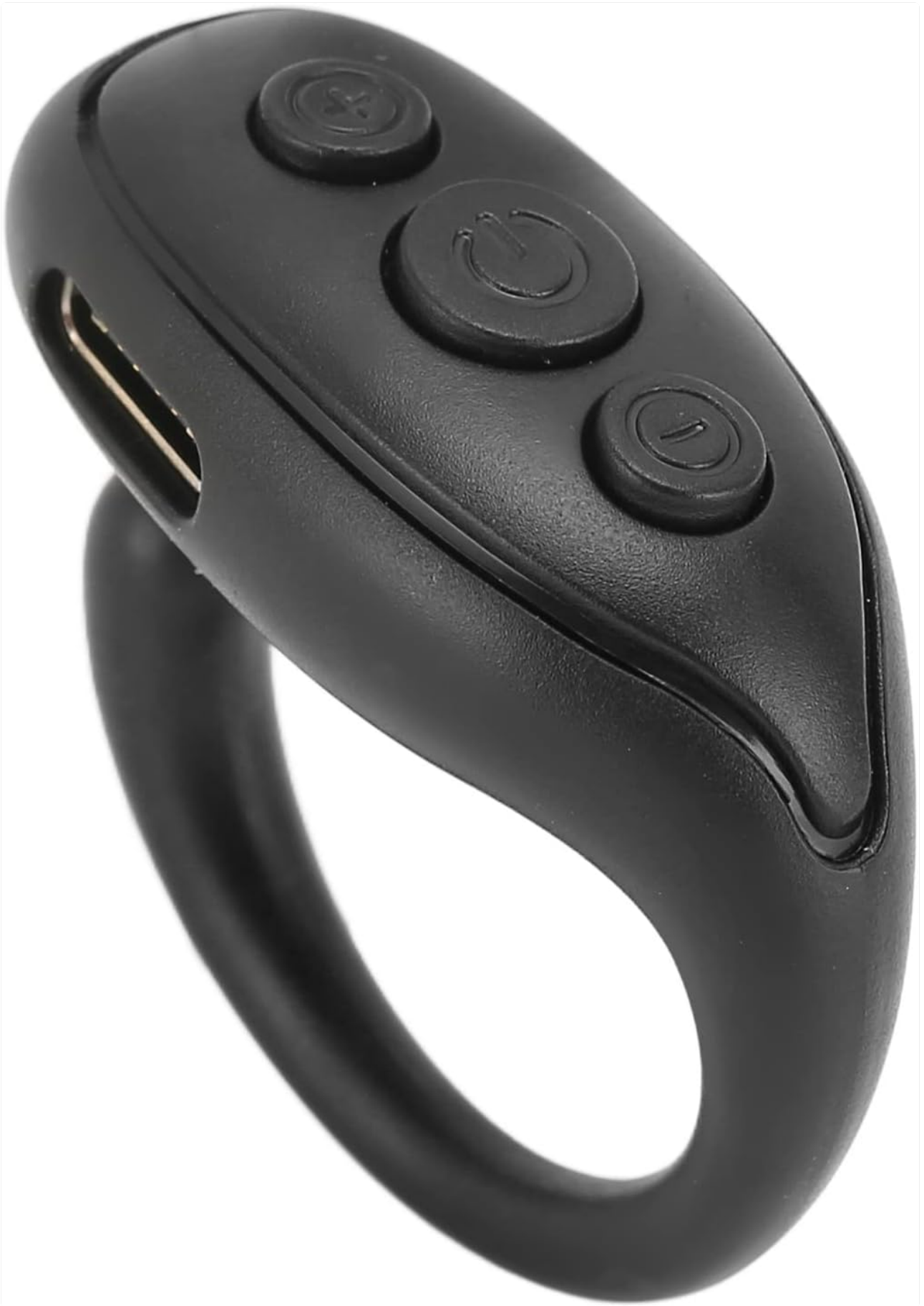
Image: A close-up view of the black GOWENIC Bluetooth Remote Control, highlighting its three control buttons and the USB charging port.