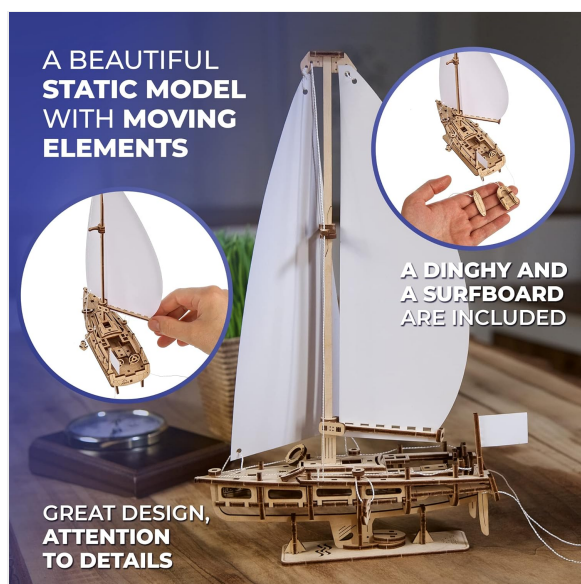
Image: The completed UGEARS Ocean Beauty Yacht model, showcasing its paper sails, dinghy, and surfboard, ready for display.

Image: Hands assembling the intricate wooden hull structure of the Ocean Beauty Yacht, fitting laser-cut pieces together.