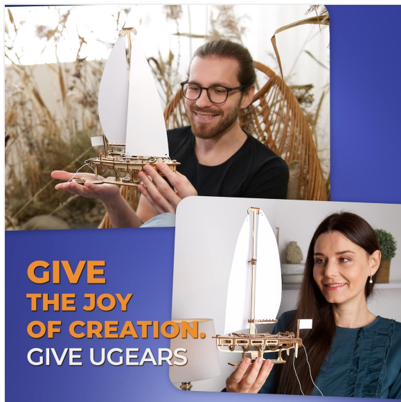
Image: Overview of the UGEARS Ocean Beauty Yacht model kit components, including laser-cut plywood sheets and paper sails.