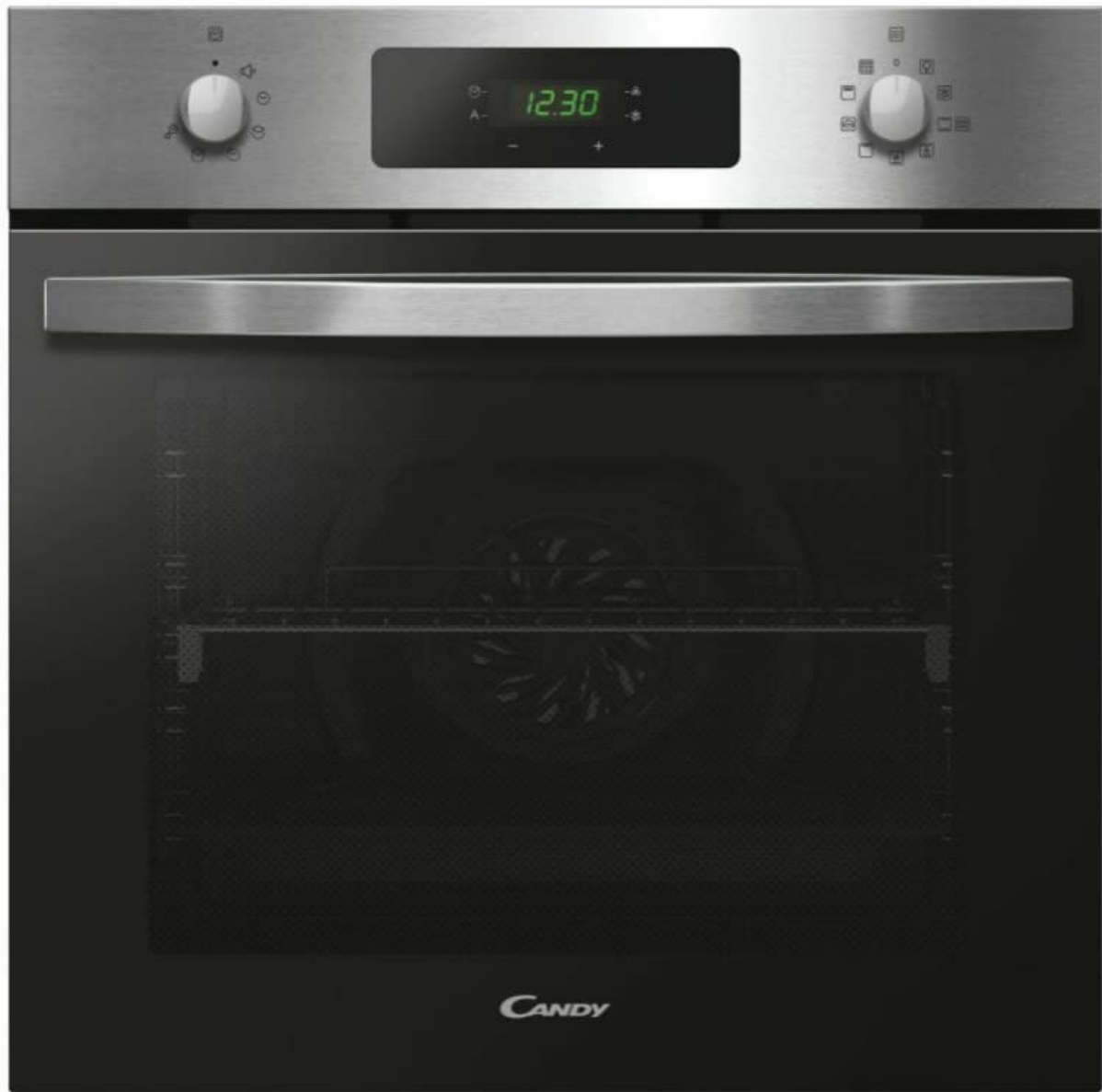
Figure 3.1: Front view of the Candy FIDCP X696 Multifunction Oven, showcasing its stainless steel finish and control panel.