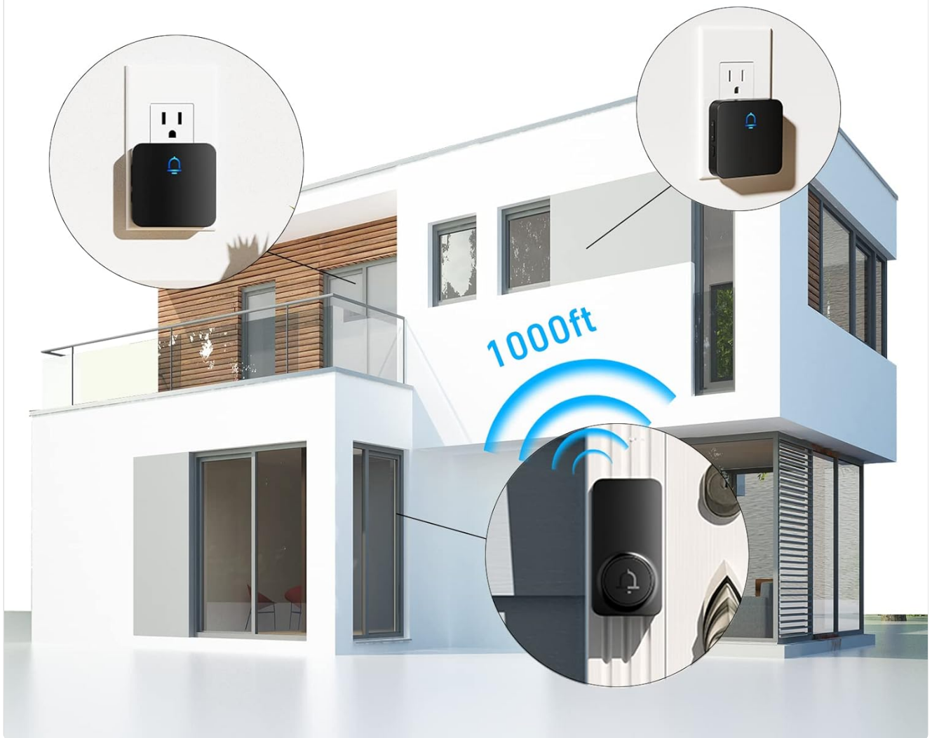
Figure 3: 1000ft Wireless Range

Experience reliable connectivity with a wireless range of up to 1000 feet, ensuring you never miss a visitor, even if you are in the backyard or upstairs.