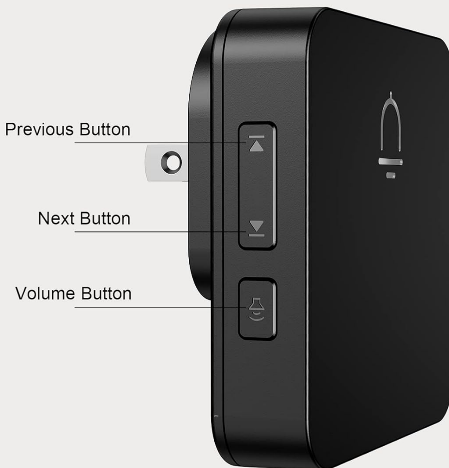
Figure 7: Receiver Control Buttons

Easily control the volume and select from 32 melodies using the conveniently located buttons on the side of the receiver.