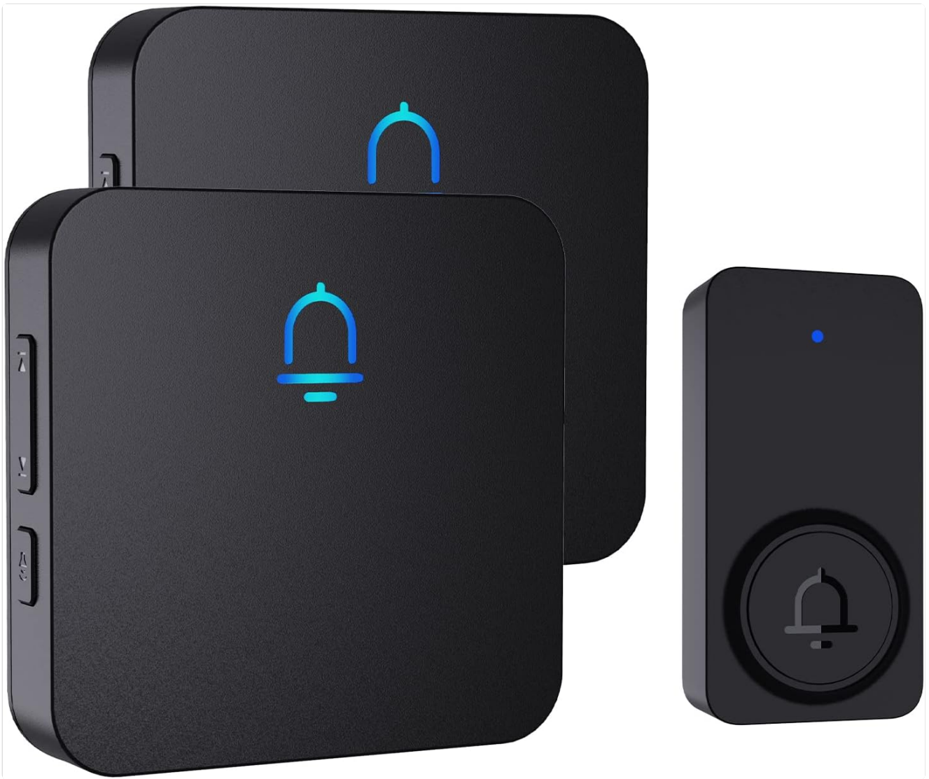
Figure 1: SECRUI Wireless Doorbell Kit (2 Receivers + 1 Button)

The SECRUI Wireless Doorbell system includes two sleek black plug-in receivers and a single black doorbell button, offering a modern and discreet design that complements any home decor.