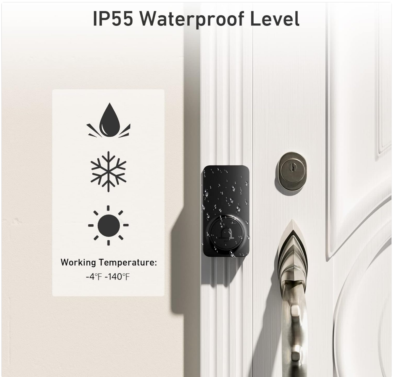
Figure 4: IP55 Waterproof Level

The doorbell button is designed with an IP55 waterproof rating, making it resistant to various weather conditions, including rain, snow, and extreme temperatures ranging from -4°F to 140°F.