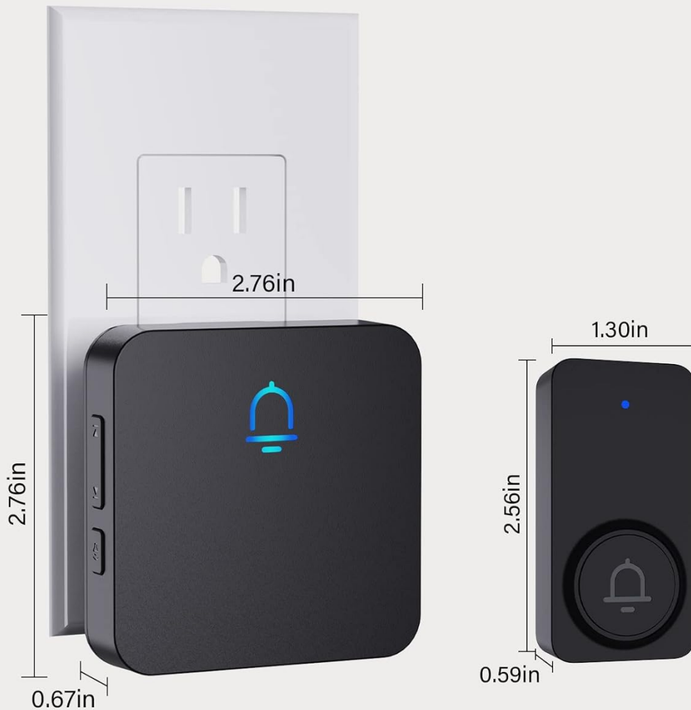
Figure 6: Compact Receiver Design

The compact design of the receiver ensures it won't obstruct adjacent electrical sockets, maintaining convenience in your home.