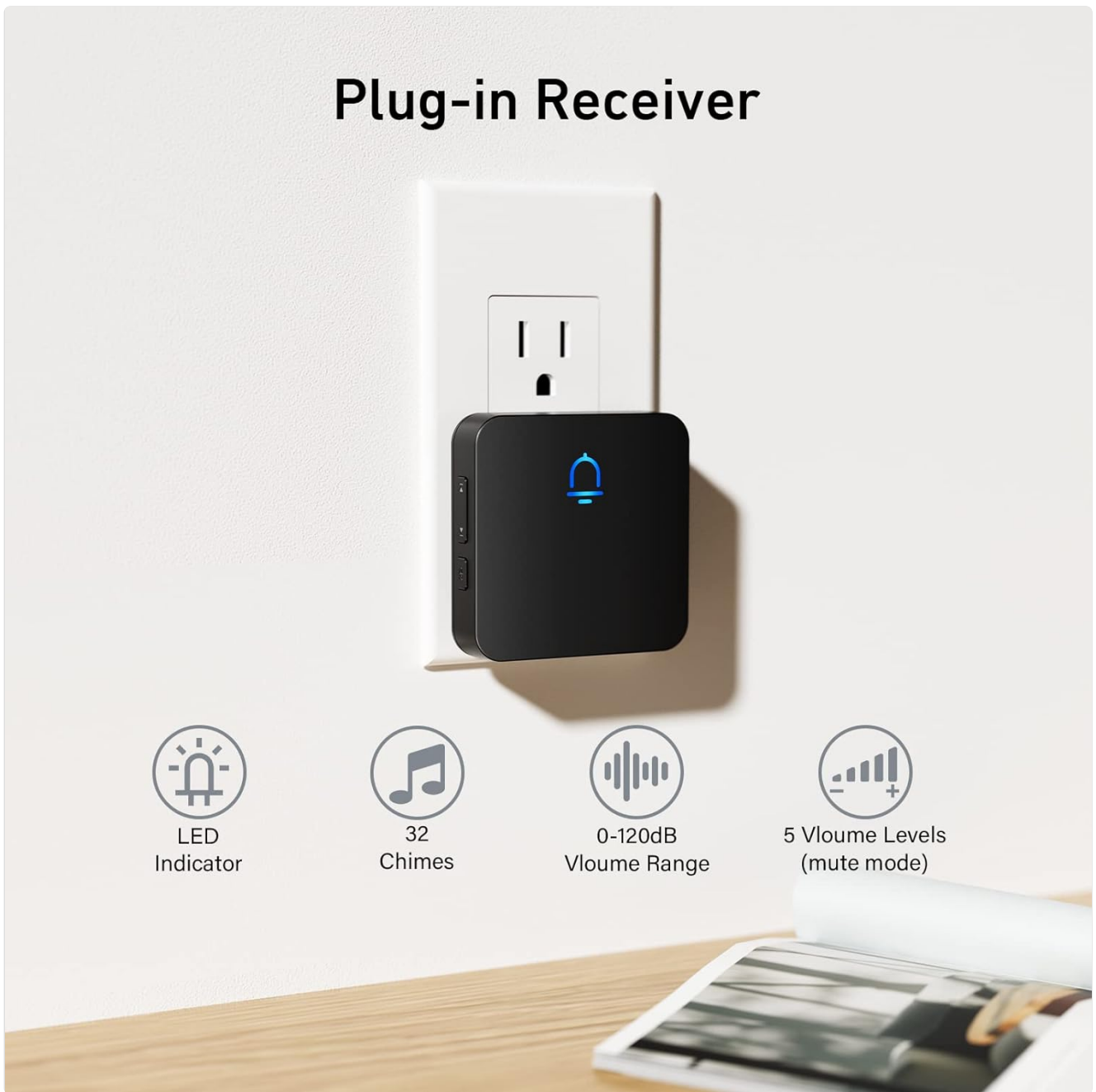
Figure 2: Plug-in Receiver Features Overview

The plug-in receiver offers a clear LED indicator, a selection of 32 chimes, a wide volume range from 0 to 120dB, and 5 distinct volume levels, including a mute option.