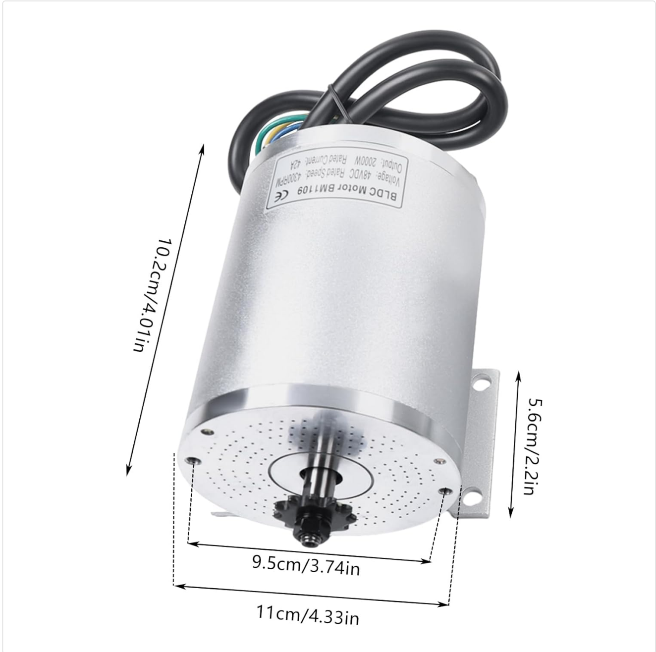
Figure 3.1: Dimensions of the 48V 2000W Brushless DC Motor.