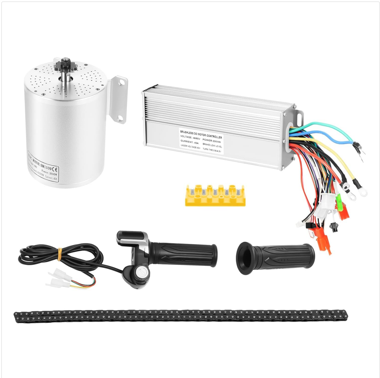
Figure 2.1: Overview of the TFCFL 48V 2000W Electric Brushless DC Motor Kit components.