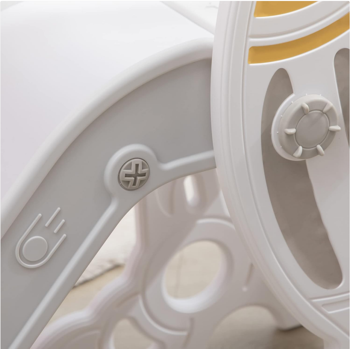
Image: A close-up view of the easy-to-install nuts used for securing the slide components, designed for simple assembly.