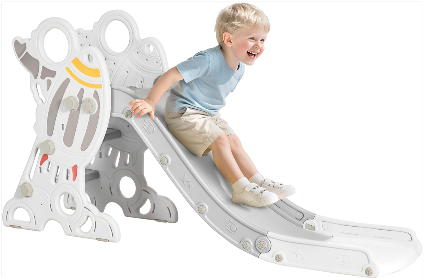
Image: The Qaba Kids Indoor Slide, gray and white, with a child happily sliding down. The slide features a rocket ship design on its side panels.