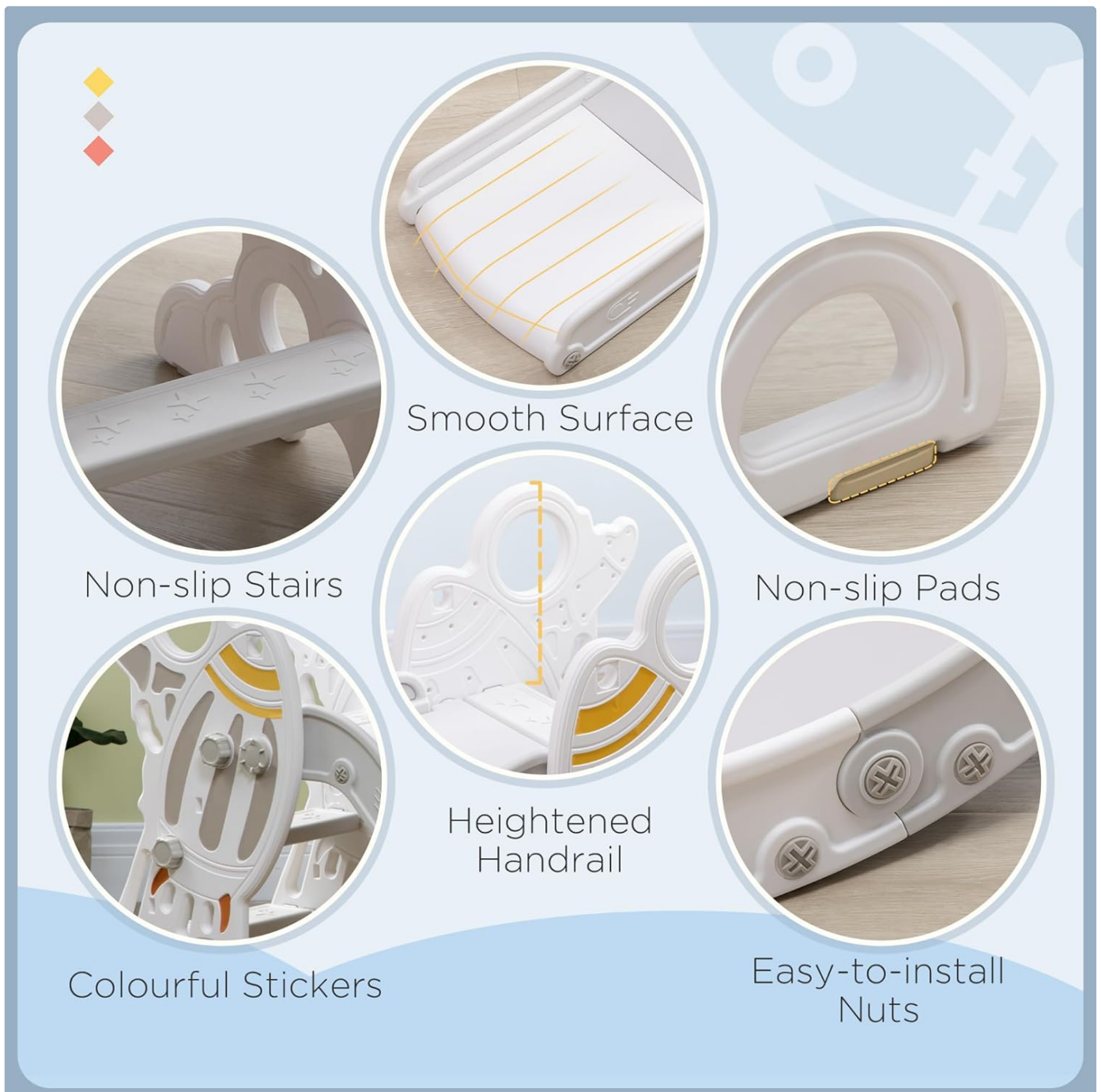
Image: Multiple close-up views showing the smooth surface of the slide, non-slip stairs, heightened handrails, non-slip pads, colourful stickers, and easy-to-install nuts.