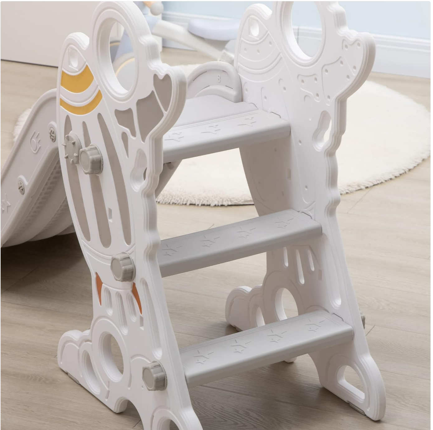
Image: A detailed view of the non-slip stairs, showing the textured surface designed to provide secure footing for toddlers.