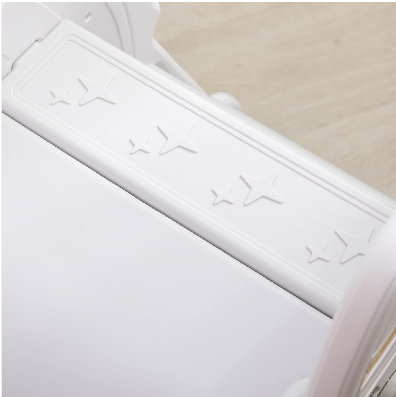
Image: A close-up view of the smooth, star-patterned surface of the slide chute, designed for a comfortable and unobstructed slide.