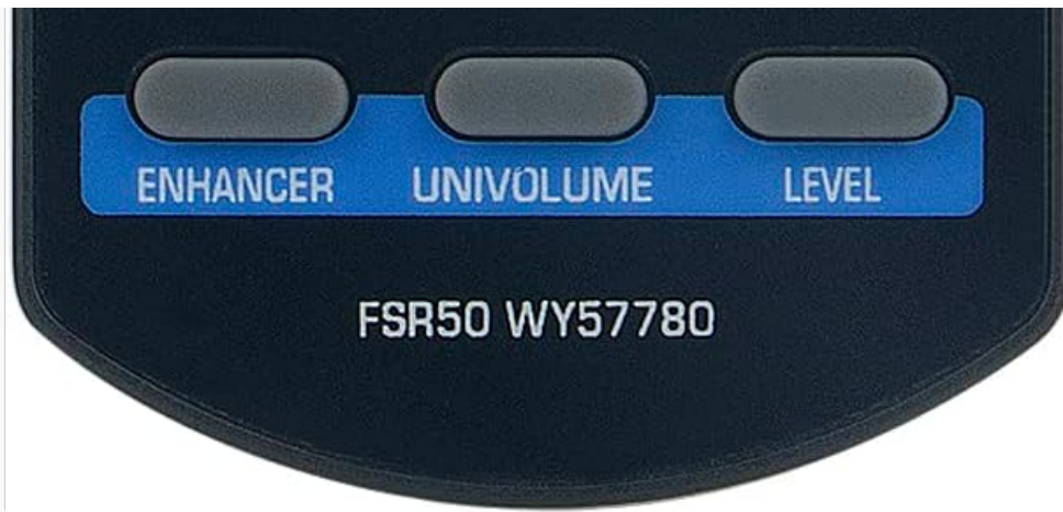
Figure 2: Front view of the remote control with button layout.