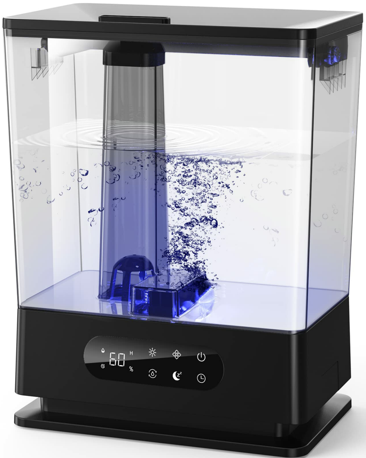
Image: A close-up of the humidifier's control panel, showing the digital display and touch buttons for power, mist level, night light, and timer.