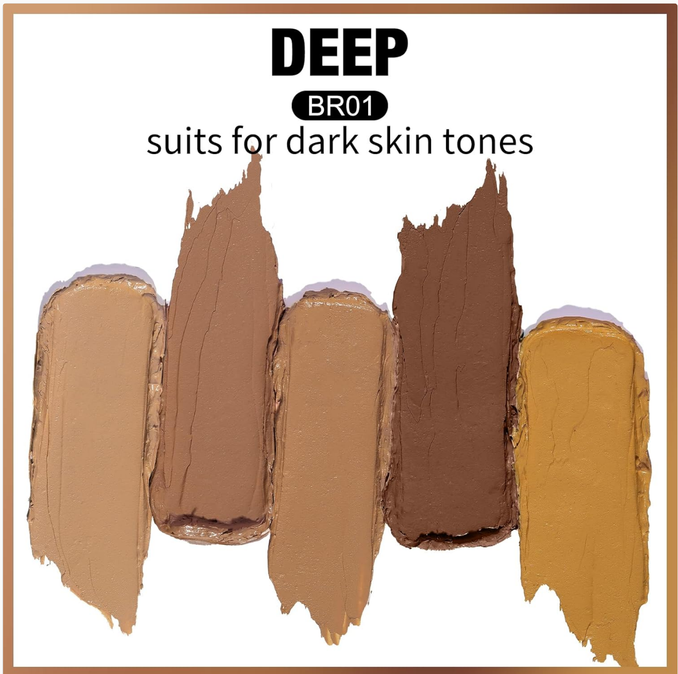
Image 3.1: Swatches of the five shades from the FOCALLURE #GoldenAge 5 in 1 Multi Uses Concealer Palette, BR01 DEEP, displayed on skin to show their individual tones and textures.