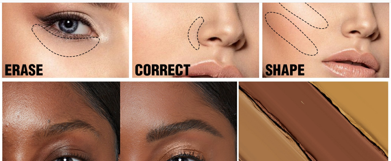
Image 4.4: This image showcases the multi-use capabilities of the palette, demonstrating how to erase, correct, and shape facial features using different shades and techniques.