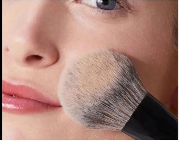
Image 4.1: This image illustrates the step-by-step method of using the FOCALLURE concealer palette, detailing how to warm the product, apply it to specific areas, and blend for desired effects.