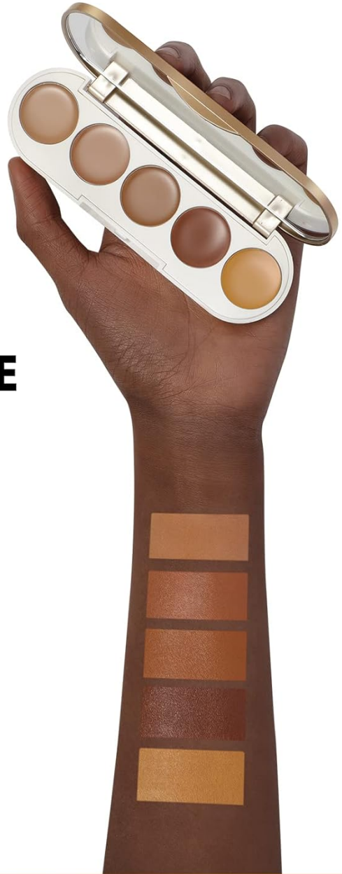
Image 4.5: A 'Before and After' comparison showing the transformative effect of using the FOCALLURE #GoldenAge Concealer Palette, BR01 DEEP, on skin, highlighting improved tone and coverage.