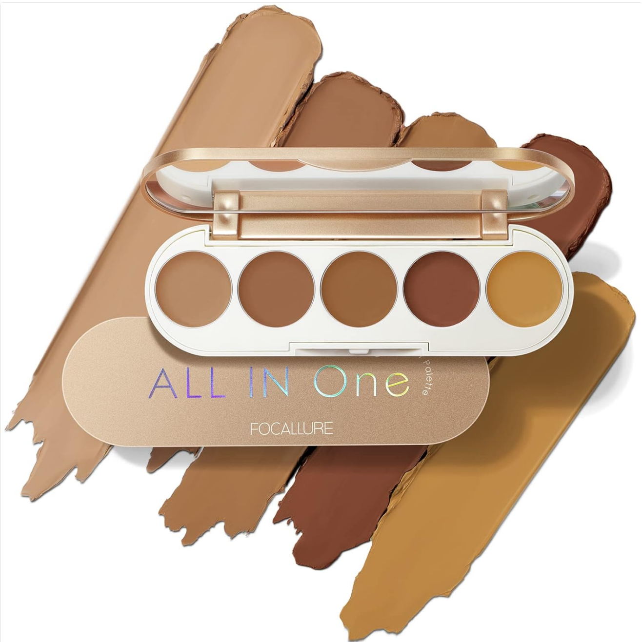
Image 1.1: FOCALLURE #GoldenAge 5 in 1 Multi Uses Concealer Palette, BR01 DEEP. This image displays the open palette with five creamy shades, accompanied by swatches of the shades on a surface, indicating their texture and color range.