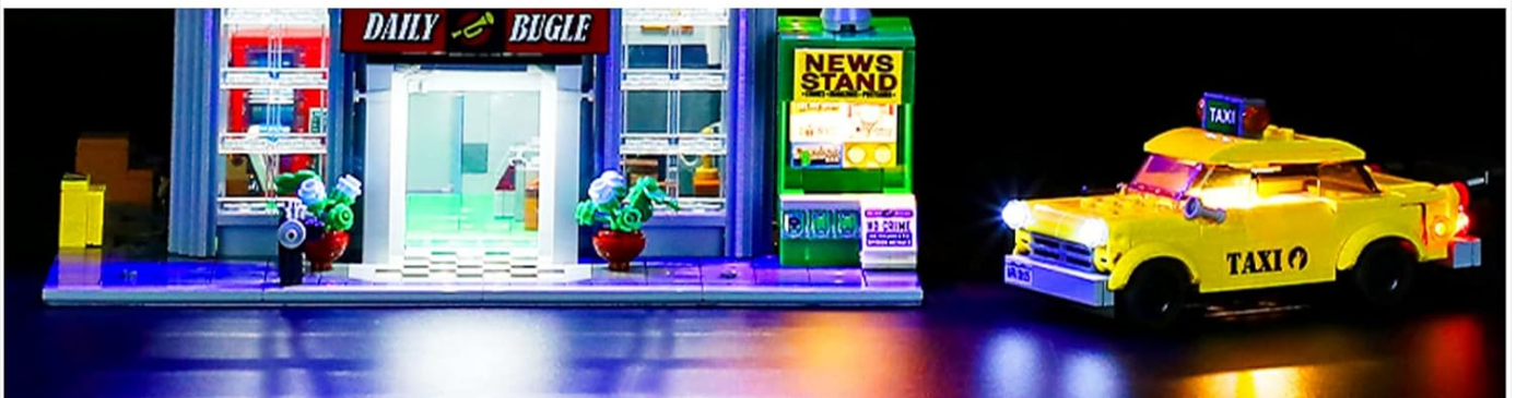
Detailed view of the illuminated Daily Bugle, highlighting the integrated lighting in different sections like the news screen and top sign.