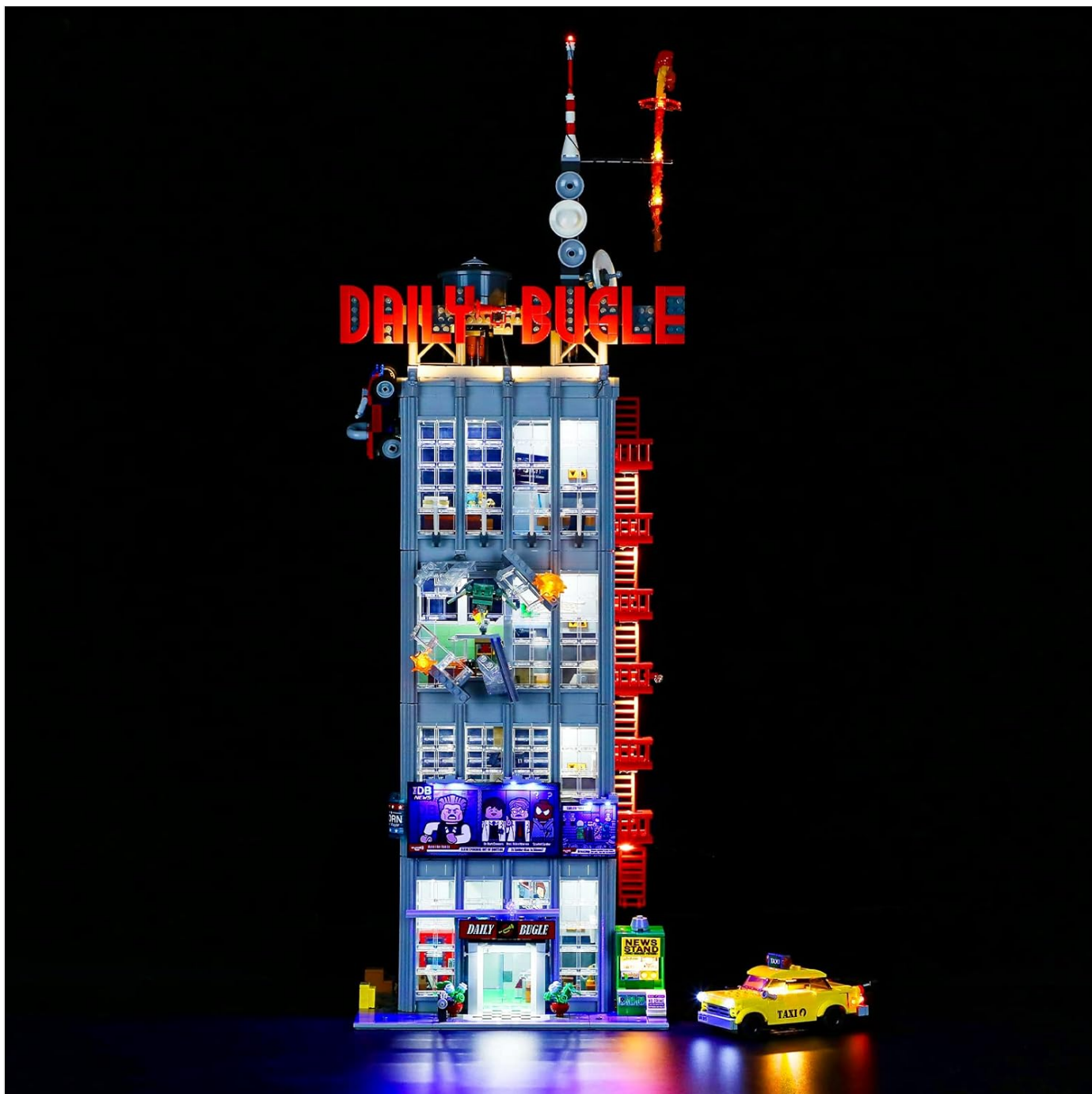
The LEGO Daily Bugle model illuminated by the YEABRICKS LED Light Kit, showcasing the vibrant lighting effects.