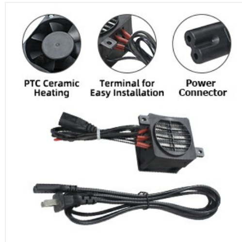
Image 6.1: Close-up views highlighting the PTC ceramic heating element, the terminals for wiring, and the power connector for easy installation and operation.