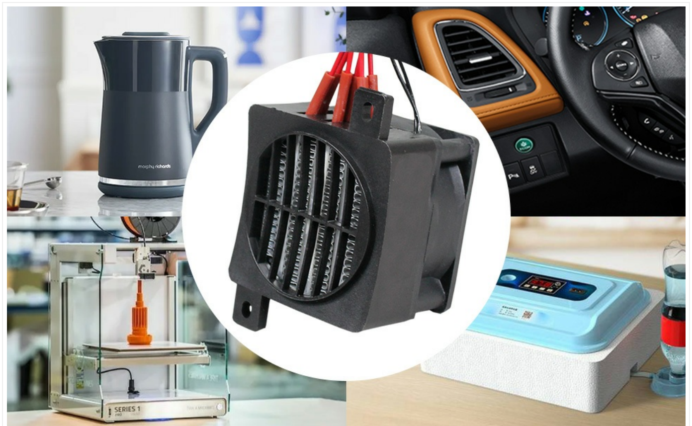
Image 9.1: Visual examples of the PTC Fan Heater's wide range of applications, such as maintaining temperature in 3D printer enclosures, warming car interiors, and providing heat for small incubators.