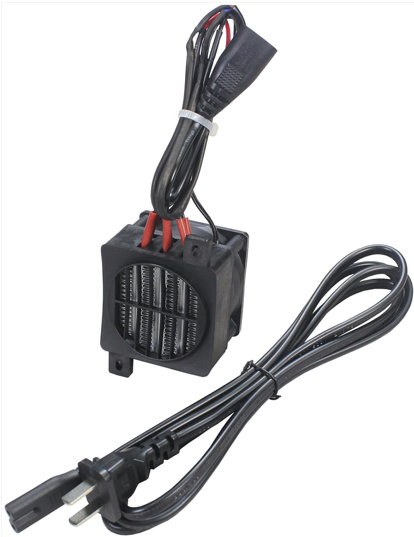
Image 1.1: The PTCYIDU 110V 400W PTC Fan Heater, showing the compact heating unit and its accompanying power cord.