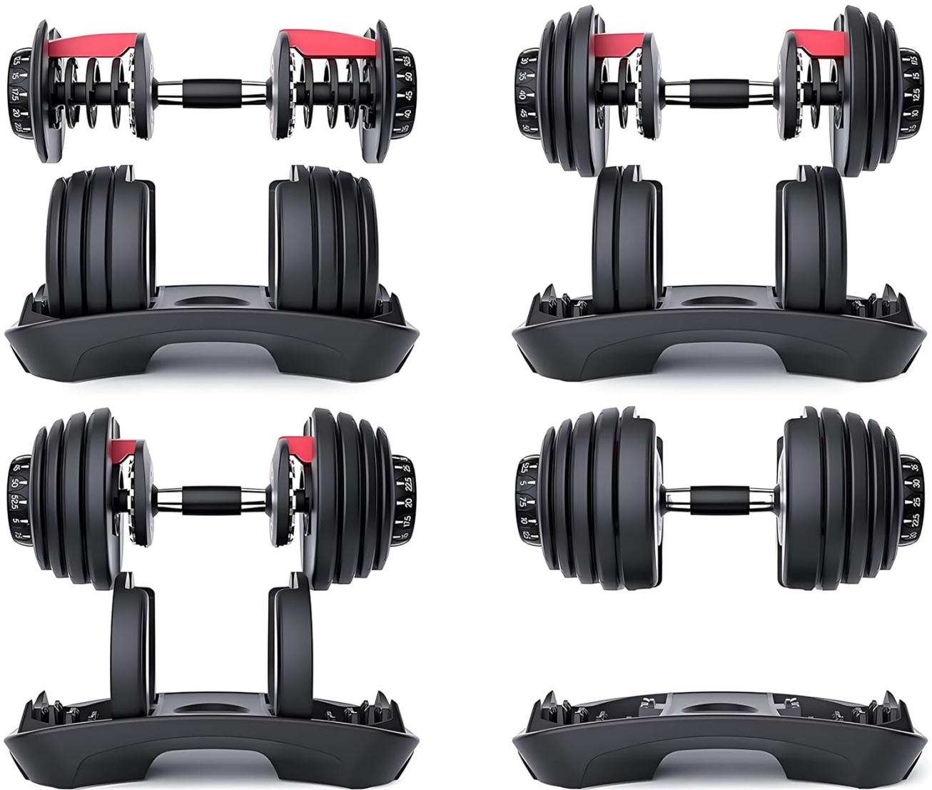
Image: Visual representation of the dumbbell configured for various weight settings, demonstrating its versatility.