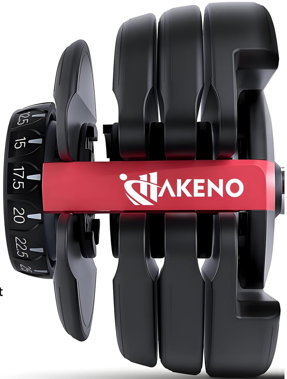
Image: Overview highlighting the 15 weight adjustment gears, 10-way safety lock system, and 3-second quick switch feature.