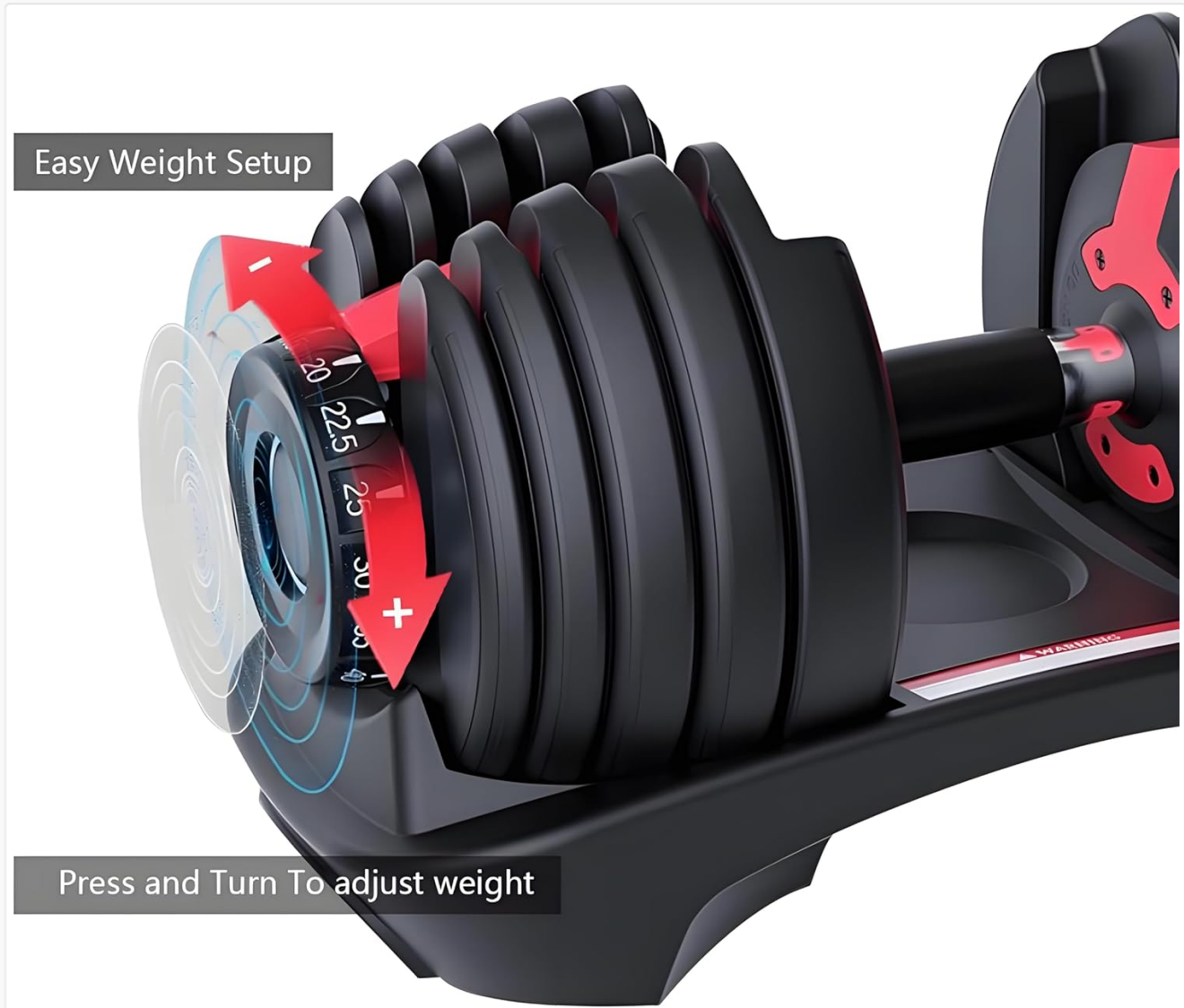
Image: Dumbbell seated in its tray, illustrating the 'Press and Turn' mechanism for weight adjustment.