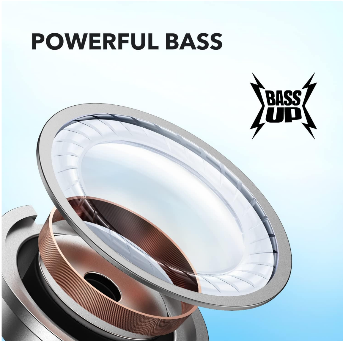
Image: Powerful Bass. A detailed diagram illustrating the internal 10mm driver of the soundcore P20i earbuds, emphasizing its design for delivering powerful bass.