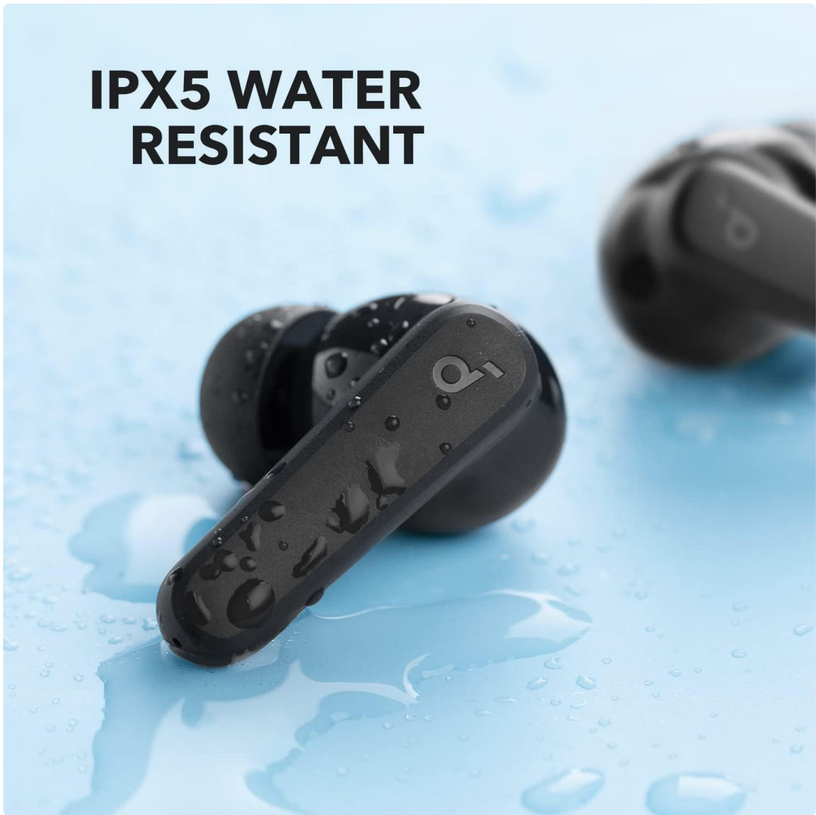
Image: IPX5 Water Resistant. A close-up of a soundcore P20i earbud with water droplets on its surface, visually confirming its IPX5 water resistance.