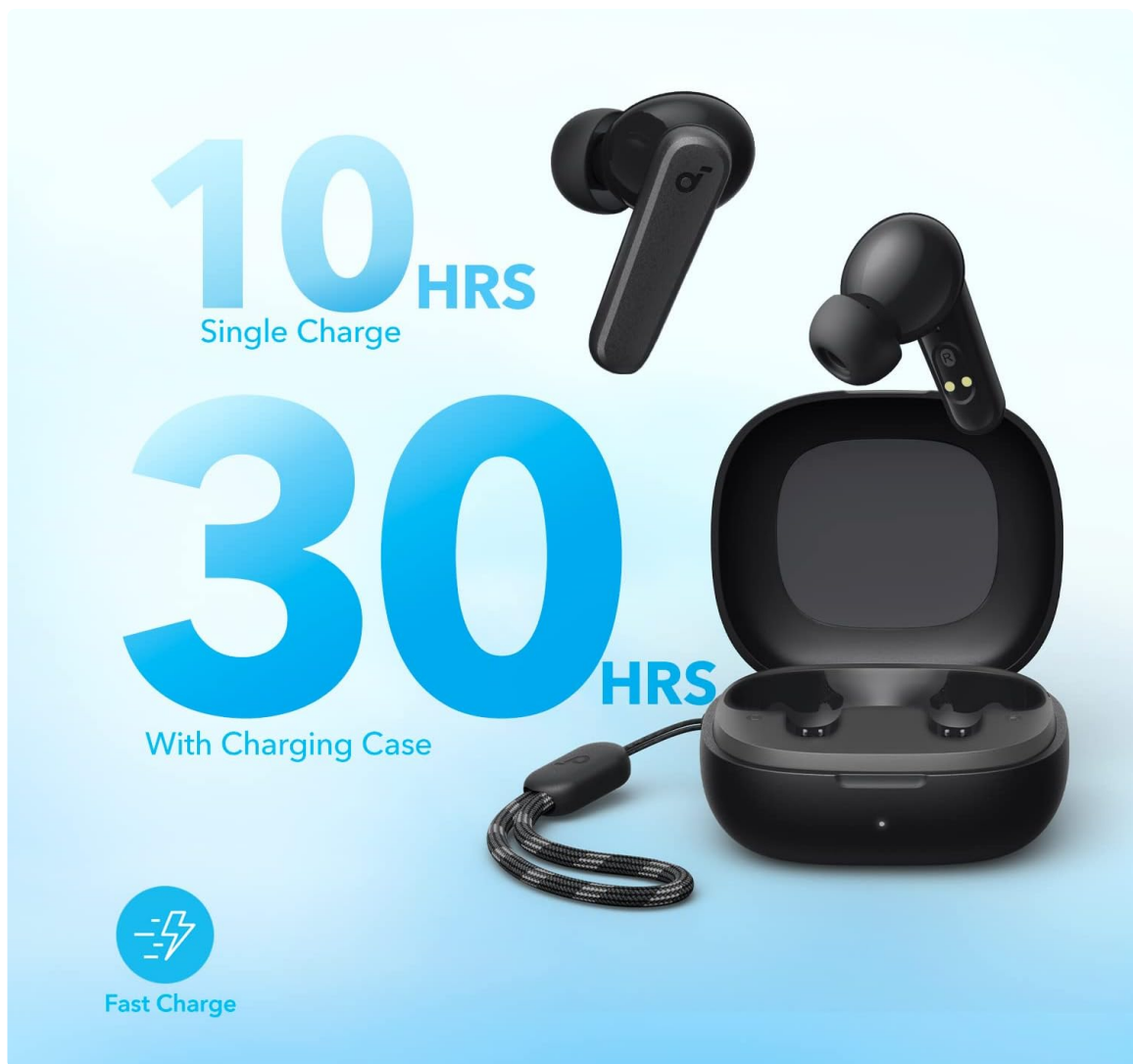
Image: Long Playtime, Fast Charging. This graphic illustrates the battery life of the soundcore P20i earbuds, showing 10 hours on a single charge and 30 hours total with the charging case, along with a fast charging icon.