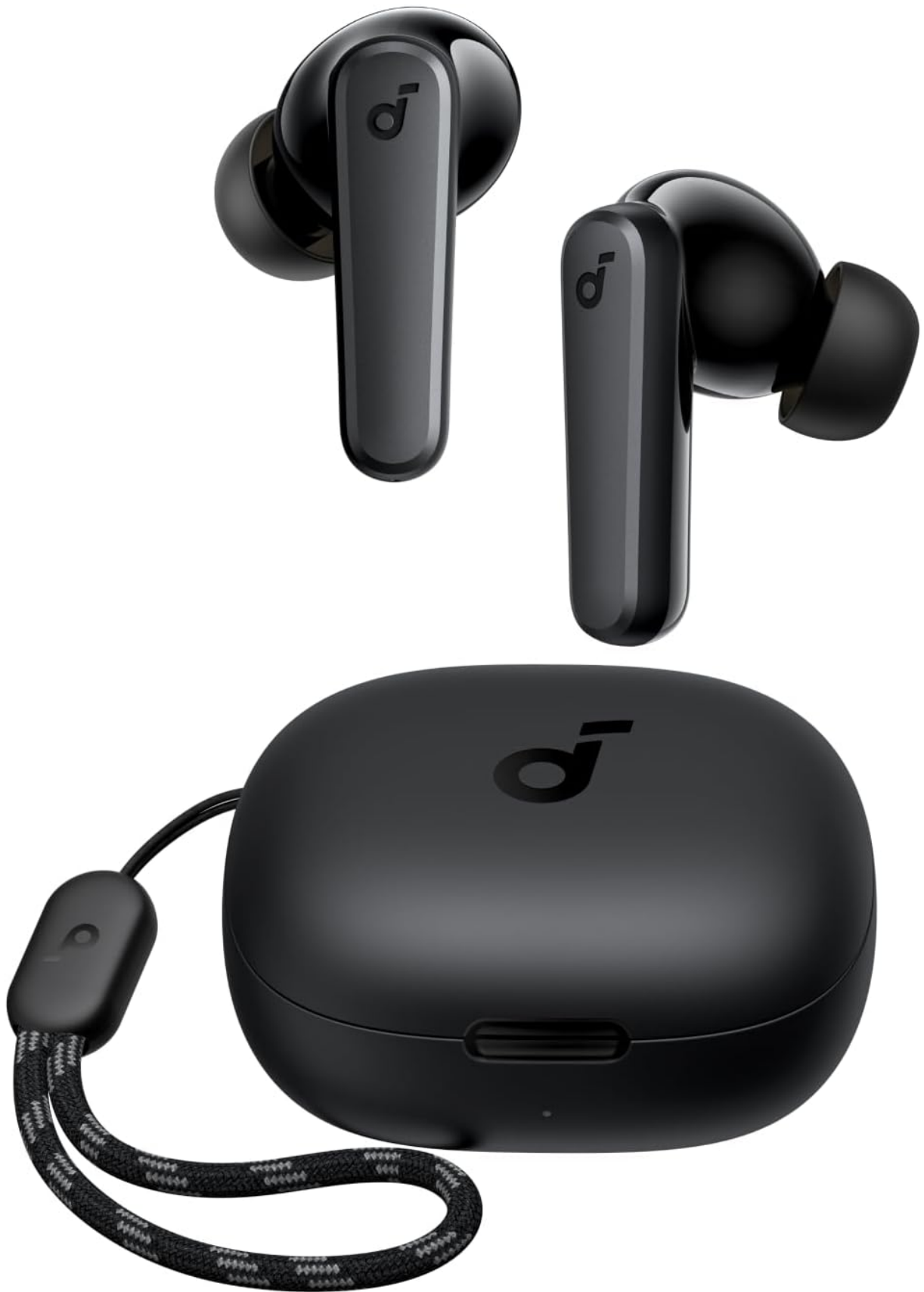
Image: soundcore P20i True Wireless Earbuds and Charging Case. This image displays the black soundcore P20i earbuds alongside their compact charging case, which features an integrated lanyard for portability.