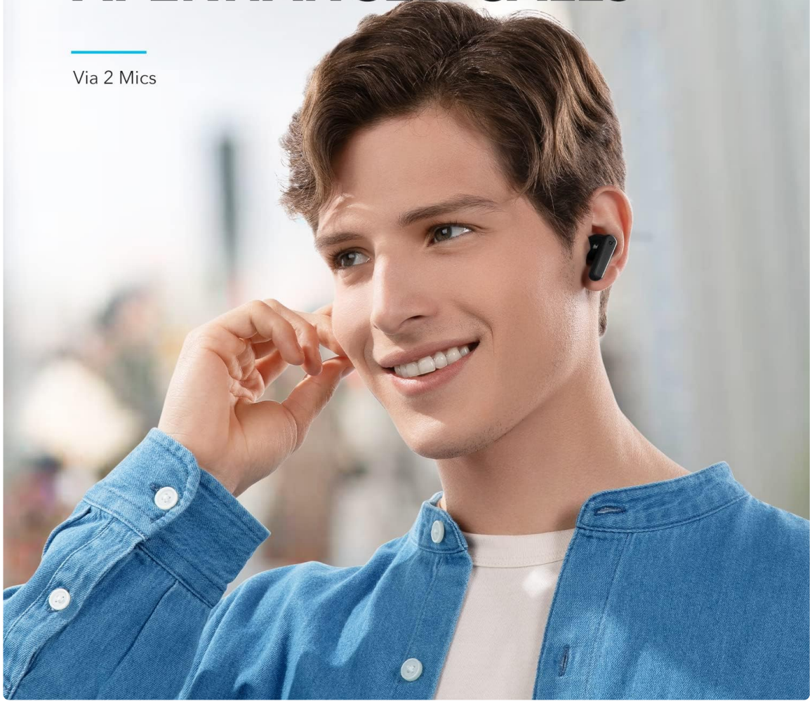
Image: AI-Enhanced Calls. A person is shown wearing the soundcore P20i earbuds, demonstrating the clear call quality facilitated by the dual AI-enhanced microphones.