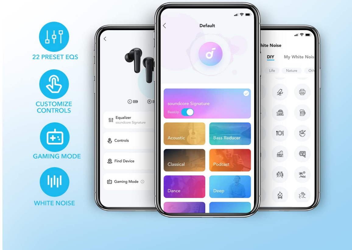
Image: Personalized Experience with App. Multiple smartphone screens showcasing the soundcore app's user interface, highlighting features like 22 preset equalizers, customizable controls, gaming mode, and white noise options.