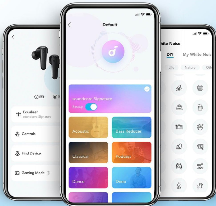
Image: A smartphone screen displaying the Soundcore app interface, highlighting the 22 preset EQ options and customization features for a personalized audio experience.