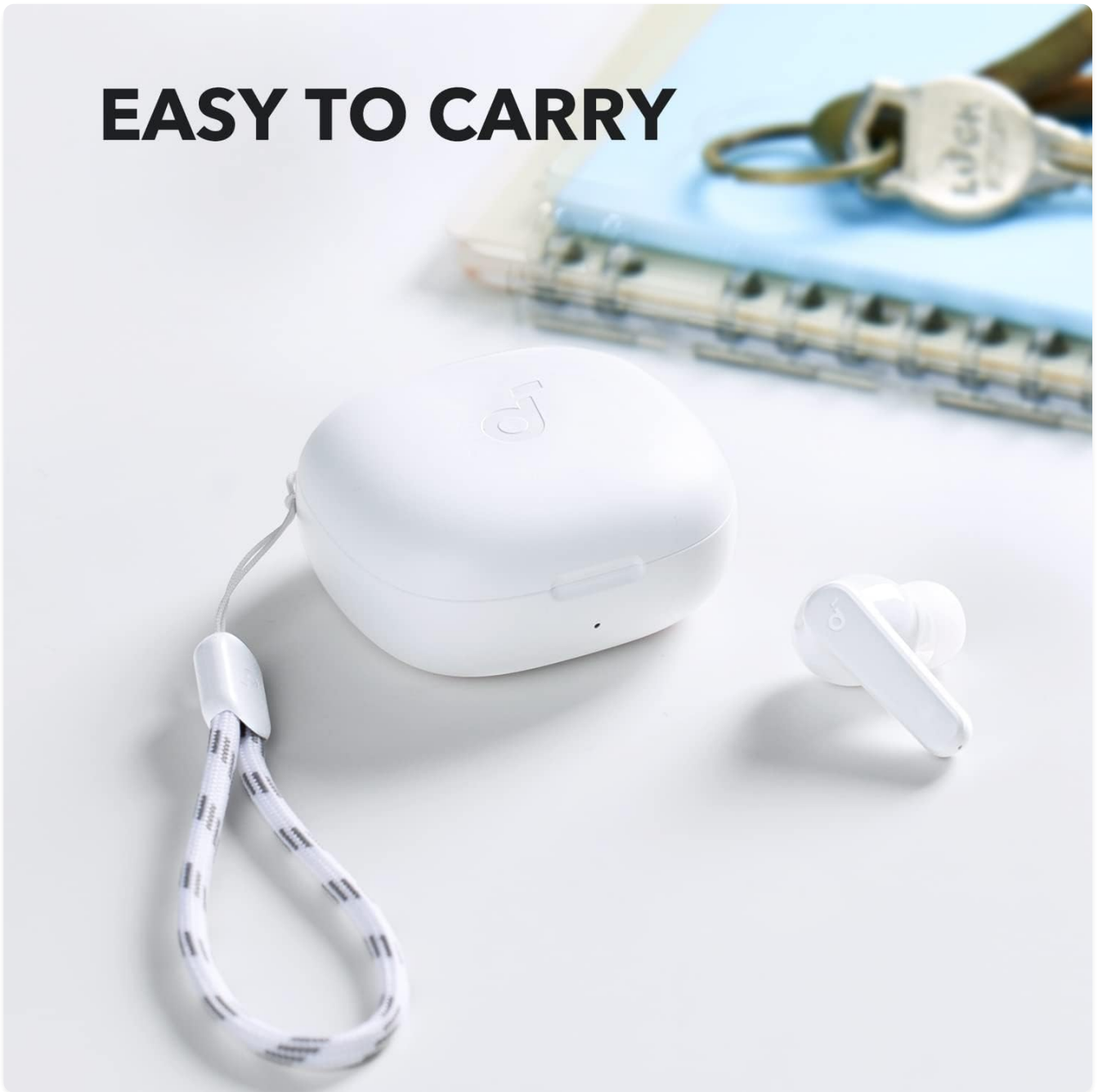
Image: The compact Soundcore P20i charging case with its attached lanyard resting on a table next to a single earbud, emphasizing its portability.