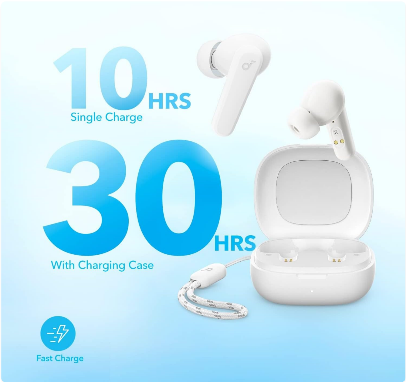
Image: An illustration showing the Soundcore P20i earbuds and case with text indicating 10 hours of playtime on a single charge and 30 hours with the charging case, along with a "Fast Charge" icon.