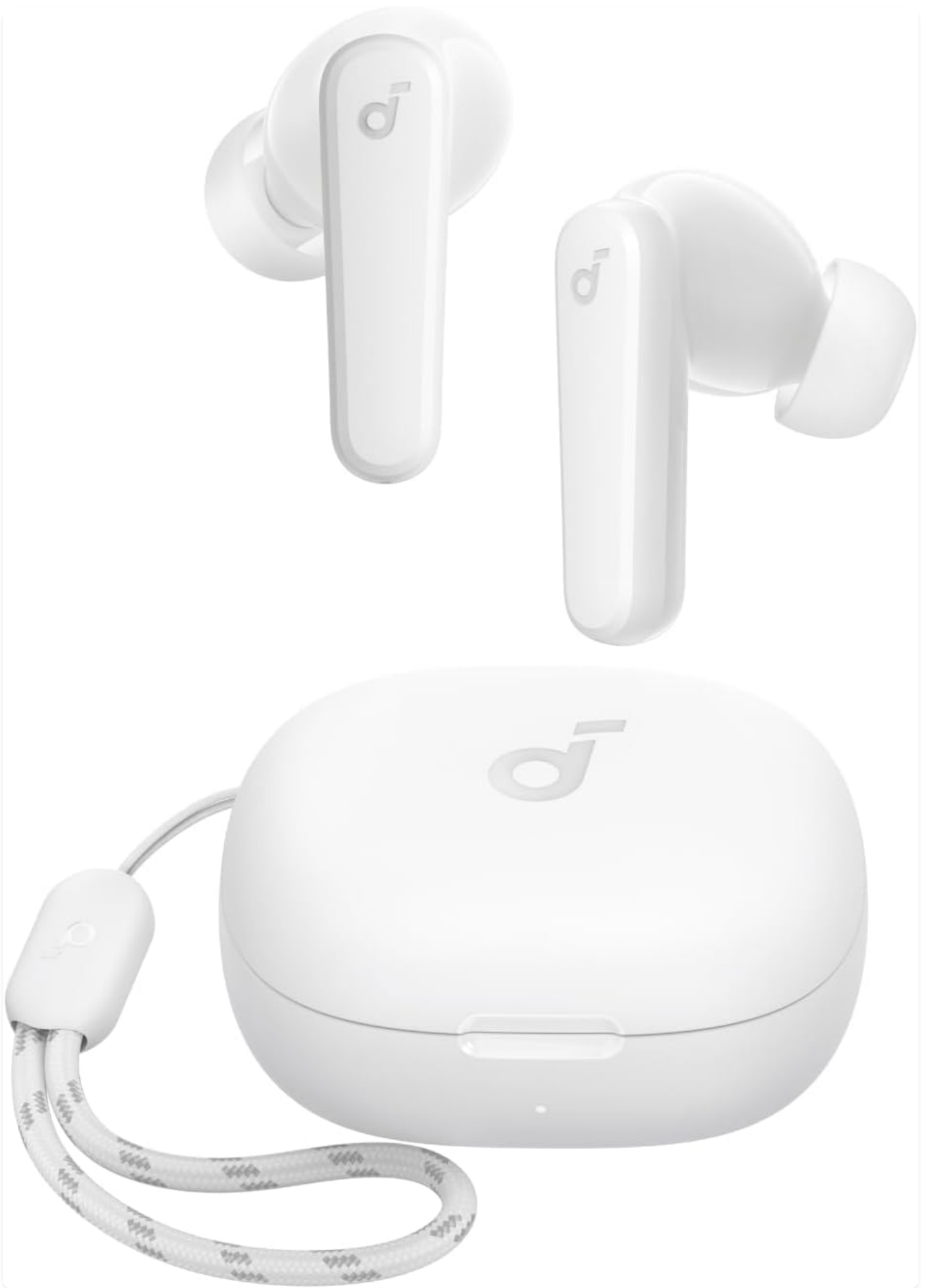
Image: Soundcore P20i True Wireless Earbuds and their compact charging case, along with the included lanyard.