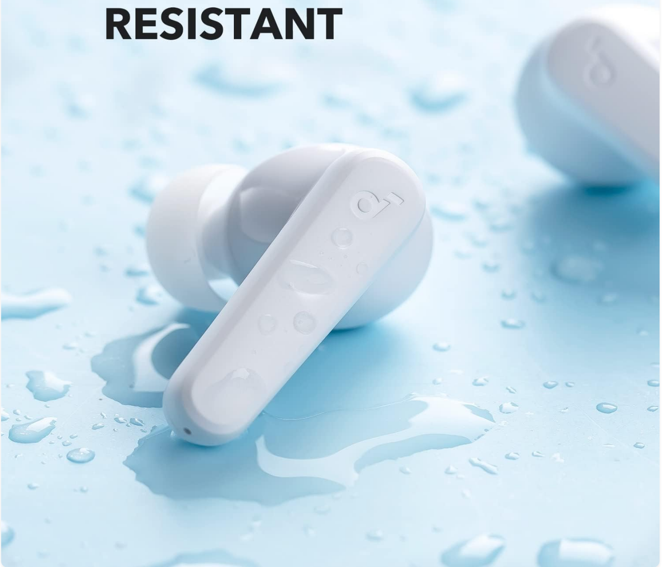
Image: Close-up of a Soundcore P20i earbud with water droplets on its surface, illustrating its IPX5 water-resistant rating.