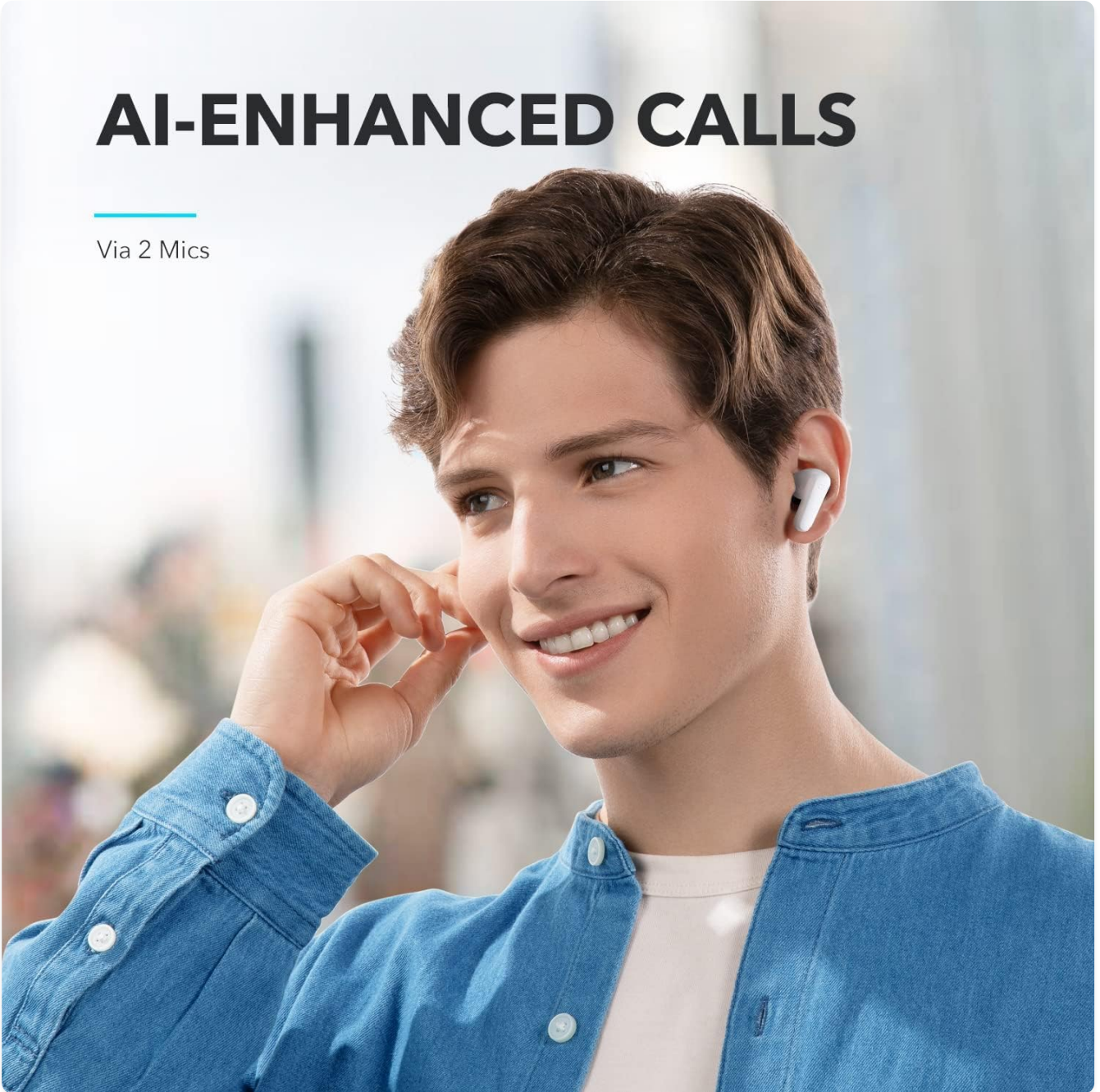
Image: A man smiling while wearing Soundcore P20i earbuds, demonstrating their use for clear, AI-enhanced phone calls.