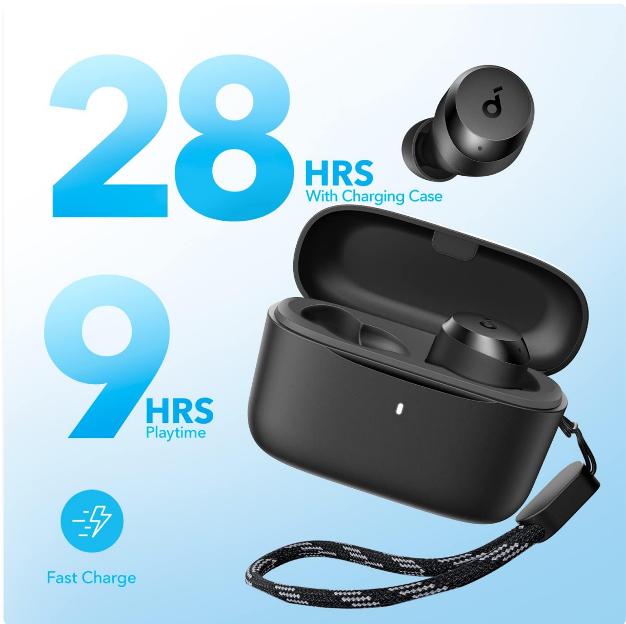
Image: The Soundcore A20i charging case with indicators for 9 hours of earbud playtime and 28 hours of total playtime with the case, emphasizing fast charging capabilities.