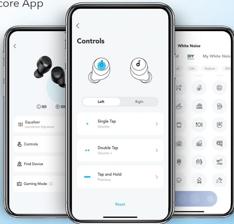
Image: The Soundcore app's control customization screen, allowing users to assign functions to single tap, double tap, and tap and hold gestures for each earbud.