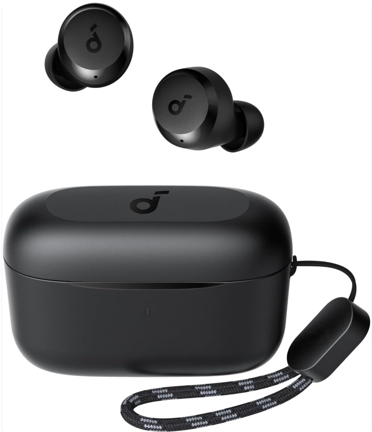
Image: Soundcore A20i True Wireless Earbuds and their compact charging case.