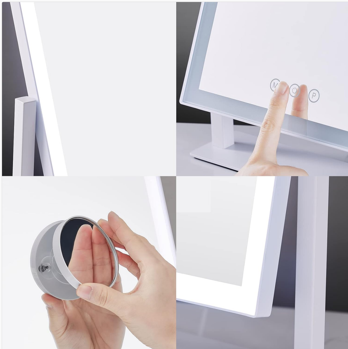
Image: Close-up view of the mirror's touch controls and the detachable 5X magnification mirror. The image highlights the 'M', power, and 'P' buttons on the mirror's surface, along with a hand demonstrating the attachment of the small round 5X mirror.

3. Plug the power adapter into a wall outlet.