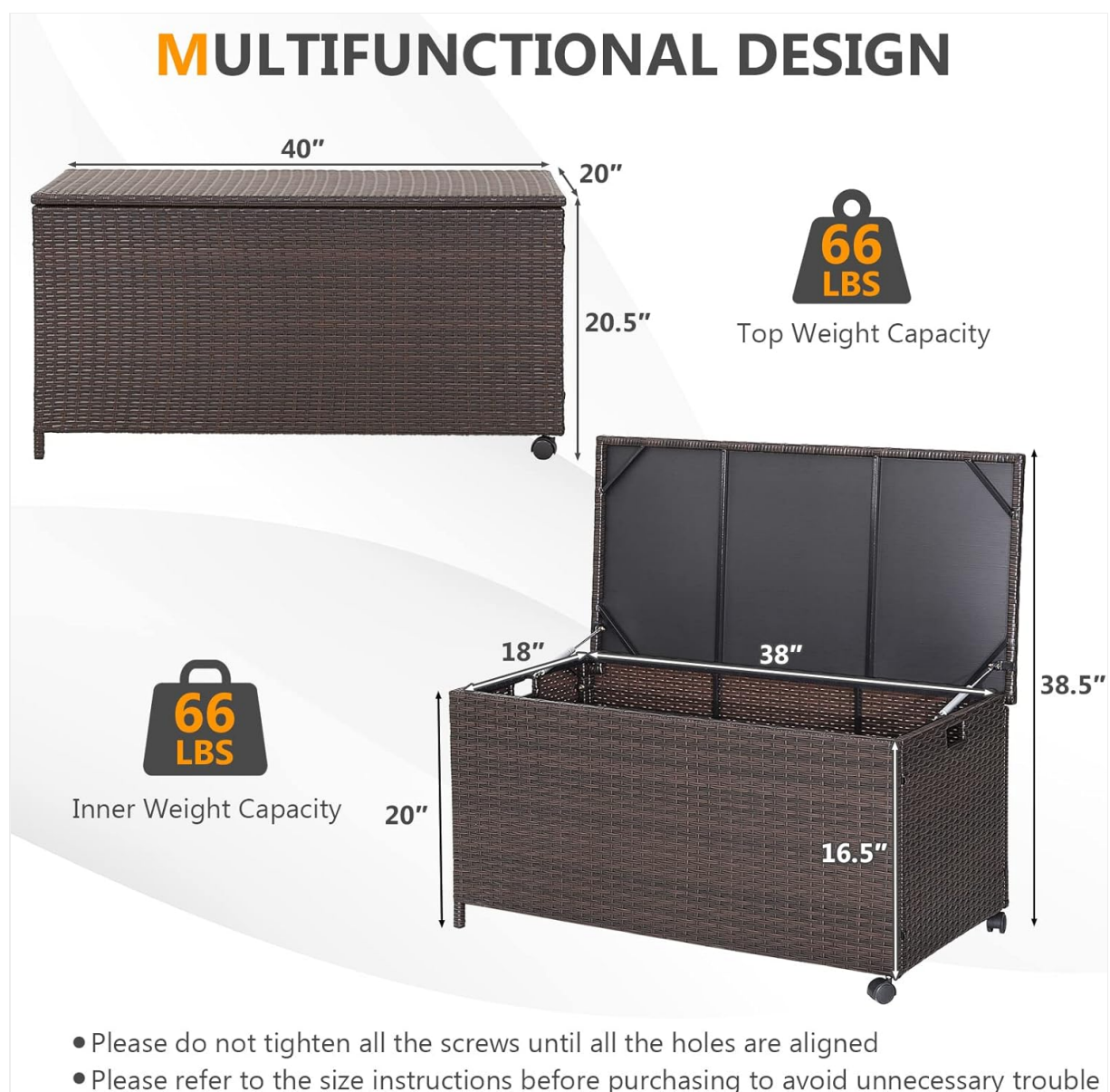
Figure 1: Product dimensions and internal structure. The overall dimension is 40"L x 20"W x 20.5"H, with an inner dimension of 38"L x 18"W x 16.5"H. The top and interior weight capacity is 66 lbs each.

Important Note: Please do not tighten all screws completely until all holes are aligned to avoid unnecessary trouble during assembly.