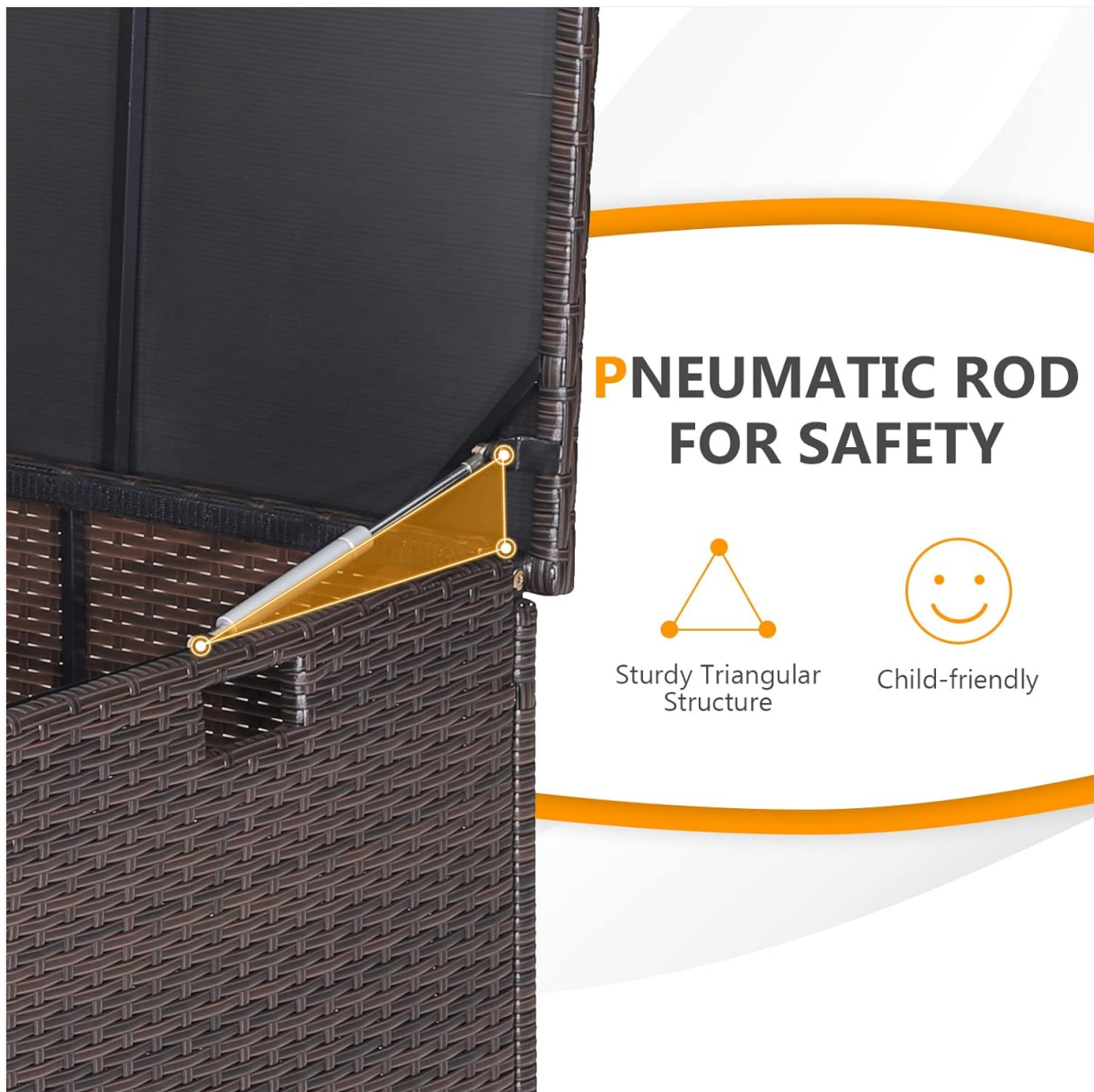
Figure 4: The pneumatic rod ensures safe and effortless opening and closing of the lid.