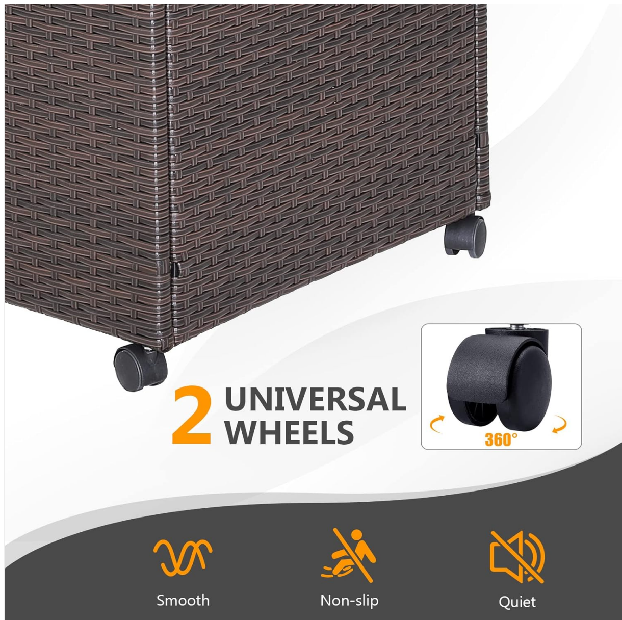
Figure 3: The storage box features two universal wheels for easy mobility across various outdoor surfaces.