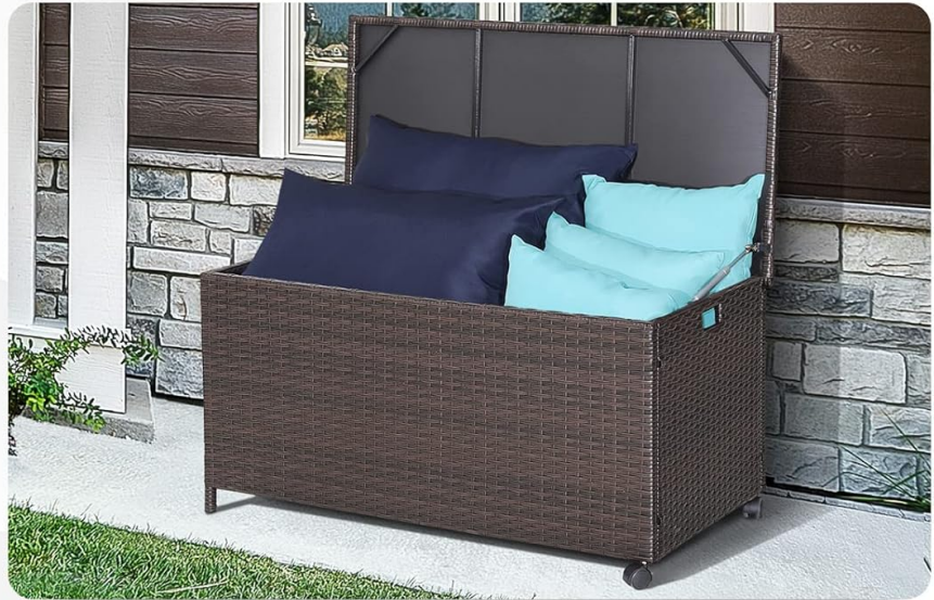
Outdoor Storage Box