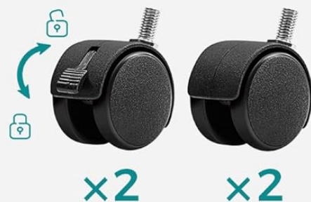
Image: A detailed view of the four swivel wheels, two of which are lockable, allowing for easy movement and secure positioning of the garment rack.