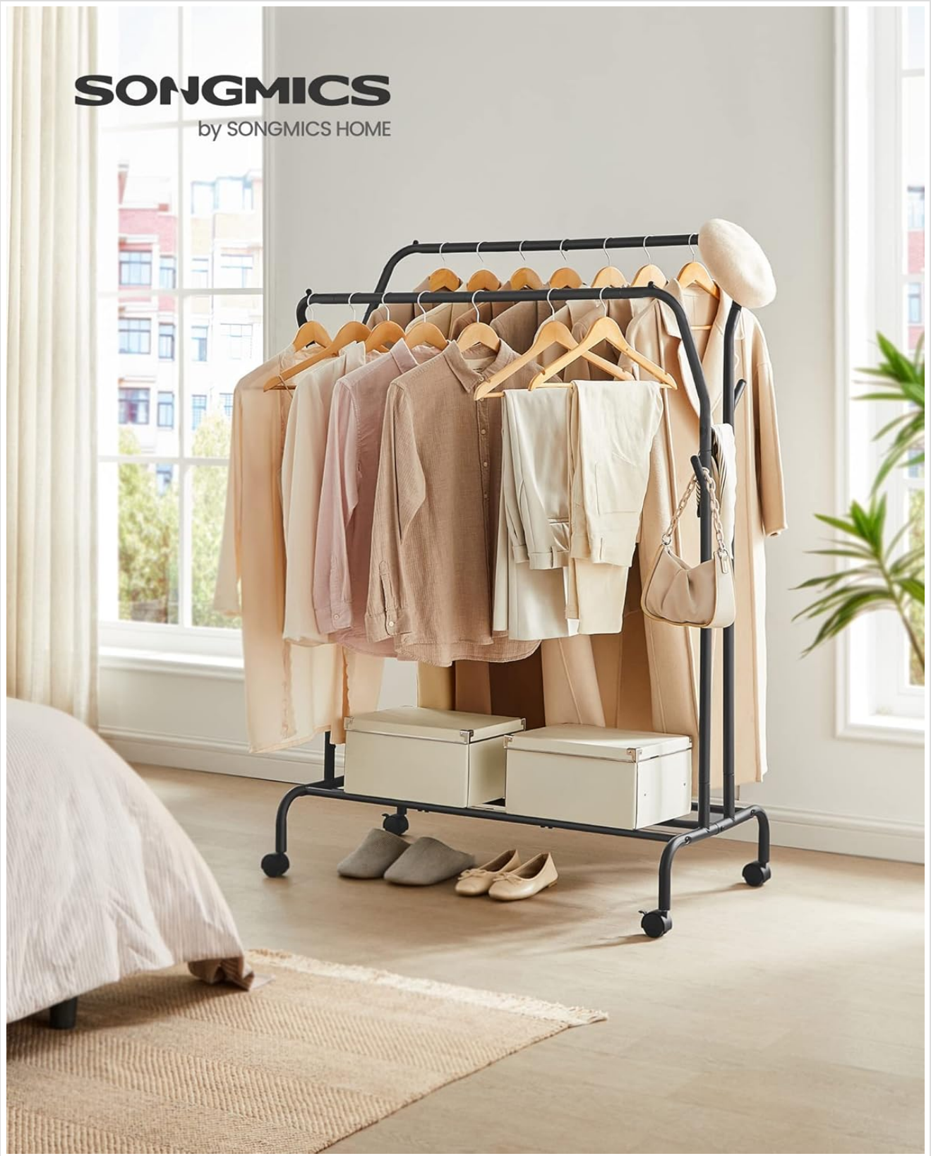
Image: The clothing rack in a room setting, showcasing its large capacity with various garments hanging on both rods and storage boxes placed on the bottom shelf.