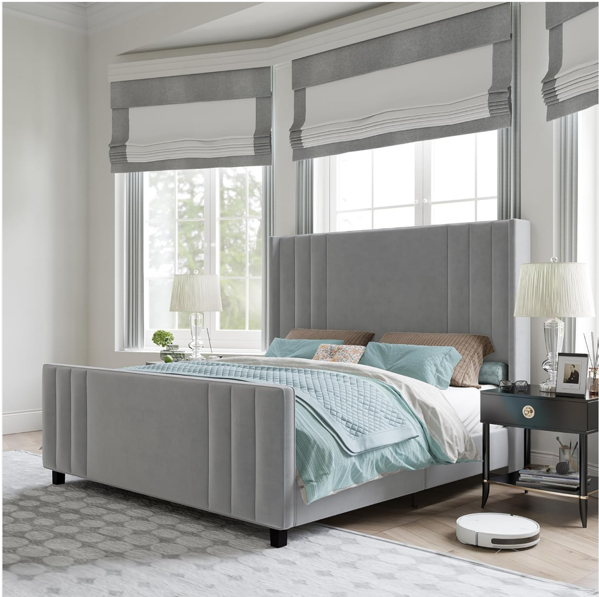
Image 1: Fully assembled AMERLIFE Queen Size Bed Frame in Light Grey.