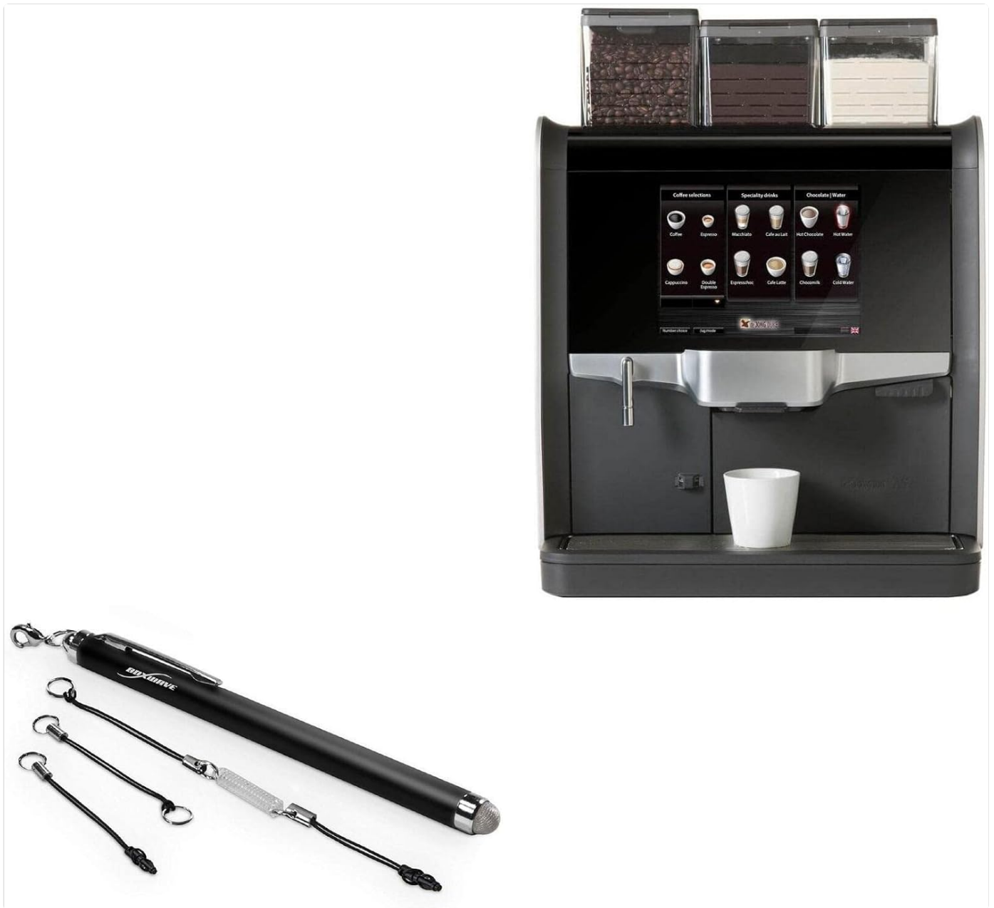
Image 1.1: The BoxWave EverTouch Capacitive Stylus Pen shown with its included lanyard attachments.