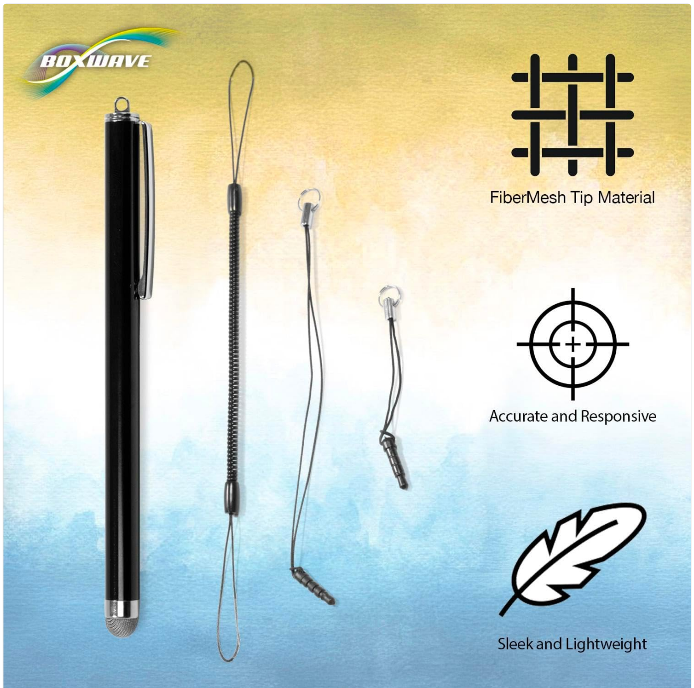
Image 2.1: Visual representation of the stylus's key features: FiberMesh tip, accuracy, and lightweight design.