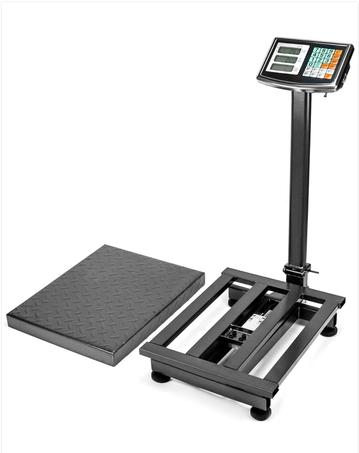
Image: The scale platform separated from its frame, illustrating the internal structure and connection points for assembly.