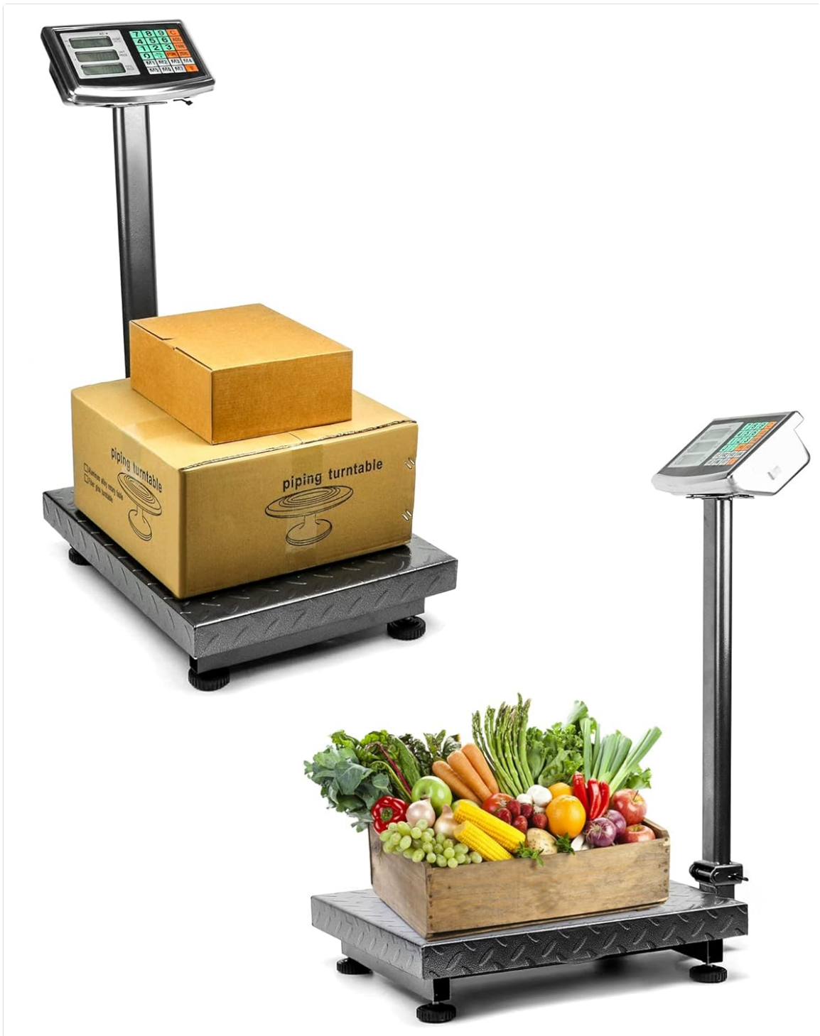
Image: The digital floor scale in use, showing packages and a crate of produce being weighed on the platform.