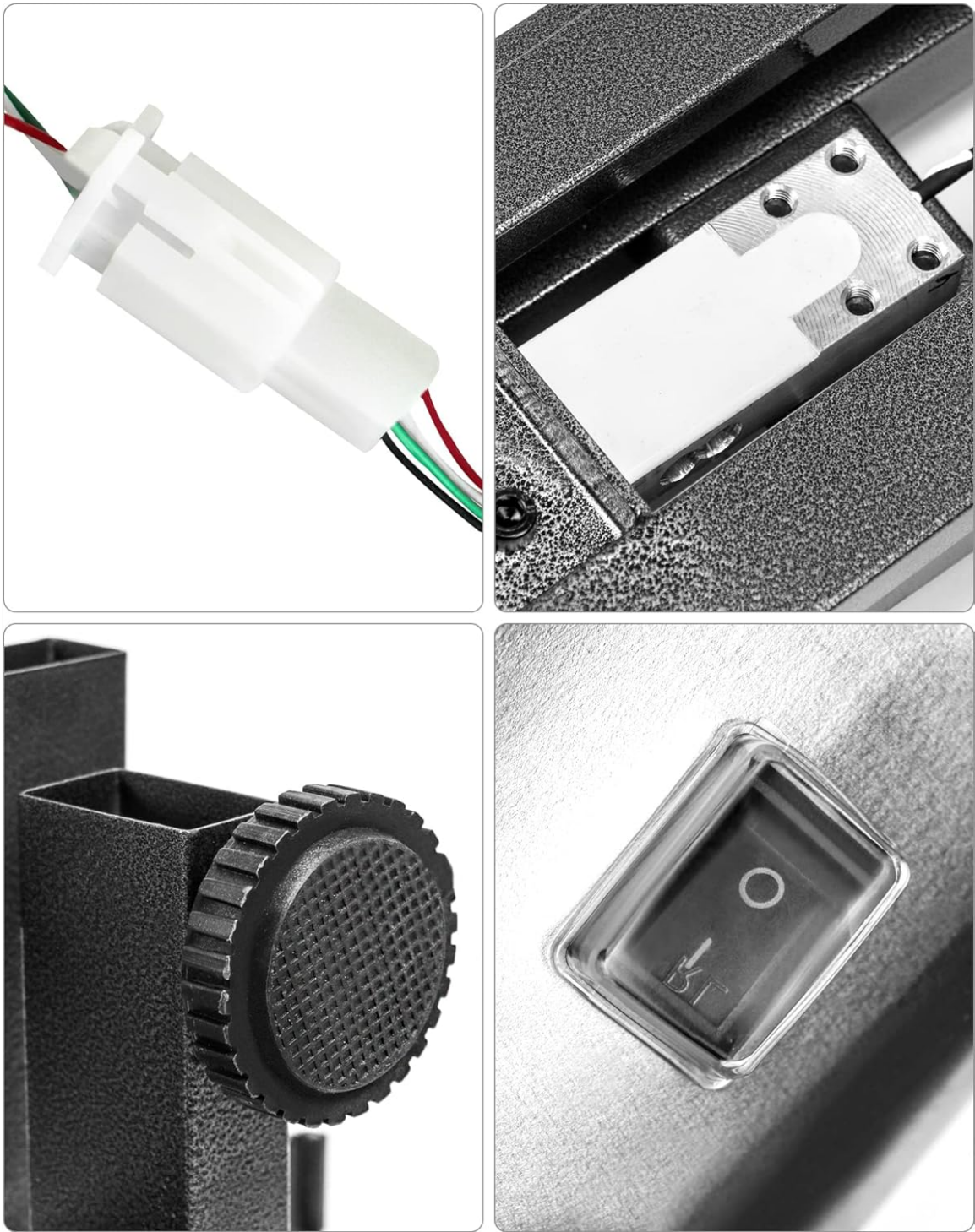
Image: Close-up views of the scale's internal wiring connector, load cell, adjustment knob for the display stand, and power switch.