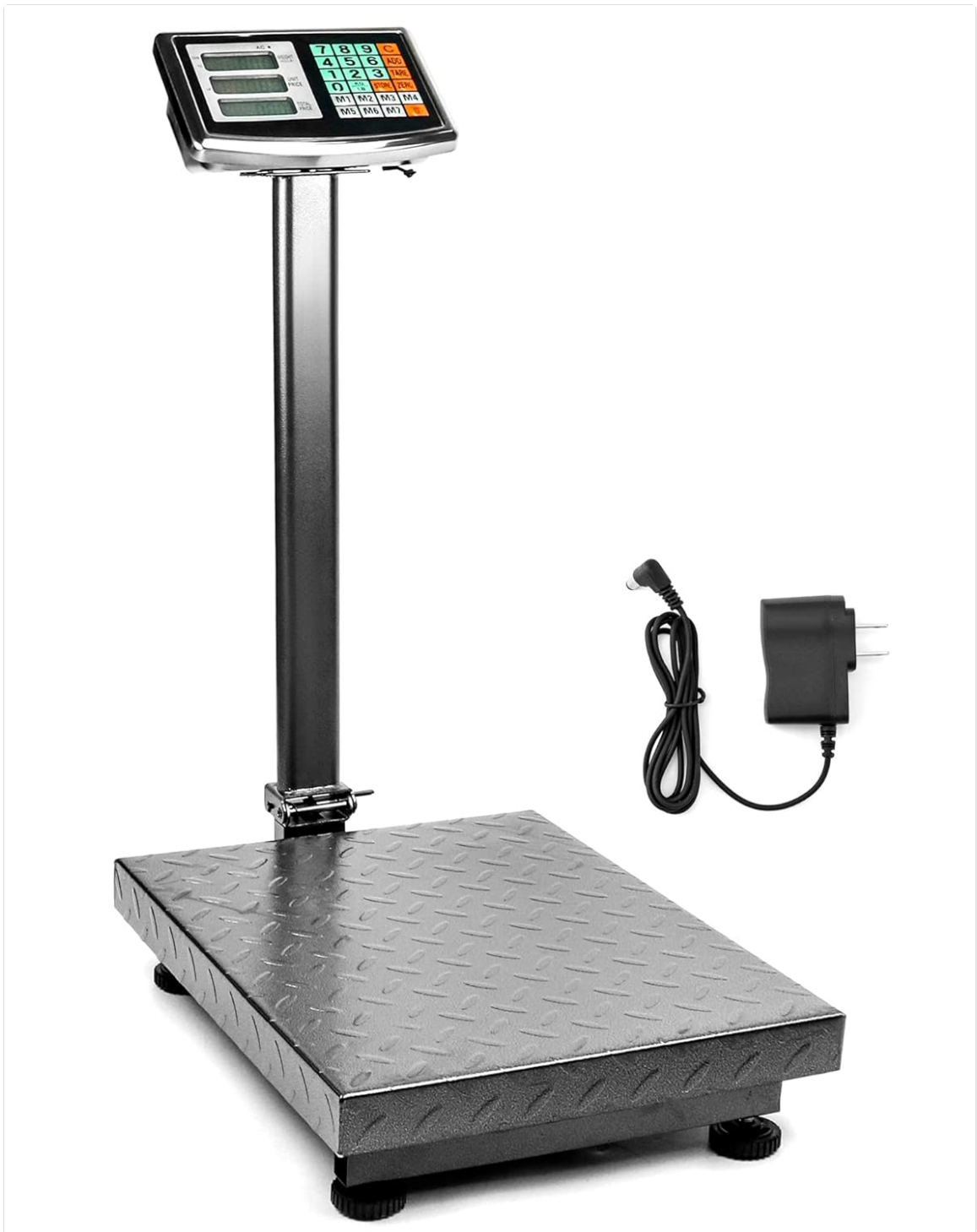
Image: The QWORK WD10229 Digital Floor Scale with its display unit, platform, and the included power adapter.