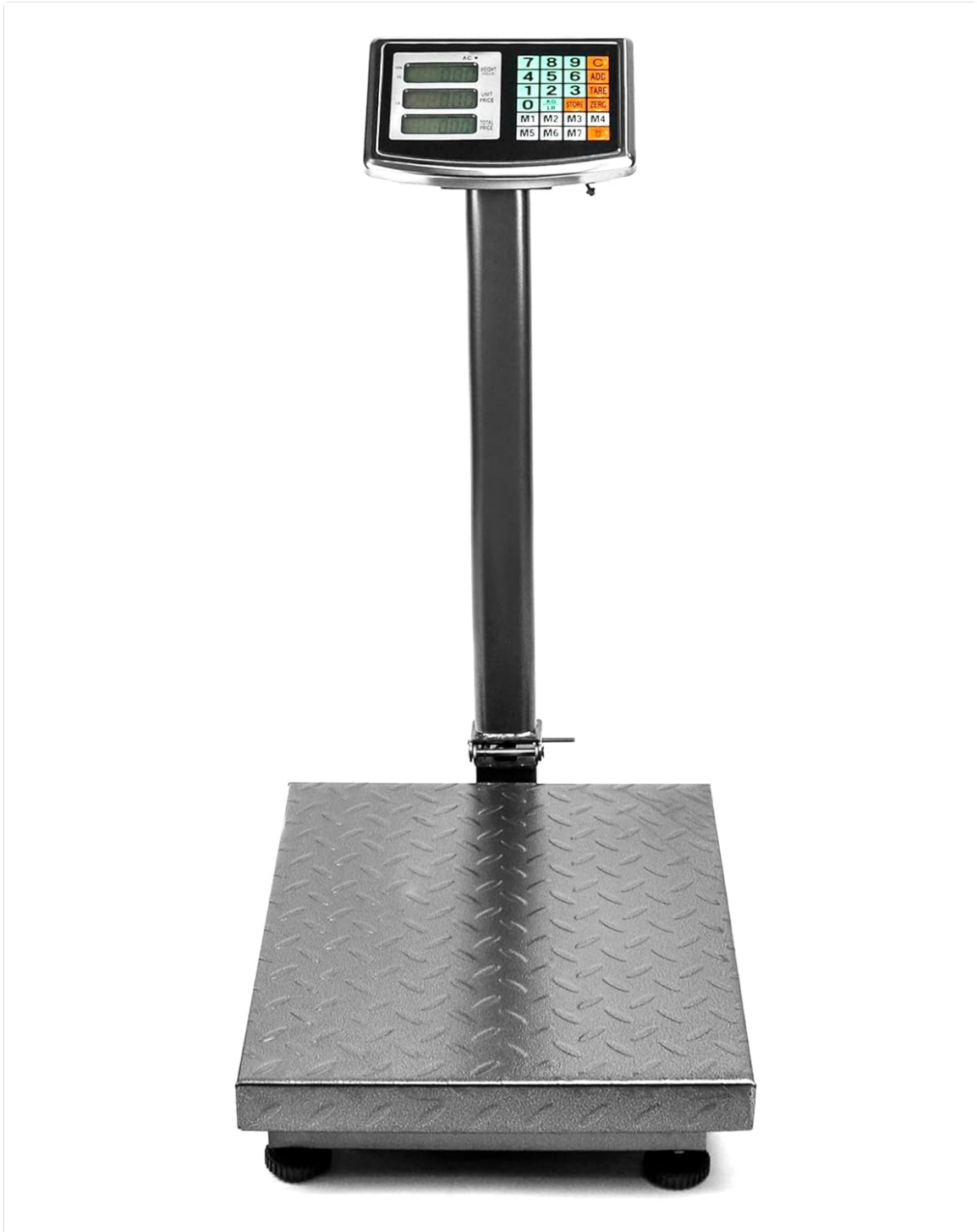
Image: Front view of the QWORK WD10229 Digital Floor Scale, showing the platform and display unit.