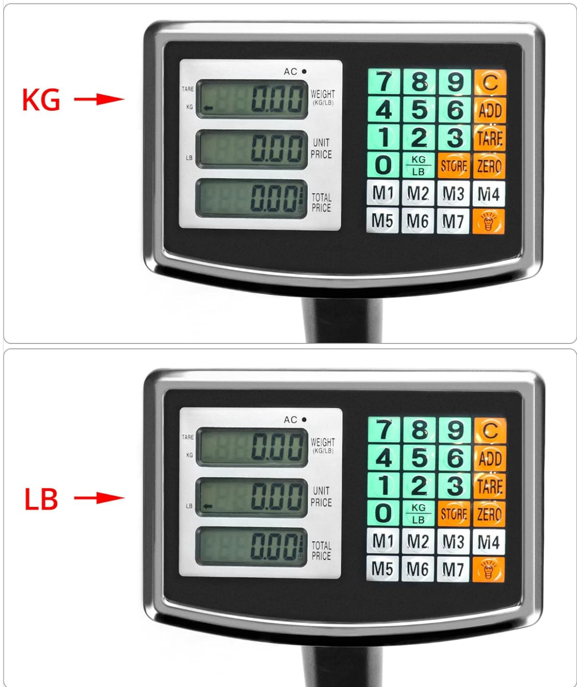
Image: Close-up of the scale's digital display, illustrating the unit conversion function between kilograms (KG) and pounds (LB).