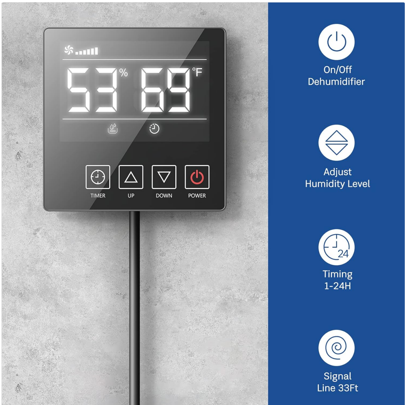
Image 2.1: Front view of the LUBAIR Remote Controller display, showing humidity and temperature readings, along with control buttons for Timer, Up, Down, and Power.