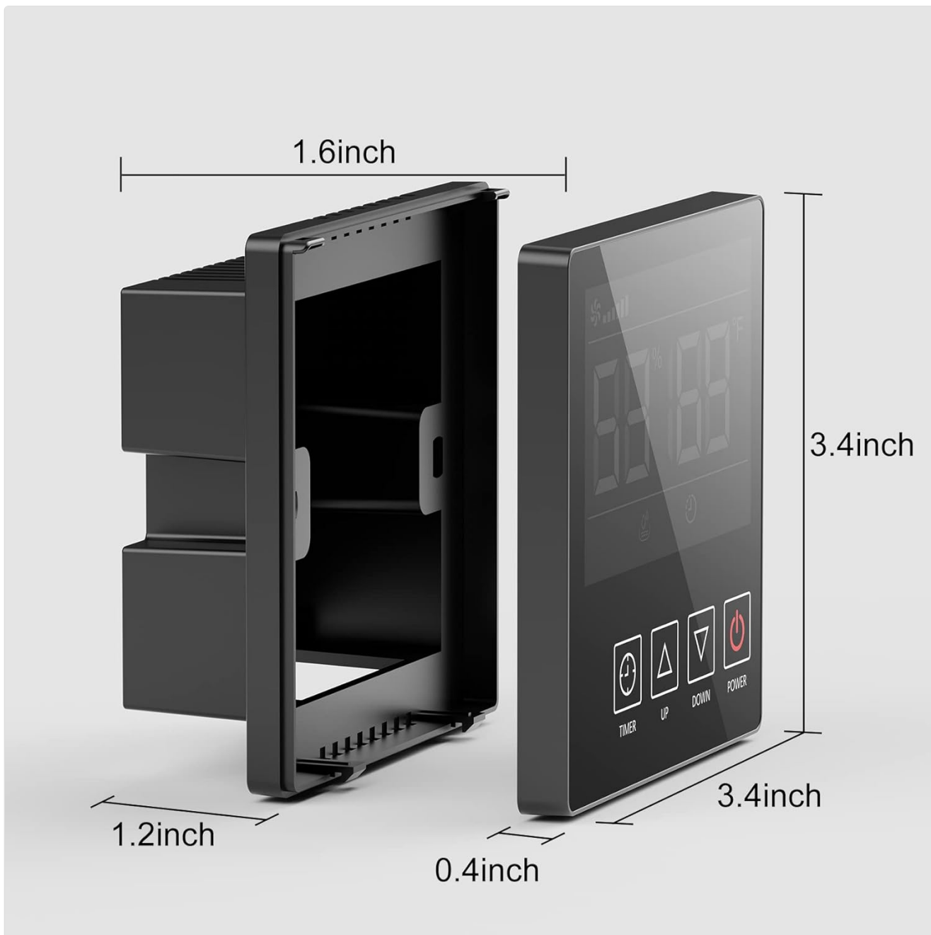
Image 4.1: Detailed dimensions of the LUBAIR Remote Controller, showing its width (3.4 inches), height (3.4 inches), and depth (1.6 inches for the main unit, 0.4 inches for the display panel, and 1.2 inches for the recessed part).

The remote controller can be conveniently mounted on a wall for easy access. Refer to the dimensions below for proper placement.