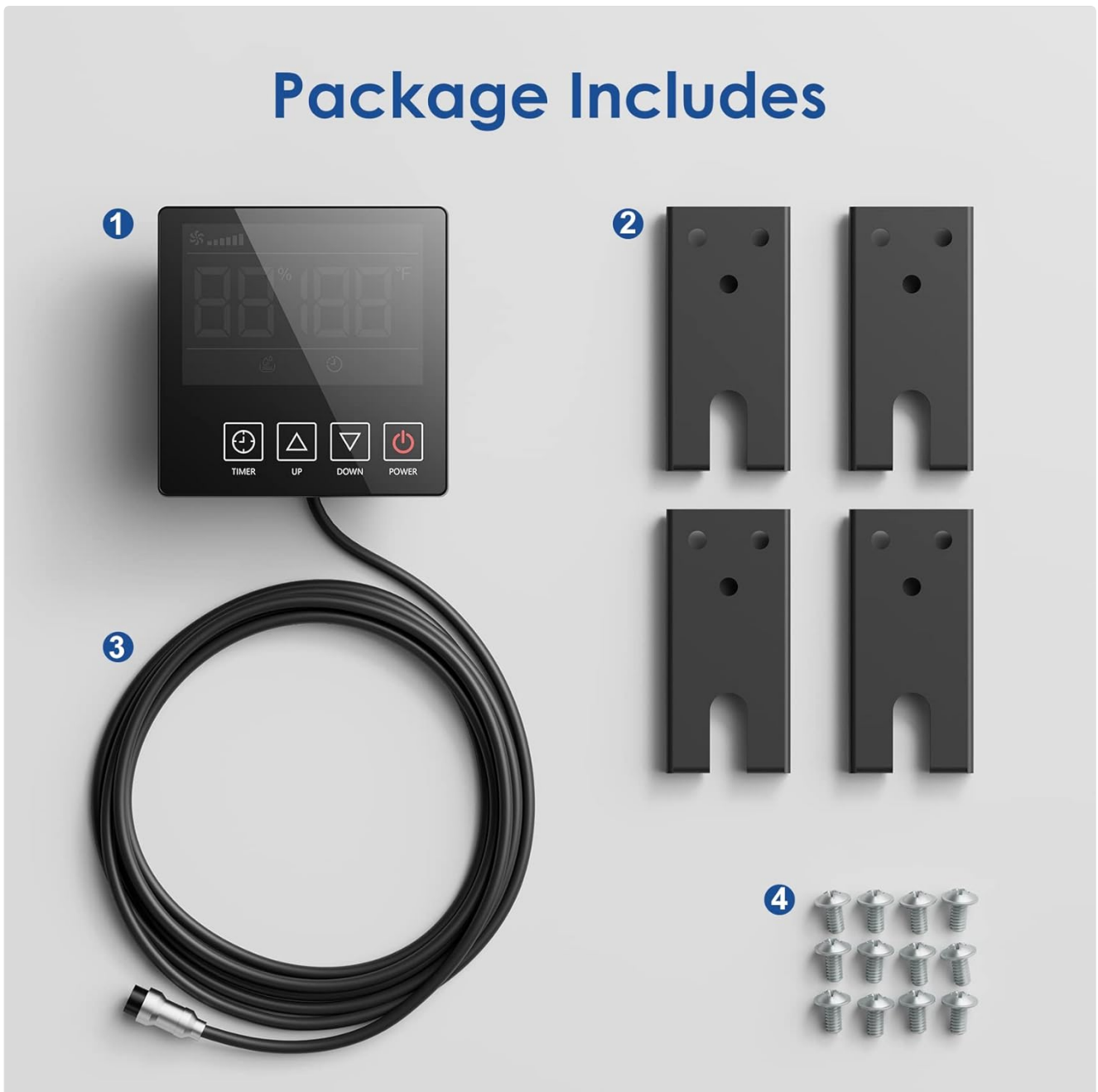
Image 3.1: All components included in the package: (1) Remote Controller, (2) Four mounting brackets, (3) 39.37ft (10m) connection cable, and (4) Twelve mounting screws.