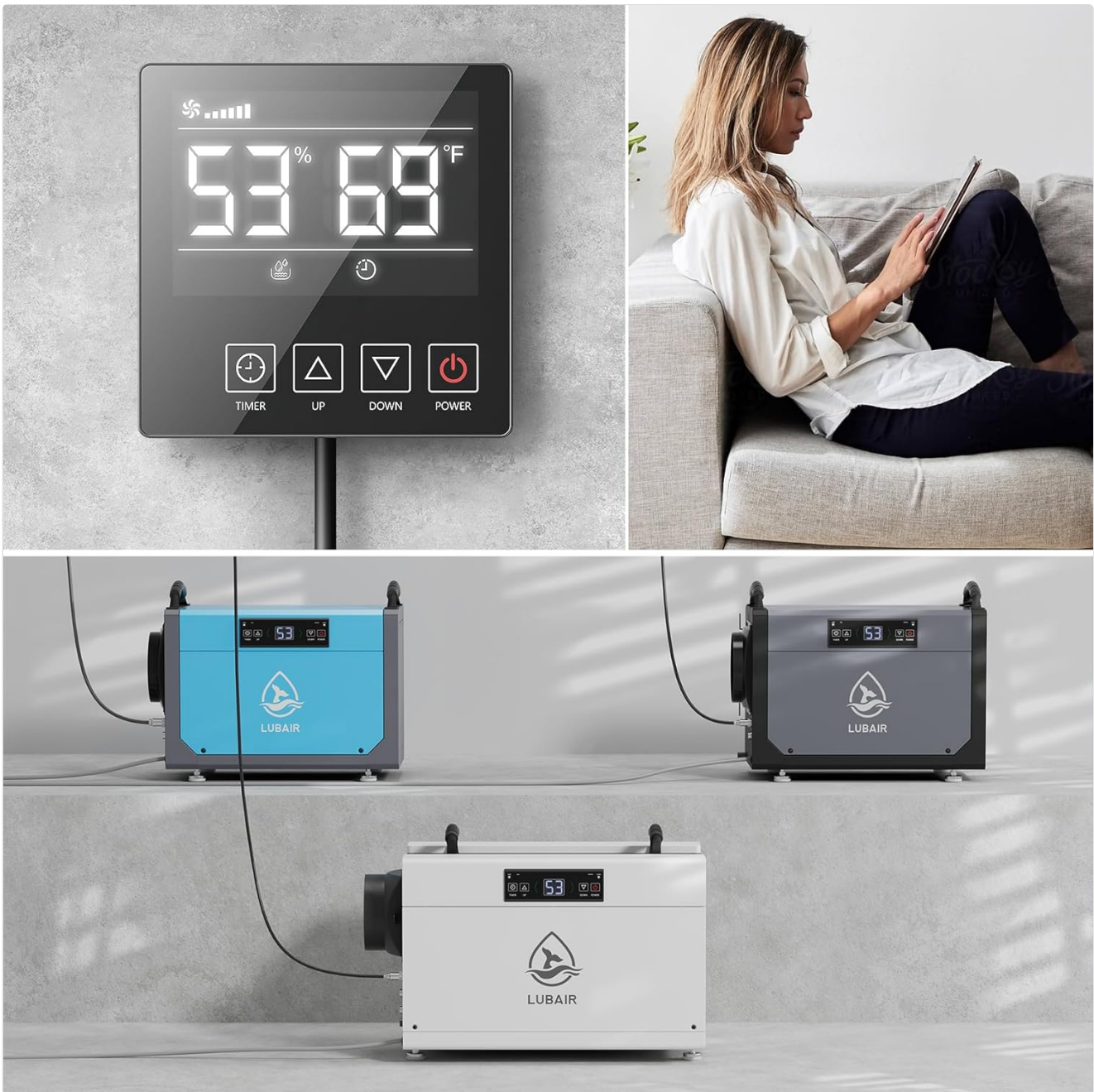
Image 5.2: The LUBAIR Remote Controller displayed alongside three different LUBAIR dehumidifier models (DY113, DY120, DY145), illustrating its compatibility.