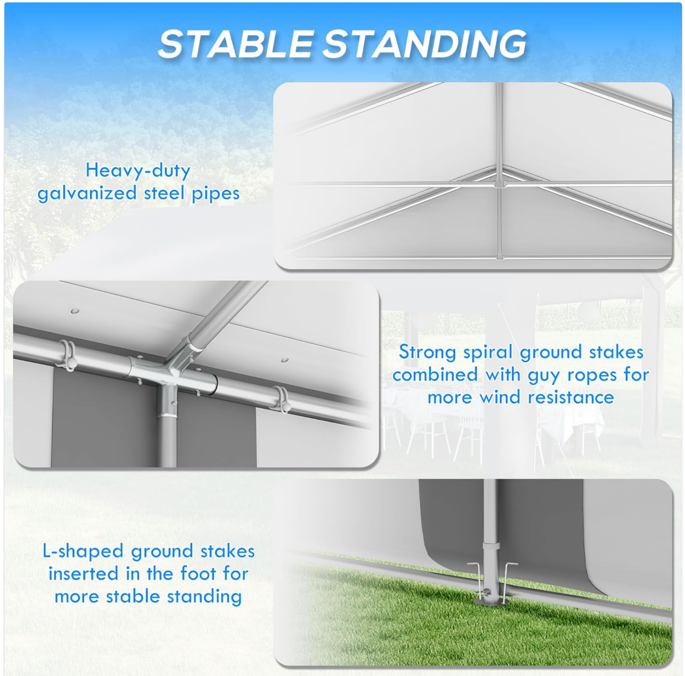
Figure 3: Close-up view of the heavy-duty galvanized steel pipes, strong spiral ground stakes, and L-shaped ground stakes, illustrating the tent's stable construction elements.

Begin by assembling the galvanized steel frame. Connect the poles using the provided connectors, ensuring all snap pins are securely engaged. Follow the structural diagram to build the base, then the uprights, and finally the roof structure.