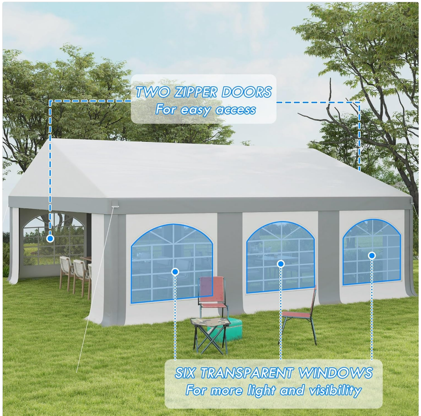
Figure 4: A diagram highlighting the two zippered doors for easy access and the six transparent window panels designed to allow light and visibility.

aligned. The sidewalls typically attach with Velcro strips or similar fasteners.