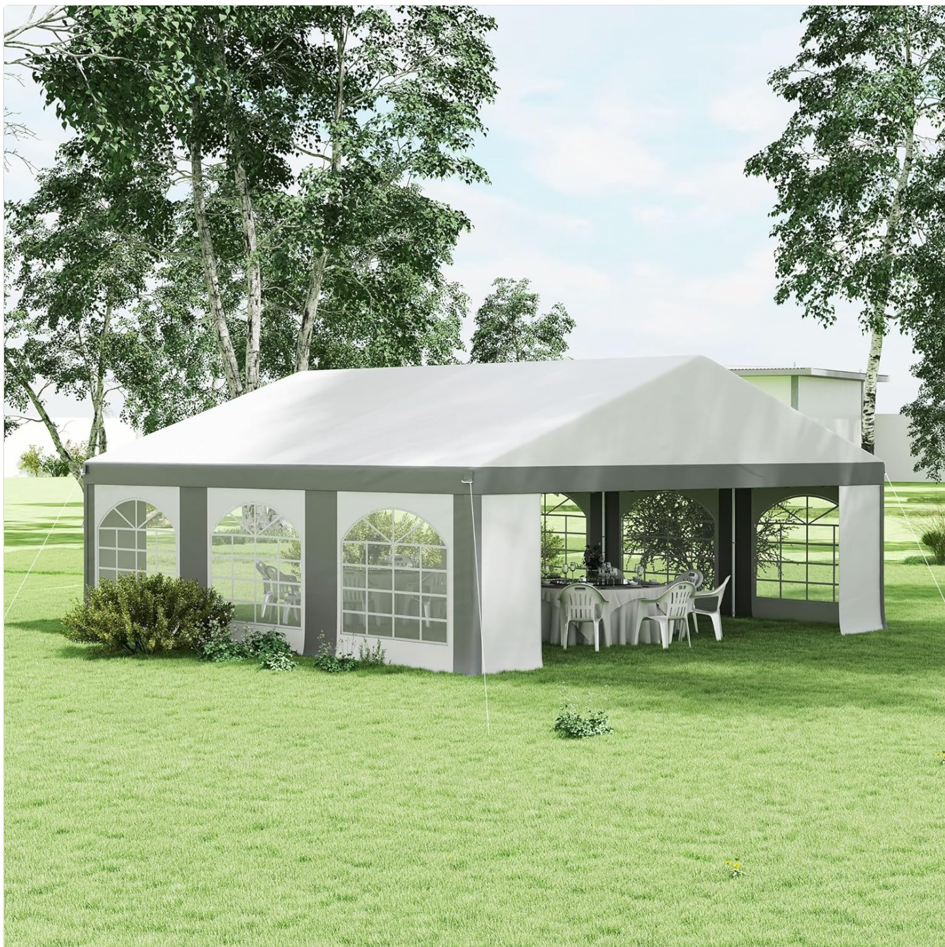
Figure 2: The Outsunny party tent set up in a grassy outdoor area, demonstrating its large coverage and suitability for events.