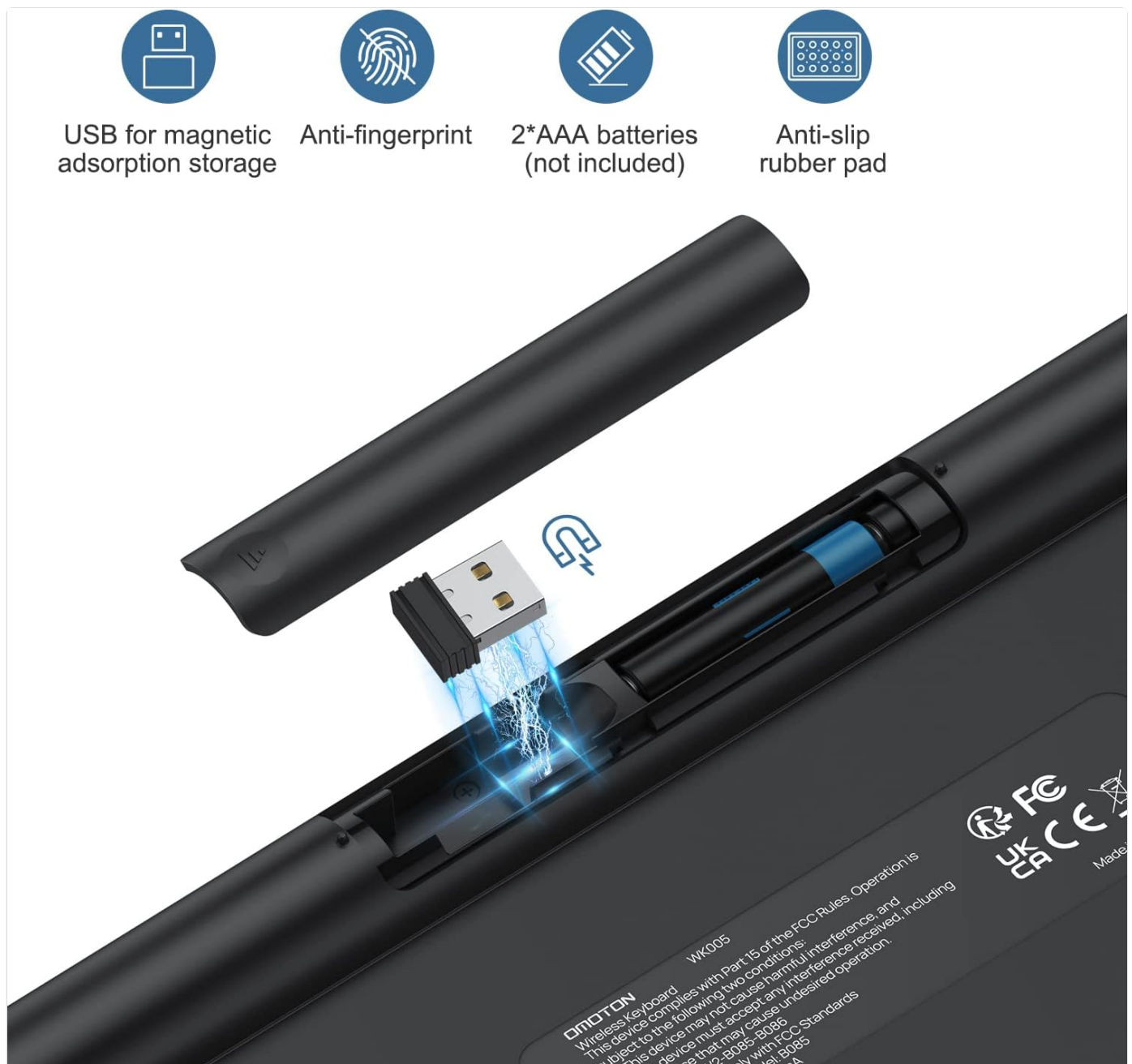
Figure 4.1: The USB receiver is conveniently stored in the recess of the keyboard battery compartment. Open the battery cover to access it.