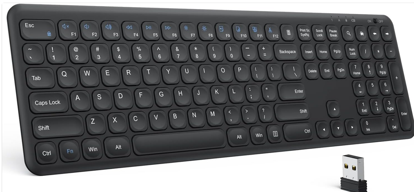
Figure 5.1: The OMOTON Wireless Keyboard features a full 110-key layout, including a numeric keypad, designed for comprehensive task completion.