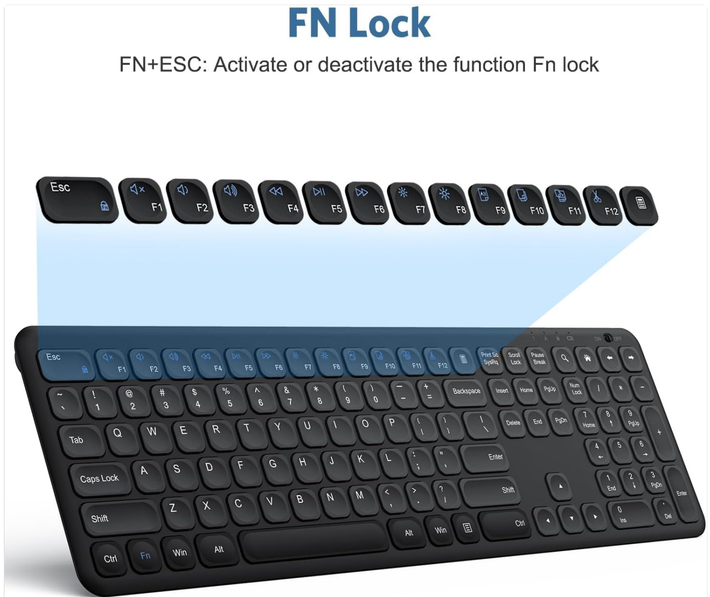
Figure 5.3: The Fn Lock feature allows direct access to 12 media keys for functions such as volume control, media playback, and office shortcuts, eliminating the need for Fn+F1-F12 combinations.

The keyboard is equipped with 12 media hotkeys for quick access to functions like volume adjustment, playback control, and common office shortcuts (copy, paste, cut). With the Fn lock feature, you can directly use these media keys without needing to press the Fn key simultaneously with F1-F12.