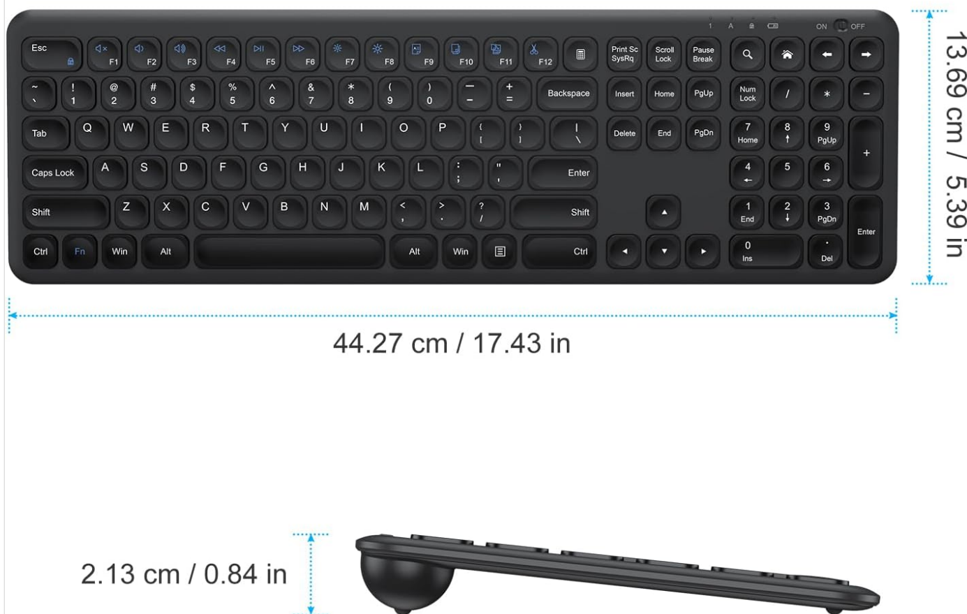
Figure 5.2: The keyboard's dimensions are 44.27 cm (17.43 in) in length, 13.69 cm (5.39 in) in width, and 2.13 cm (0.84 in) in height, highlighting its full-size and ultra-slim design.