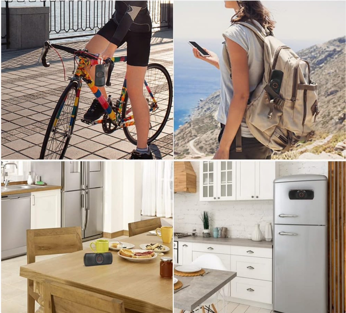
Figure 3: Powerful Audio Output

This image illustrates the device's 3W 4Ω loudspeaker, emphasizing its powerful and clear audio quality with echo reduction and noise cancellation.