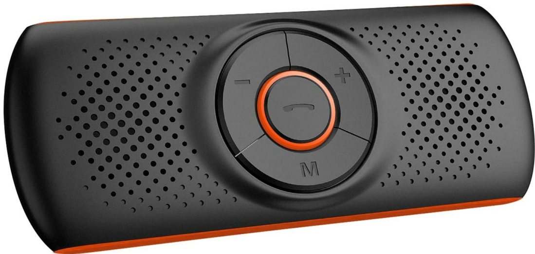
Figure 1: Aigoss Bluetooth Car Handsfree Kit

This image displays the Aigoss Bluetooth Car Handsfree Kit, showcasing its compact design and central control buttons.