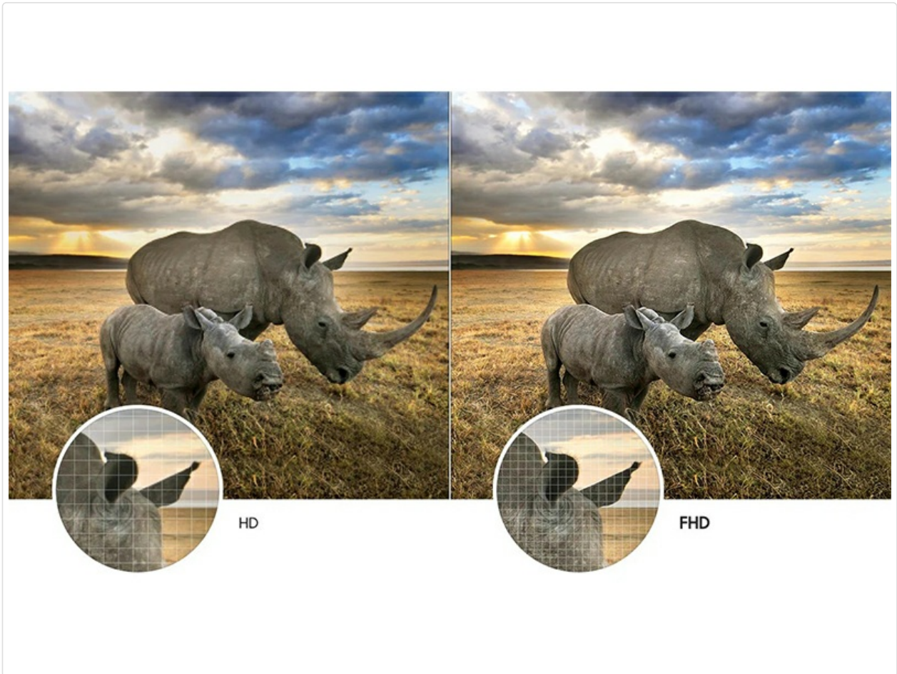
Comparison image showing the difference between HD and Full HD resolution, with Full HD offering greater detail.