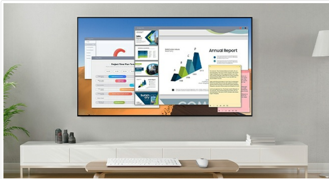
Image showing the "PC on TV" feature, displaying multiple desktop windows on the television screen.

Use the Source menu to switch between connected devices. The TV also supports features like 'PC on TV' for remote access to your computer.