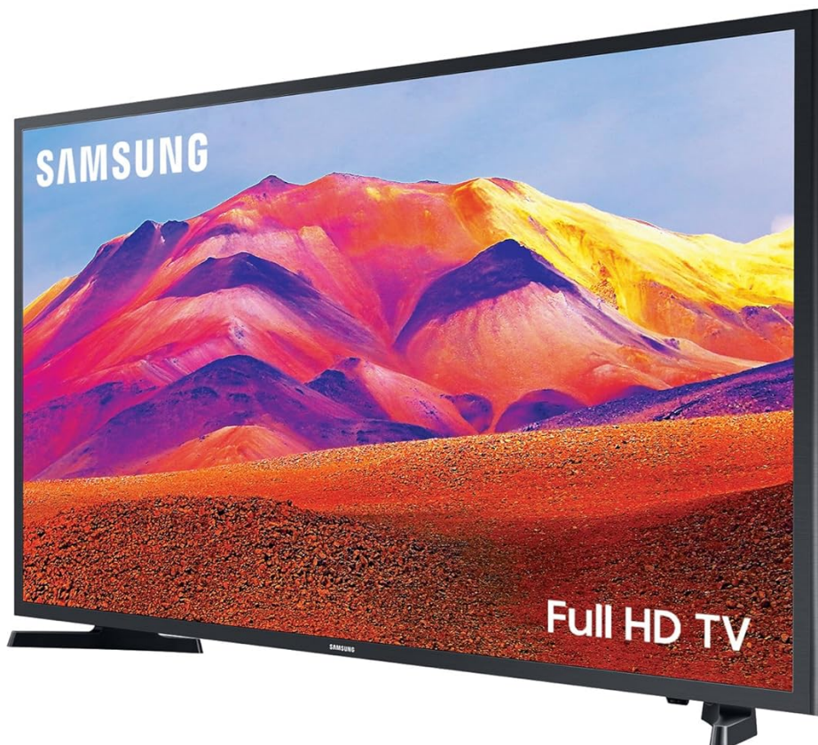
Angled front-right view of the Samsung Full HD Smart TV, showing the attached stand.

Place the TV screen face down on a soft, flat surface. Align the stand base with the slots on the bottom of the TV and secure it with the provided screws. Ensure the stand is firmly attached before placing the TV upright.