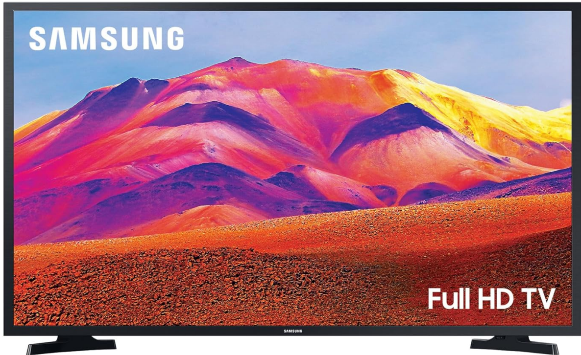
Front view of the Samsung Full HD Smart TV.