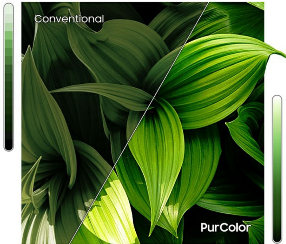
Image demonstrating the wider color spectrum achieved with PurColor technology versus conventional color processing.