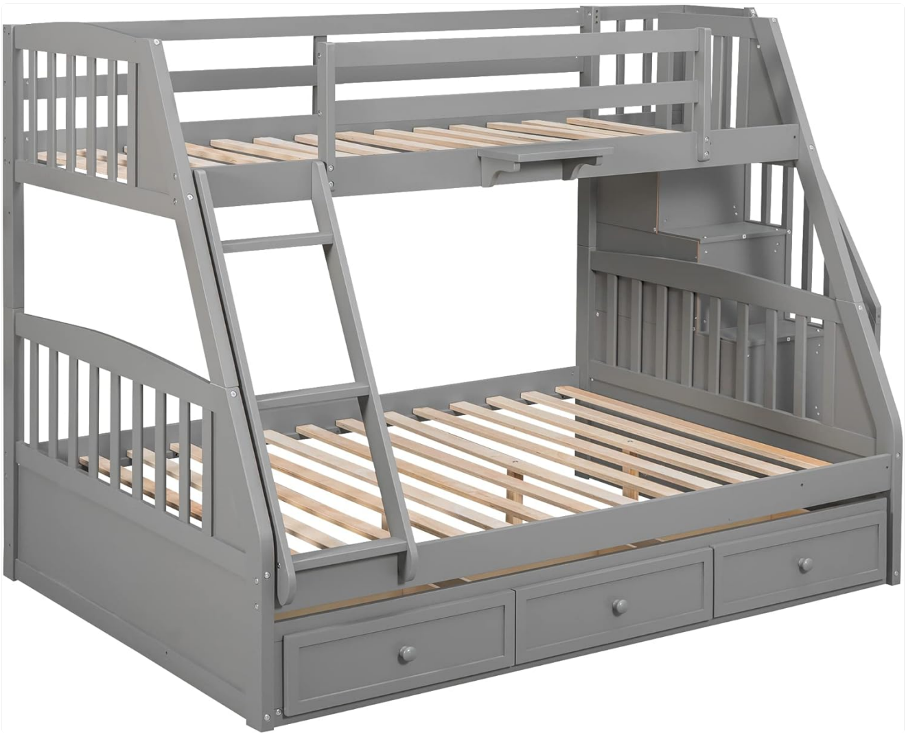
Image: A close-up view of the Bellemave bunk bed's integrated staircase, highlighting the functional shelves built into the side for storage or display.