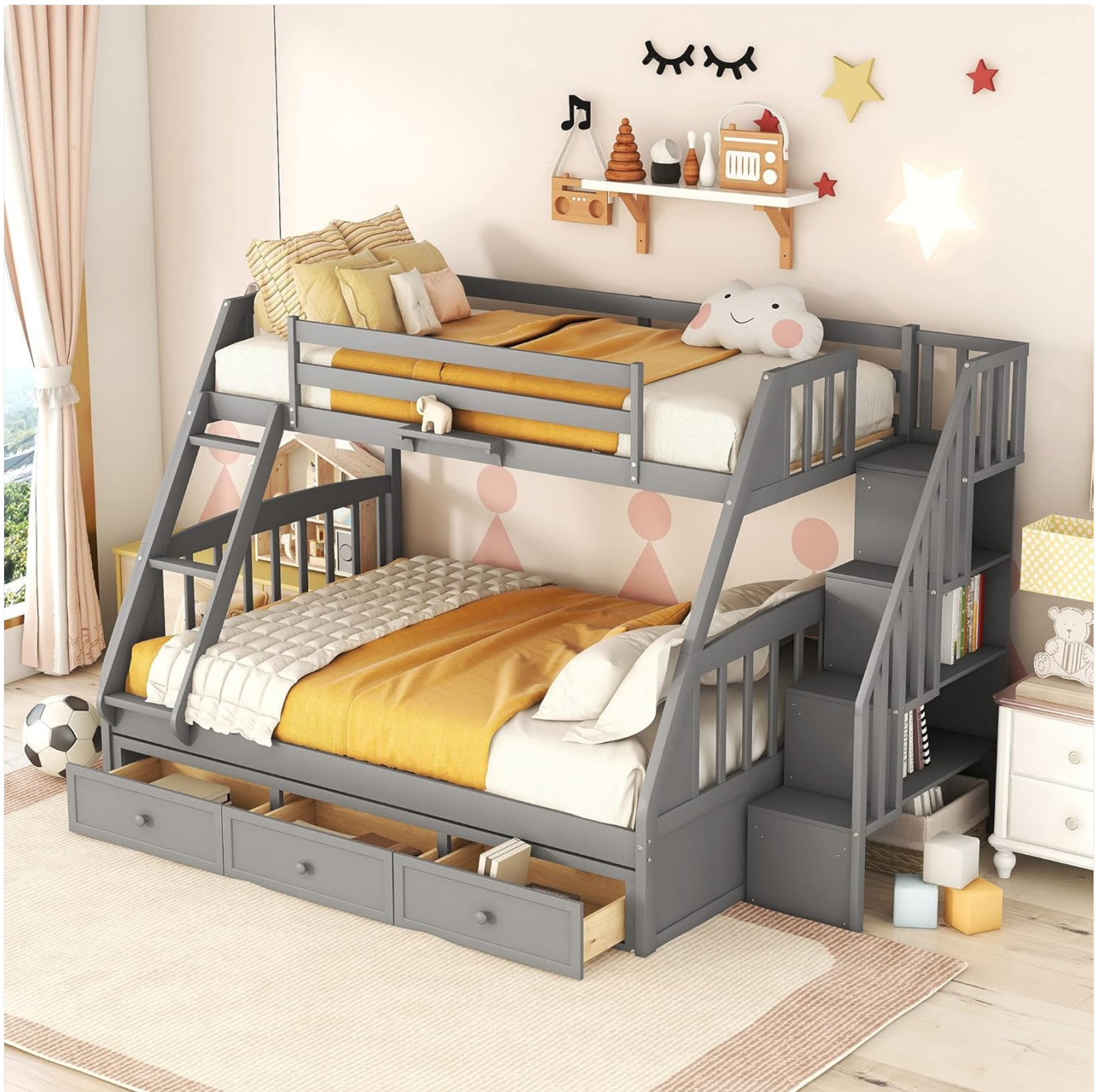
Image: The Bellemave Twin Over Full Bunk Bed in gray, showcasing its twin upper bunk, full lower bunk, integrated staircase with shelves, and three under-bed storage drawers.