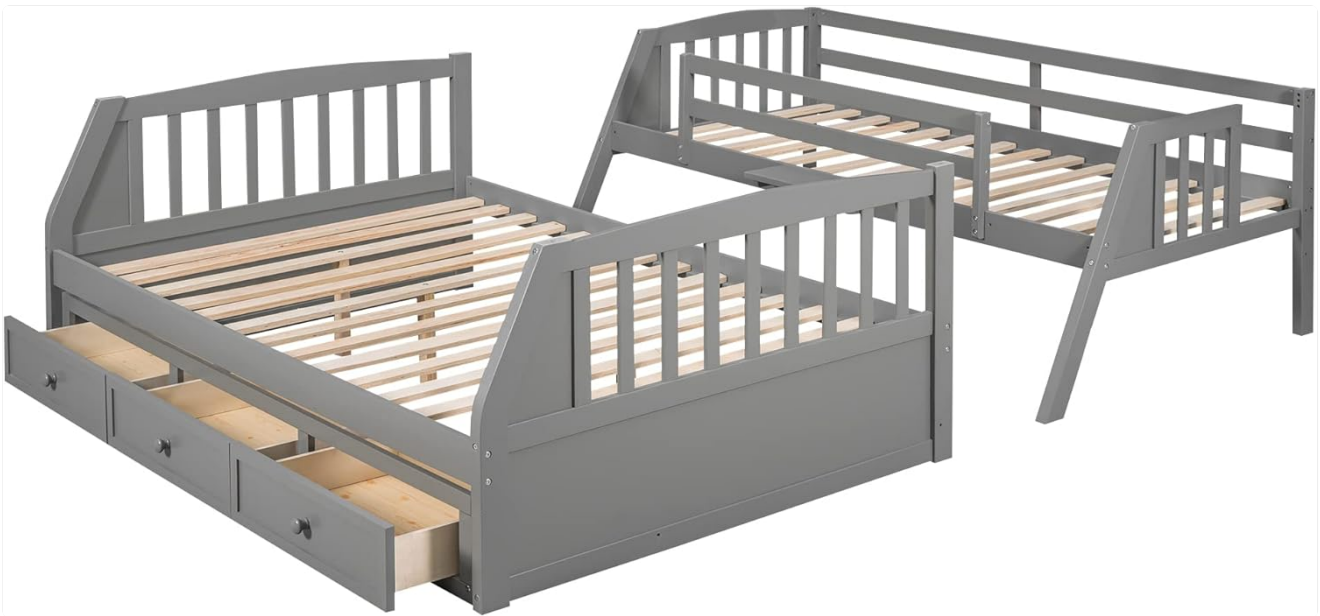
Image: The Bellemave bunk bed disassembled, showing how it can be converted into two separate beds: a twin bed and a full bed, offering flexible room arrangements.