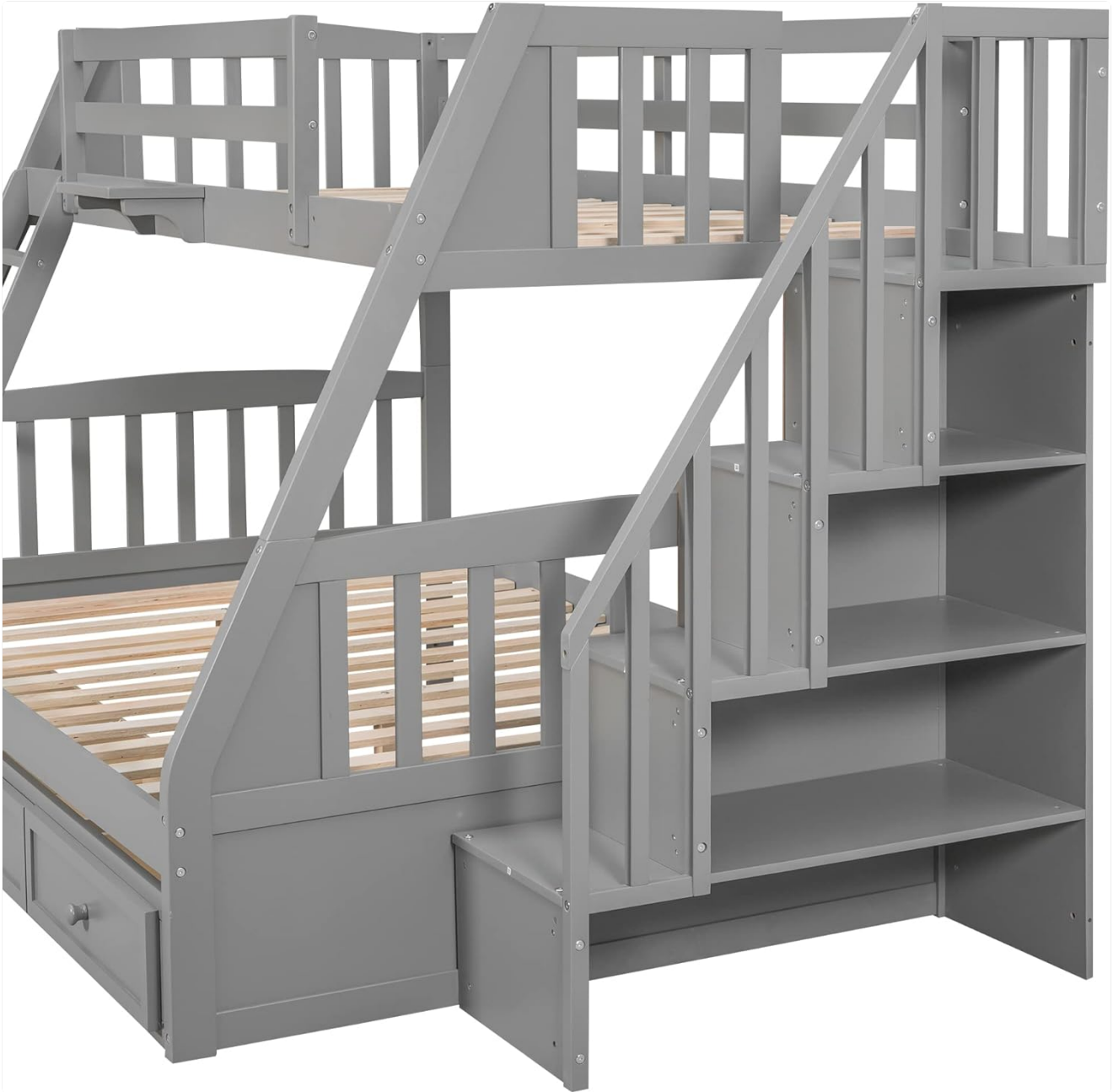
Image: A detailed view of the Bellemave bunk bed, highlighting the three spacious storage drawers beneath the lower bunk, shown in an open position.

Before beginning assembly, ensure all parts and hardware are present and undamaged. Refer to the packing list provided with your product for a complete inventory. Hardware is typically packed in separate, labeled bags for easy identification.