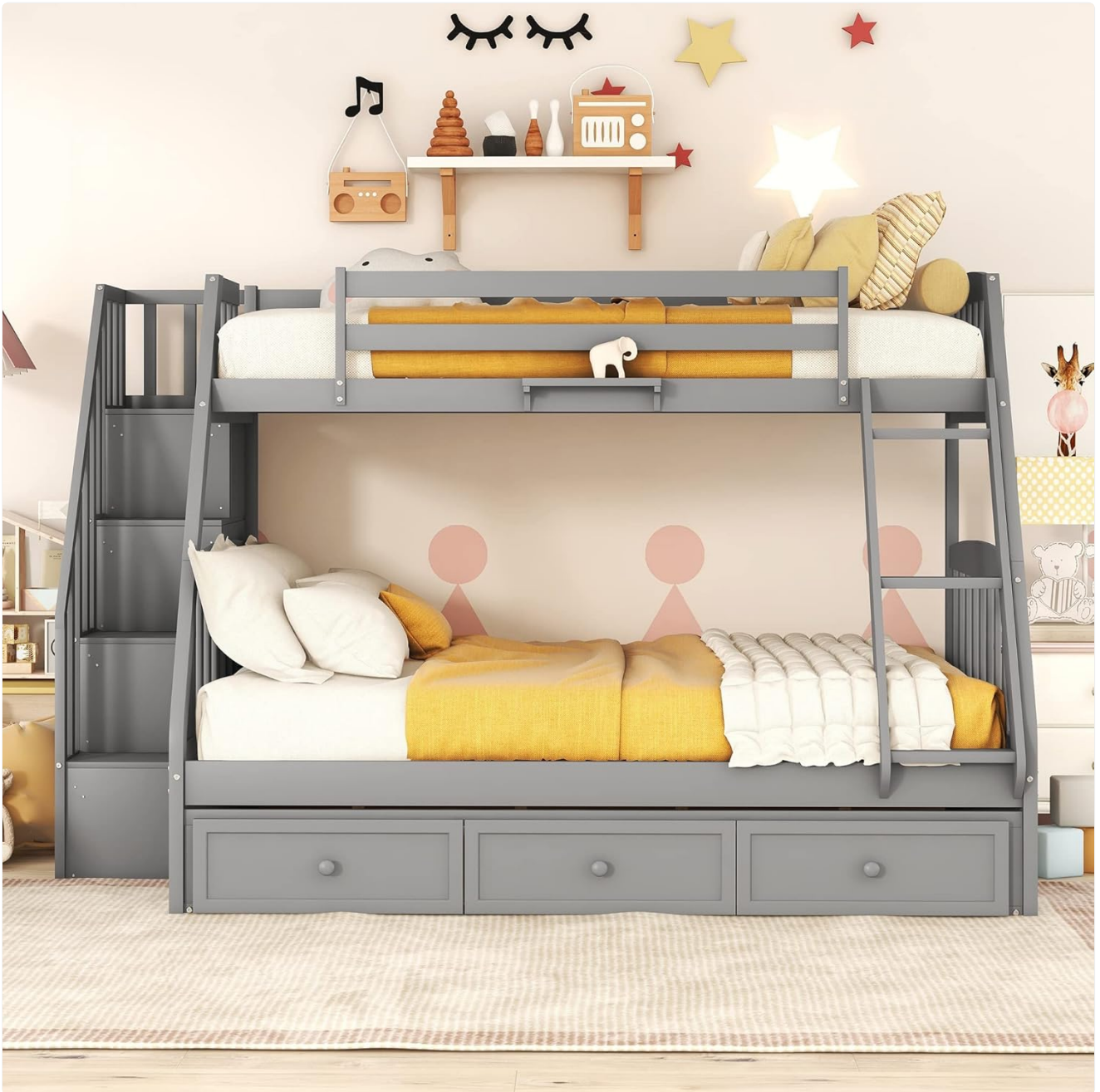
Image: The Bellemave bunk bed viewed from an angle, showing both the side ladder and the integrated staircase with shelves, demonstrating its dual access options.