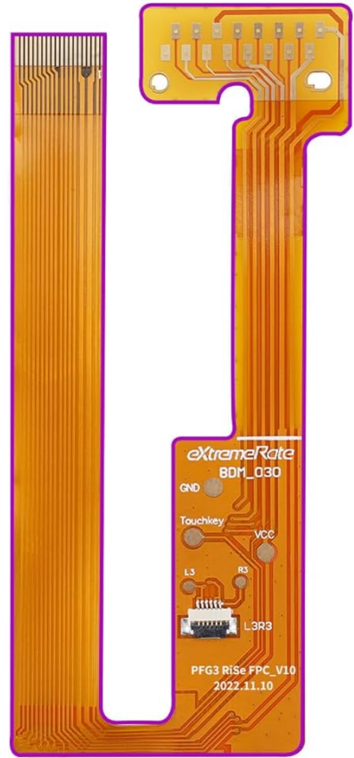
Image: Detailed view of the internal components for BDM-030 and BDM-040 models.