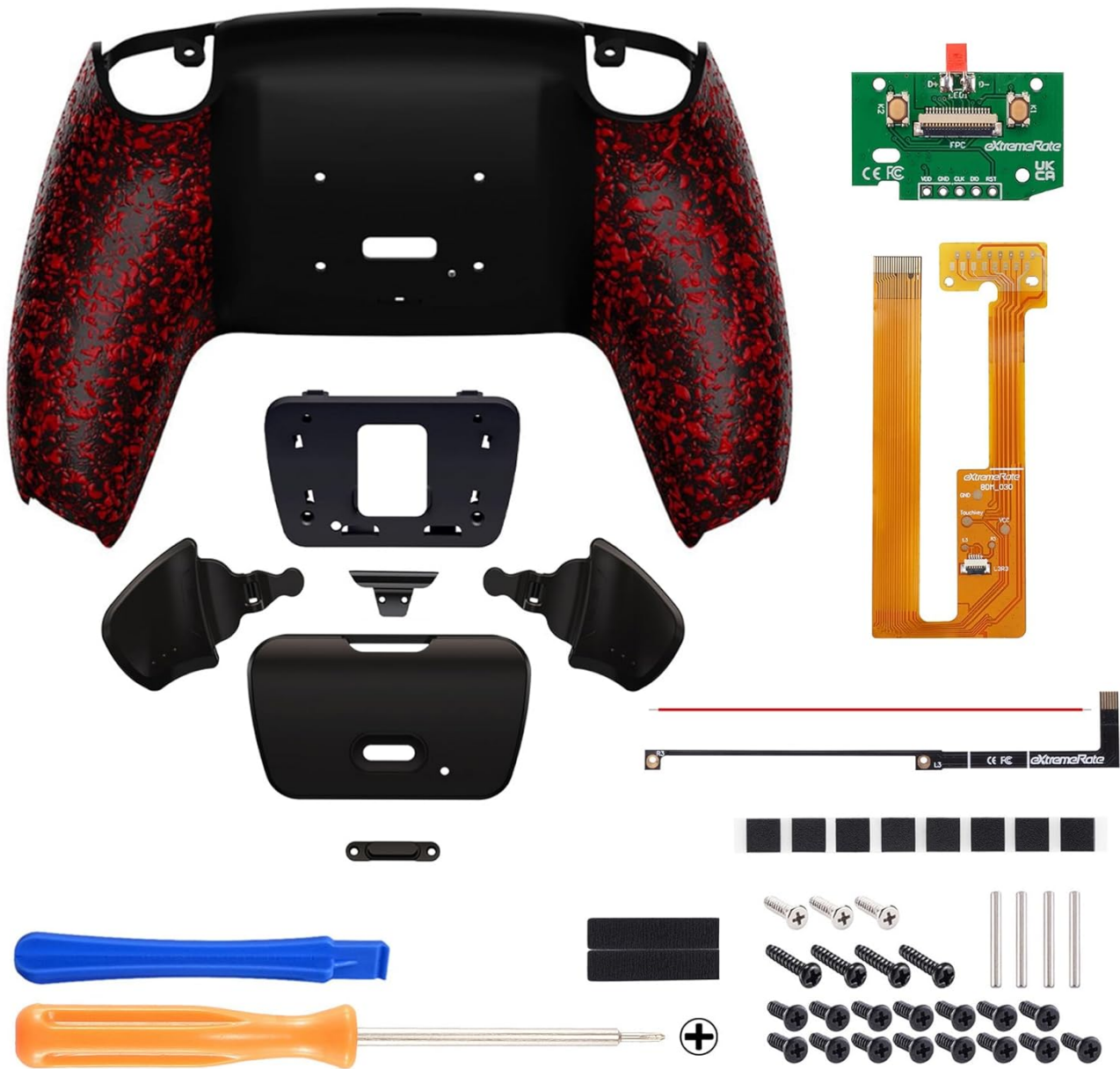
Image: Contents of the eXtremeRate RISE Remap Kit, showing all parts required for the modification.