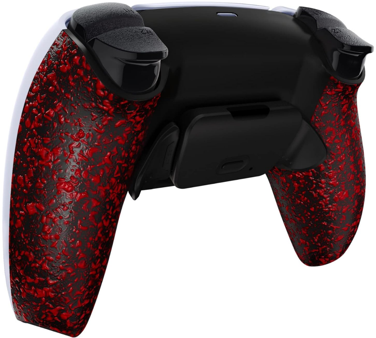
Image: Internal view of the controller with the remap board and paddle attachment.