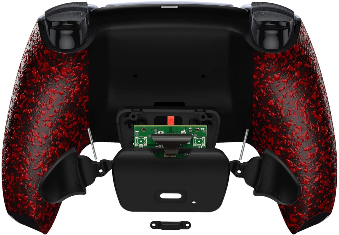
Image: Key features on the back attachment: LED Indicator, Setting Button, and Back Buttons.

Your browser does not support the video tag.