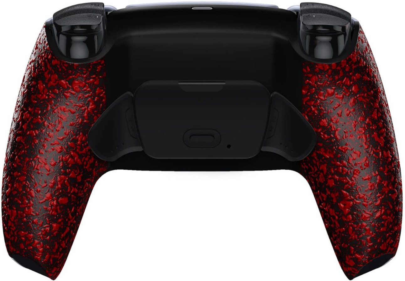
Image: PS5 controller with the eXtremeRate RISE Remap Kit installed, featuring textured red back paddles.