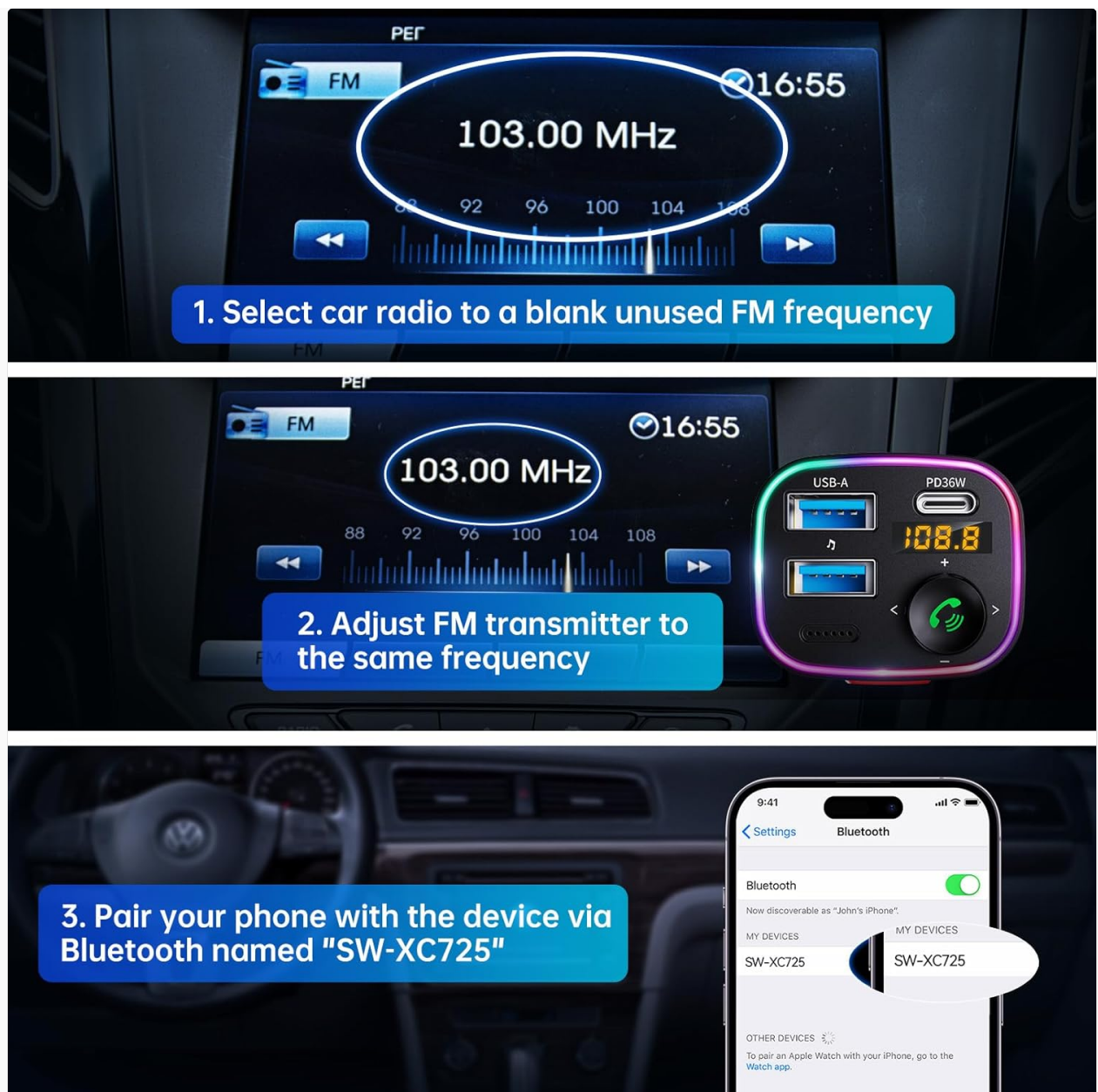
Image: Illustration showing how to adjust the FM transmitter's frequency to match the car radio's frequency.