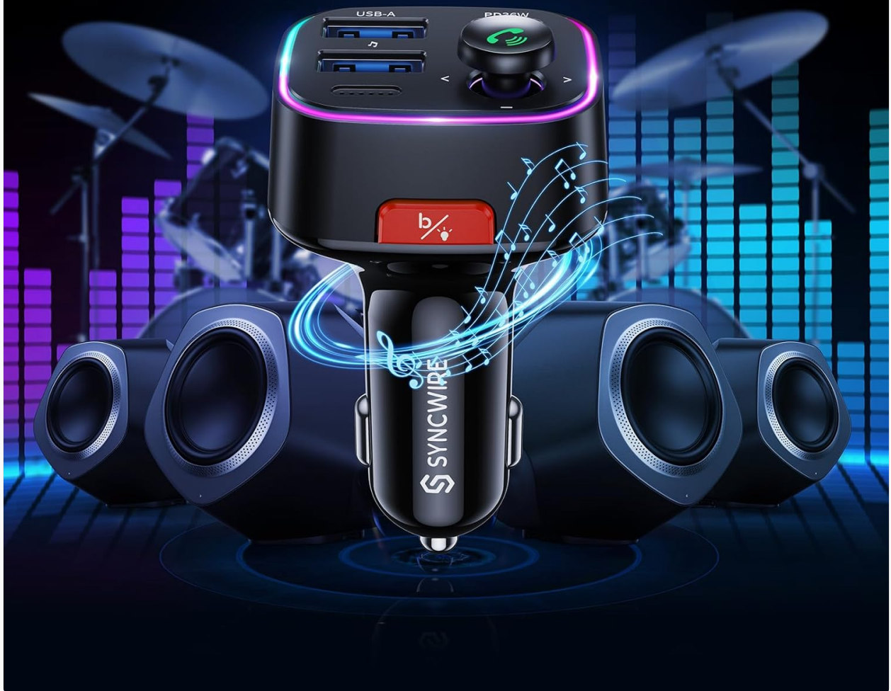
Image: Visual demonstrating the Hi-Fi Deep Bass feature with musical notes and colorful ambient light.