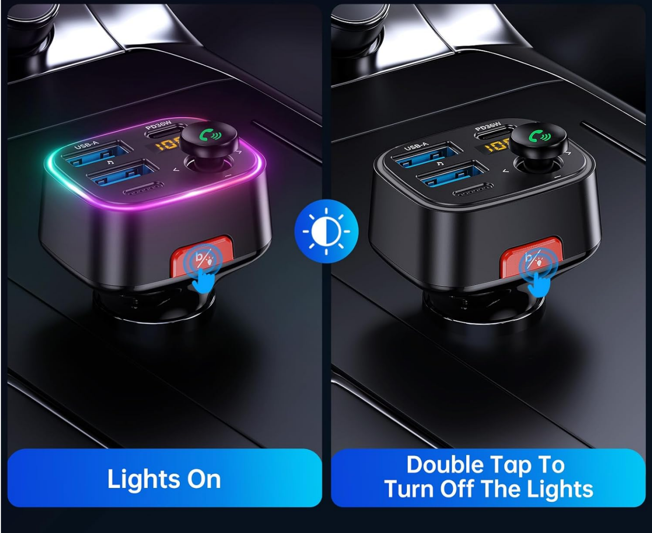
Image: Depiction of the ambient LED light being turned on and off by double-tapping the red button.