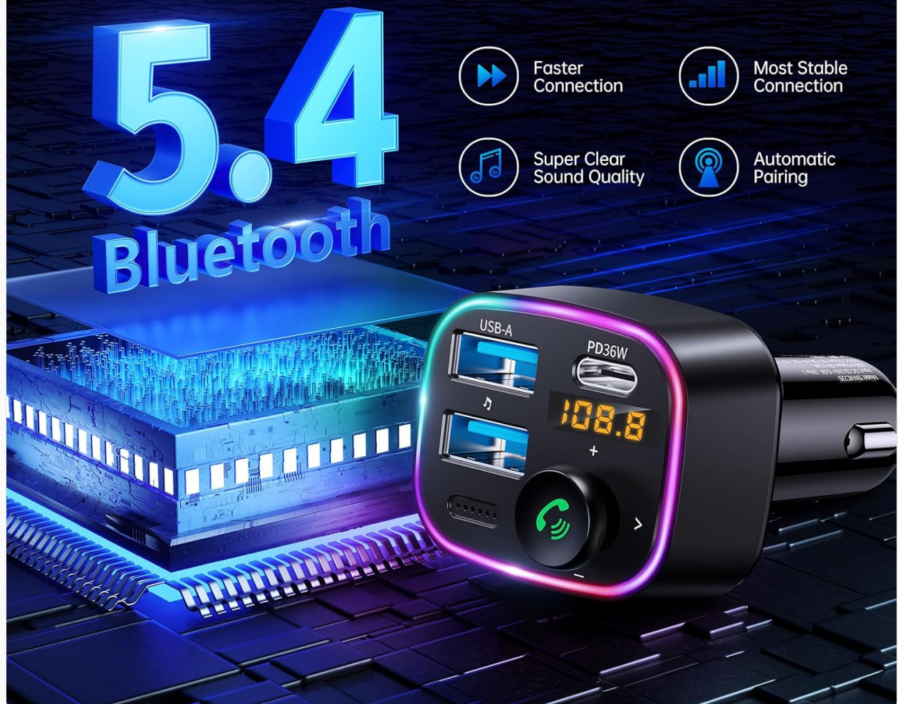
Image: Diagram highlighting the benefits of Bluetooth 5.4 technology, including faster and more stable connections, super clear sound quality, and automatic pairing.