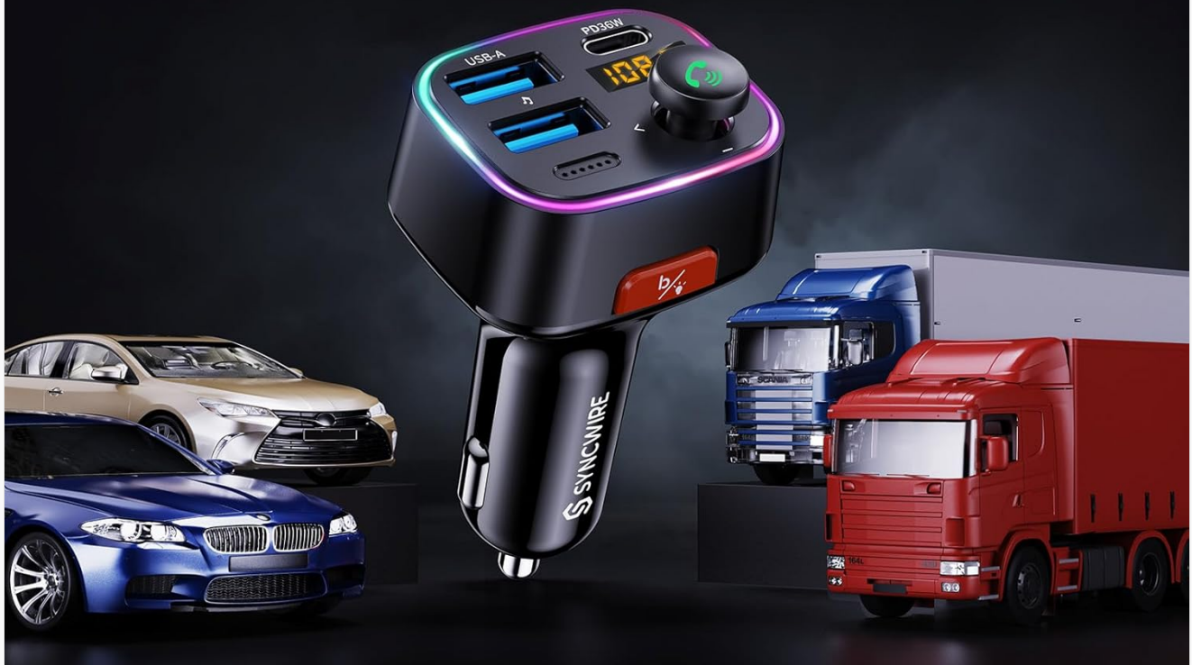
Image: The Syncwire charger in a car setting, demonstrating its universal super fast charging capability for various devices and vehicle types.