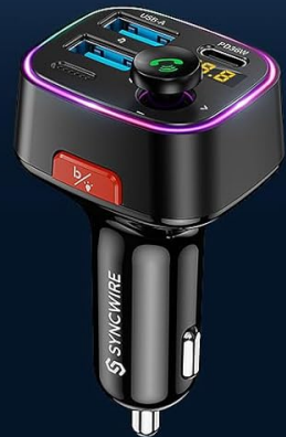
Image: Visual representation of U-Disk playing functionality and Bluetooth 5.4 connection for music playback.