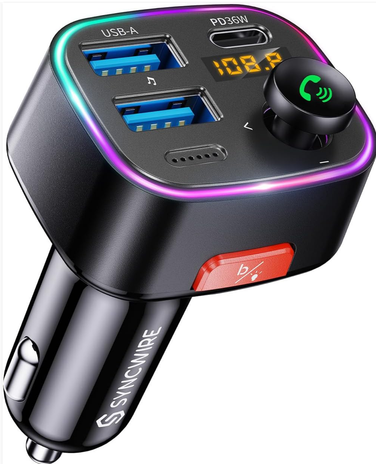
Image: Front view of the Syncwire Bluetooth FM Transmitter Car Adapter, showing the USB ports, LED display, control knob, and light switch button.

The Syncwire SW-XC725 features a compact design that plugs into your car's cigarette lighter socket. It includes: