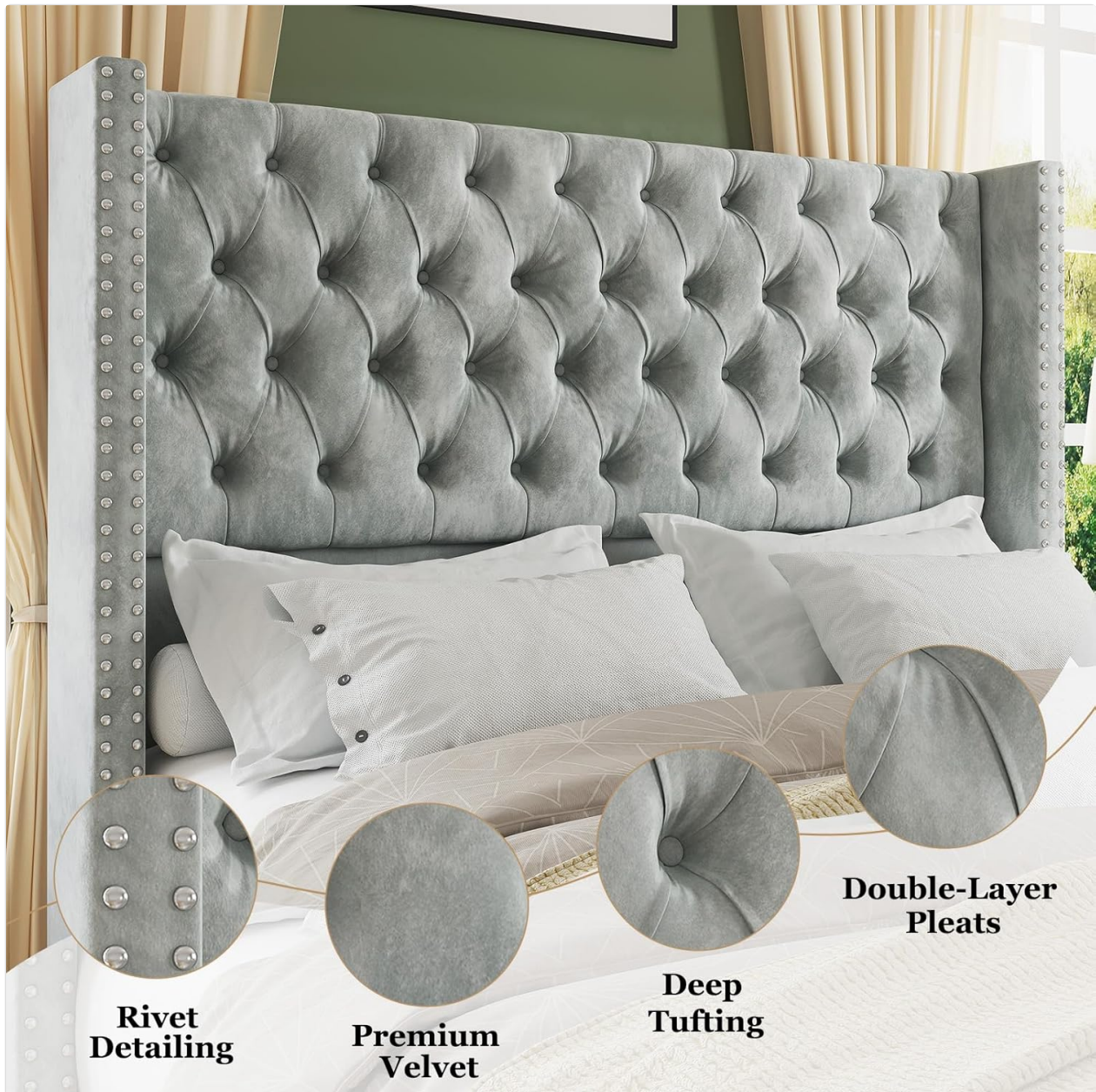
Image: Detailed view of the tufted velvet headboard with elegant rivet accents.