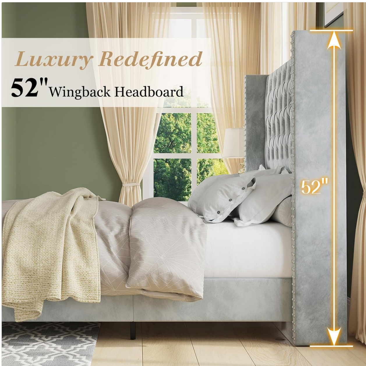
Image: The impressive 52-inch height of the wingback headboard.