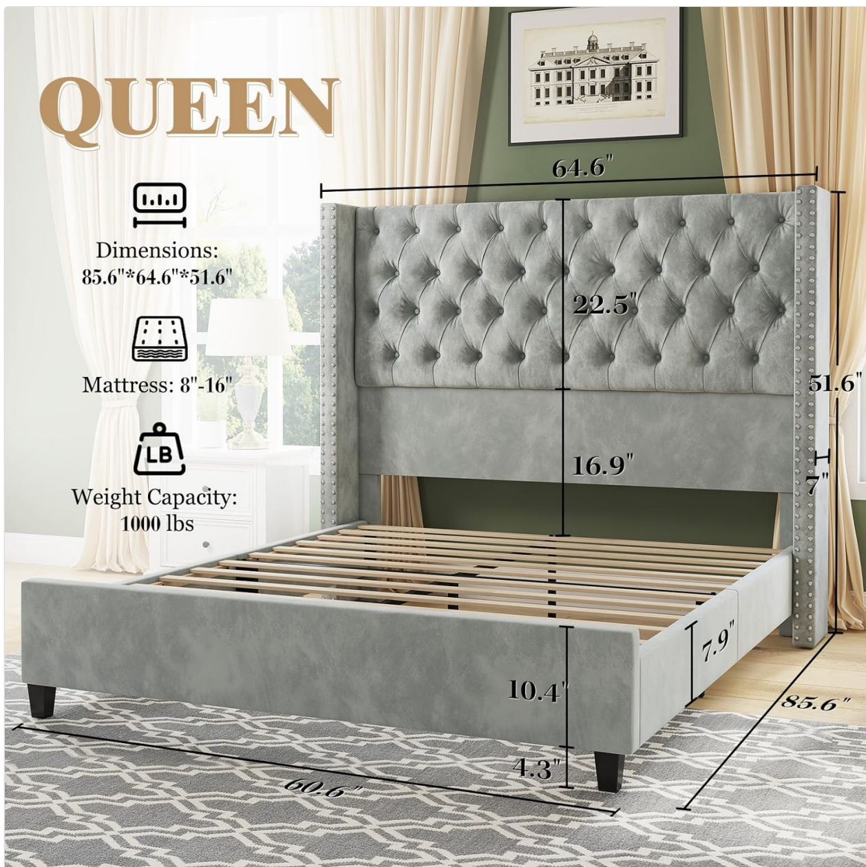
Image: Dimensions of the Queen size bed frame and recommended mattress thickness (8-16 inches).