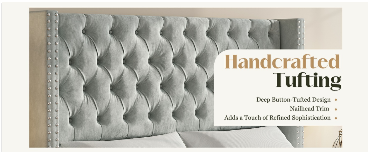
Image: Handcrafted deep button tufting and pleats on the velvet headboard.

Your browser does not support the video tag.