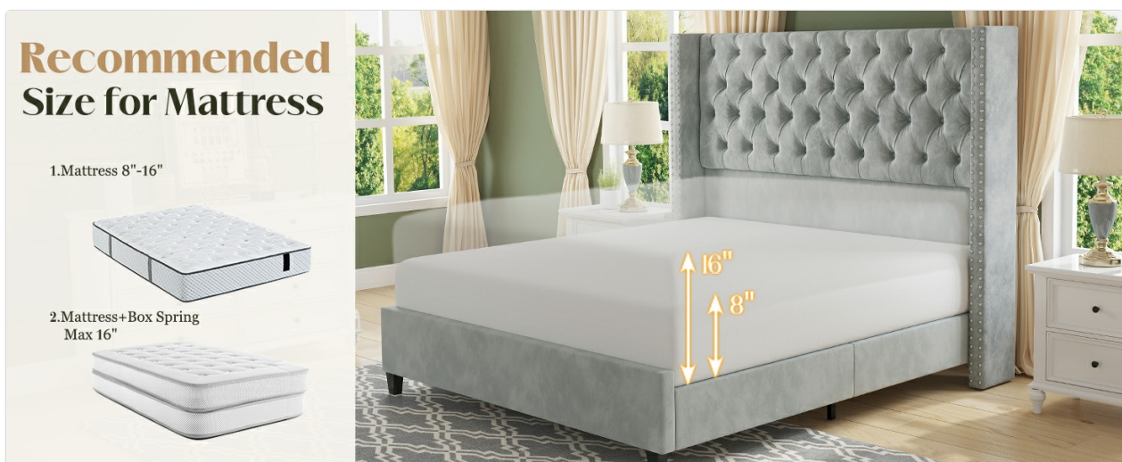
Image: Recommended mattress sizes for optimal fit and comfort.