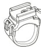
Rack de Poignée