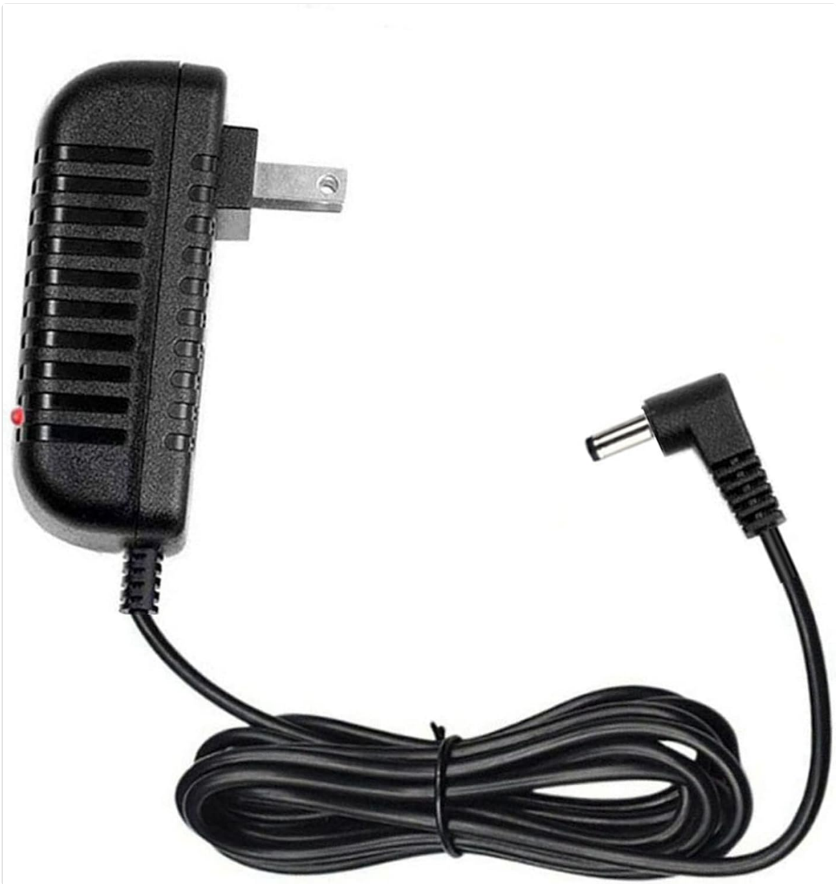
Figure 2.1: Overview of the MYW-Tech AC DC Adapter, showing the main unit, power cord, and output connector.