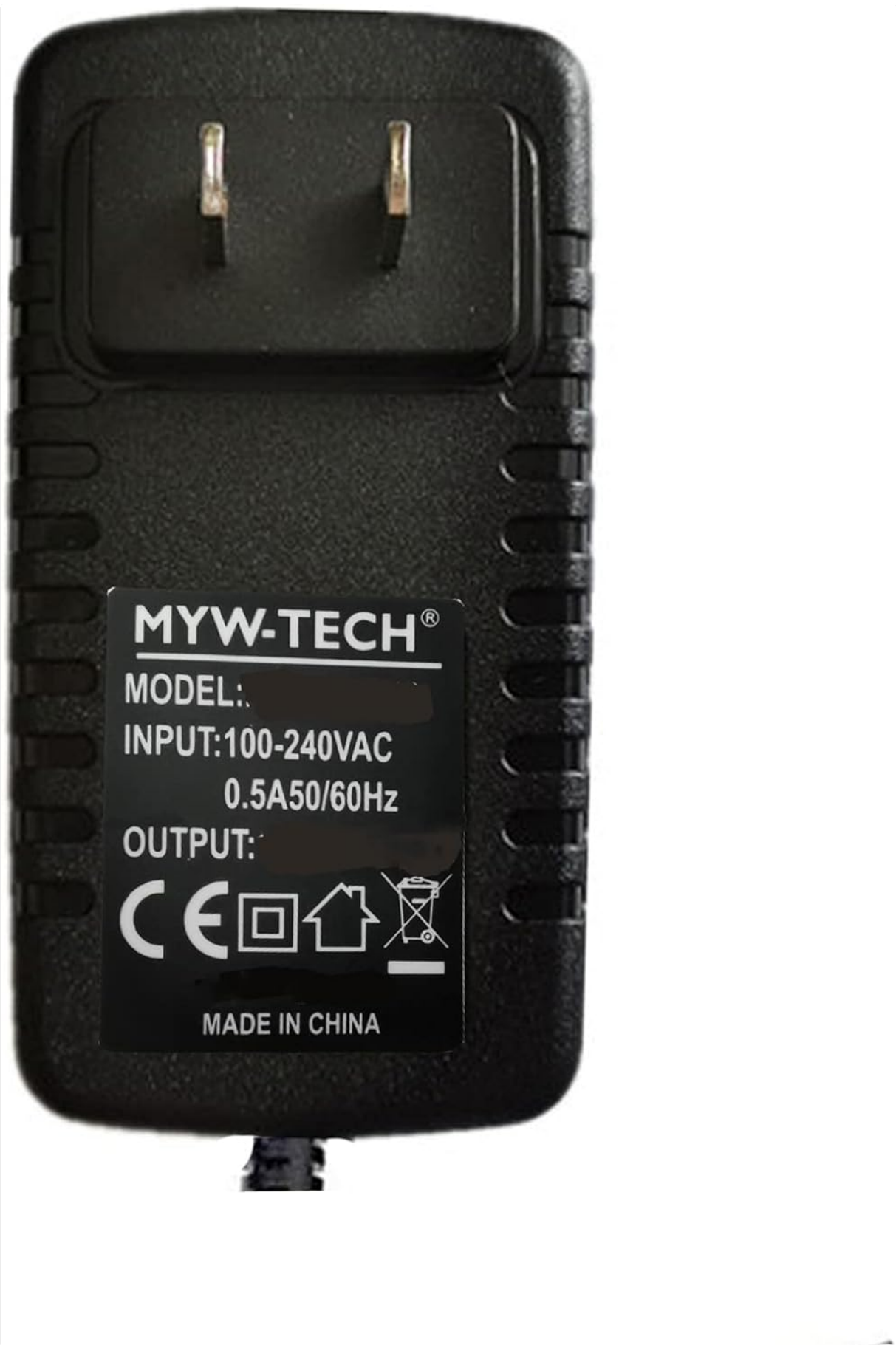
Figure 2.2: Detailed view of the adapter's label, indicating MYW-Tech branding, input specifications, and safety certifications.