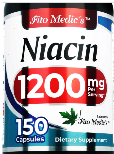
Image: Front view of the FITO MEDIC'S Niacin bottle, highlighting "Niacin 1200mg Per Serving*" and "150 Capsules".

FITO MEDIC'S Niacin is a high-quality dietary supplement providing Vitamin B3 (Niacin) in capsule form. Each serving delivers 1200 mg of Niacin, formulated for ultra-high absorption to support various bodily functions.