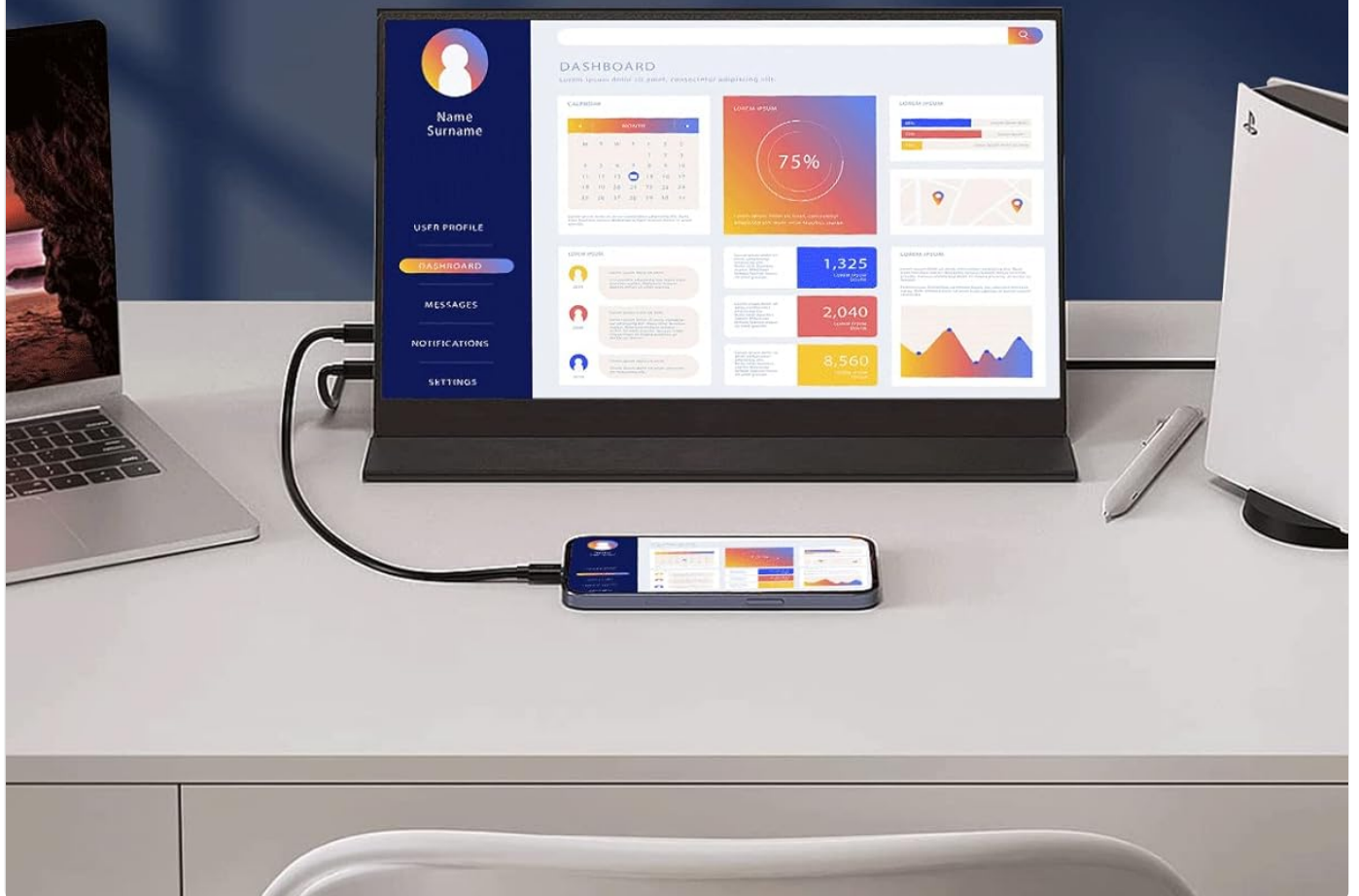
Example of a multi-screen setup, enhancing work efficiency with the portable monitor connected to a laptop.