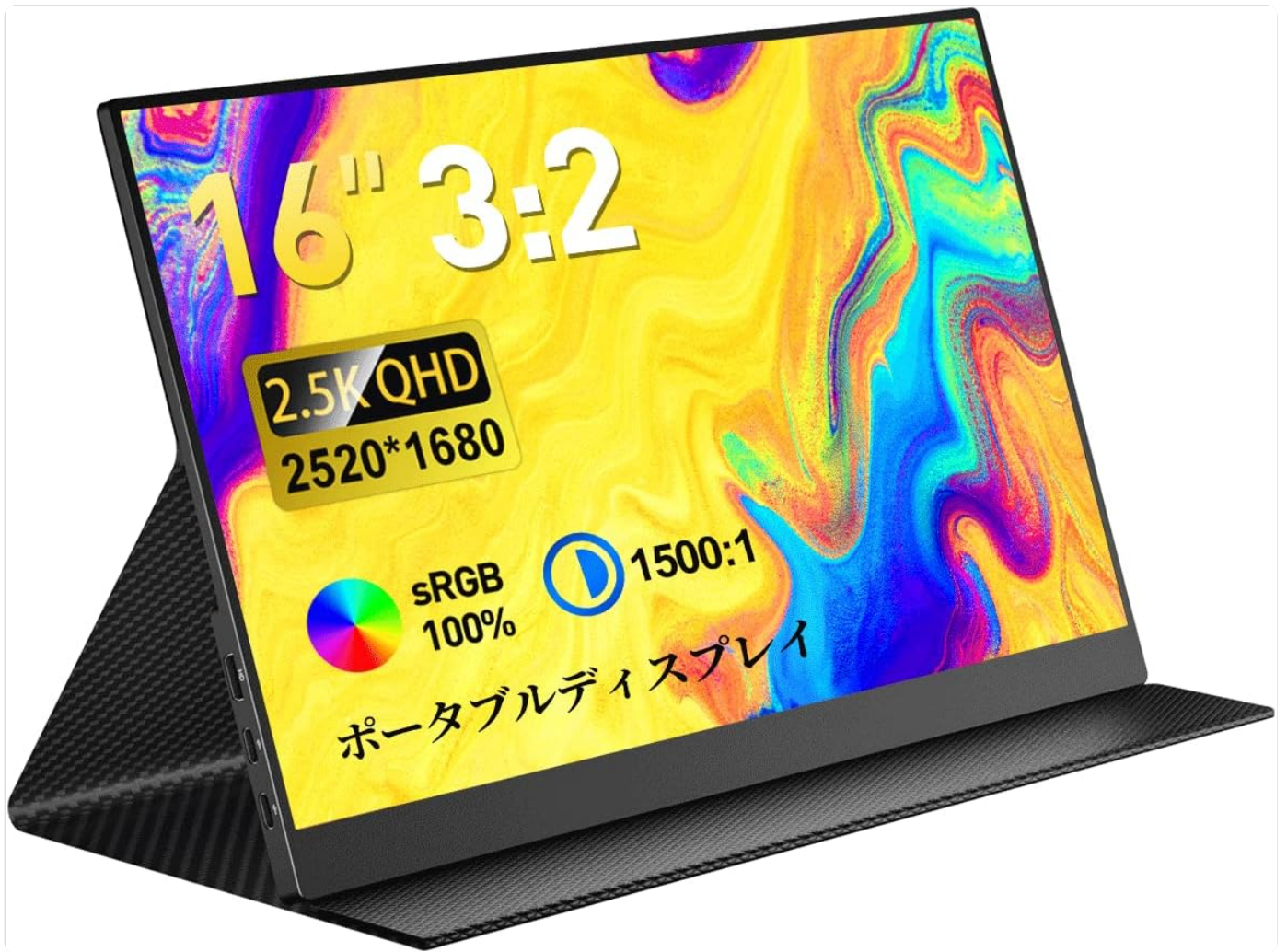
The CNBANAN 16-inch Portable Monitor, showcasing its 3:2 aspect ratio and 2.5K QHD resolution, designed for high-quality visual output.