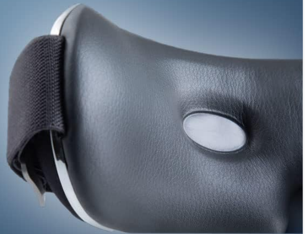
Image: A close-up showing the adjustable strap and the one-touch control button of the OSIM uVision Air Eye Massager.

Easy-to-clean leatherette with plush cushion that provides extra comfort and support for your eyes.